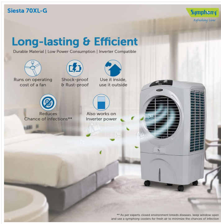
Image 4: Features emphasizing durability, low power, and clean air benefits.