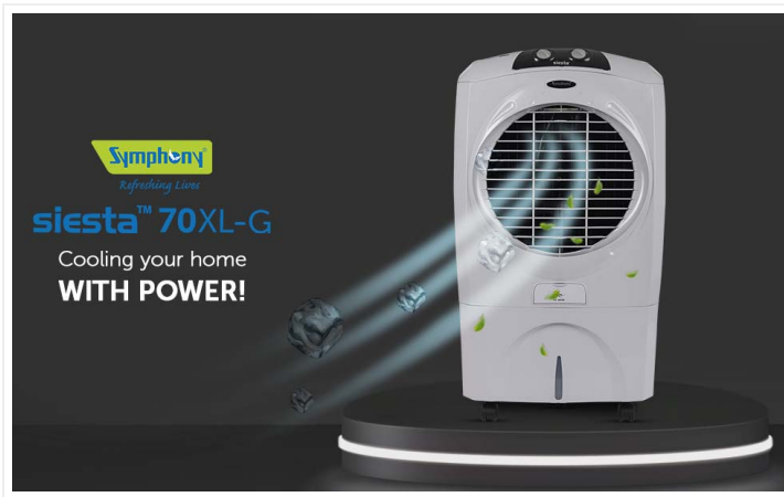
Image 1: The Symphony Siesta 70 XL cooler demonstrating its effective cooling coverage for a room up to 34 square meters.