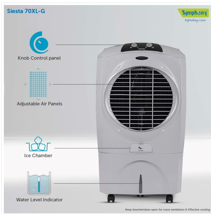
Image 5: Front panel details including controls, air panels, ice chamber, and water level indicator.