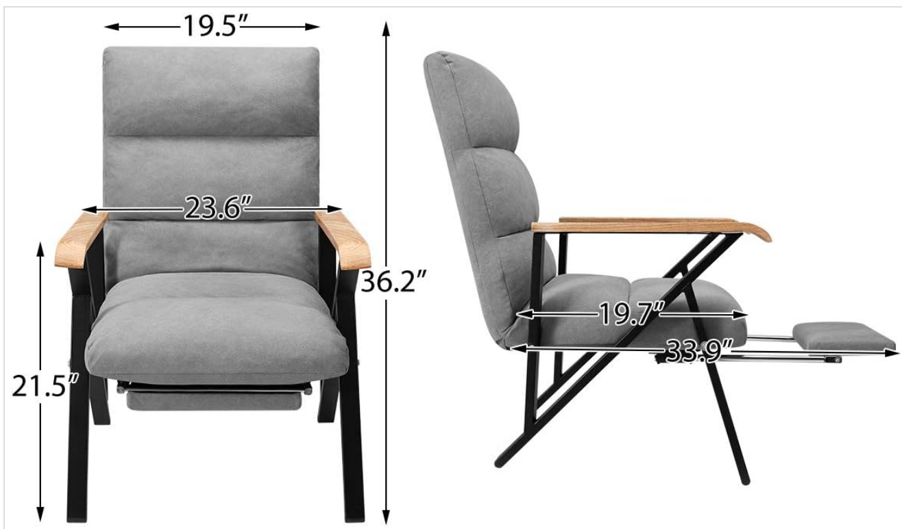
A diagram illustrating the chair's dimensions: 19.5 inches back width, 23.6 inches seat width, 36.2 inches total height, 21.5 inches seat height, 19.7 inches seat depth, and 33.9 inches total depth with footrest extended.