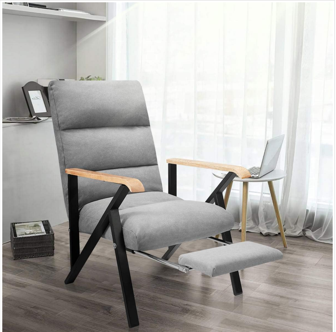
The EROMMY Accent Lounge Chair, fully assembled, showcasing its grey fabric, wooden armrests, and black metal frame, with the footrest extended.