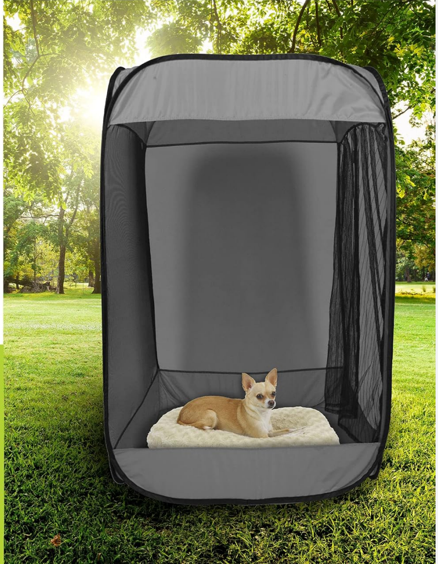
Image: The Magic Mesh Portable Pod demonstrating its easy pop-up design, shown outdoors with a small dog inside, highlighting its quick setup and suitability for pets.