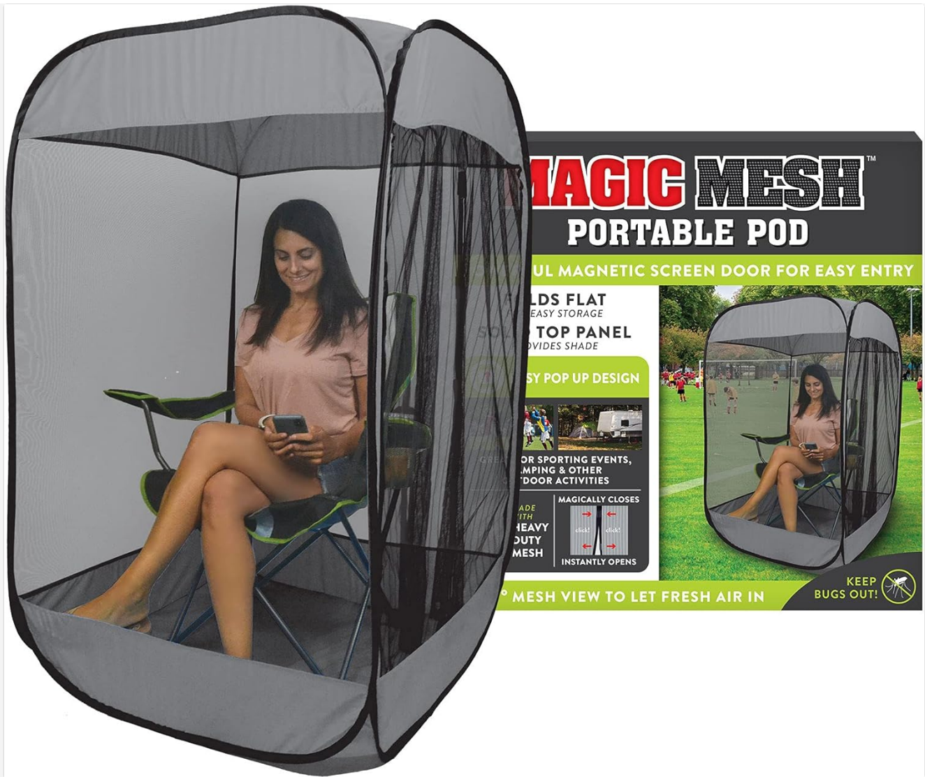
Image: A woman seated in a folding chair inside the Magic Mesh Portable Pod, illustrating the product's intended use as a personal, bug-free outdoor space.