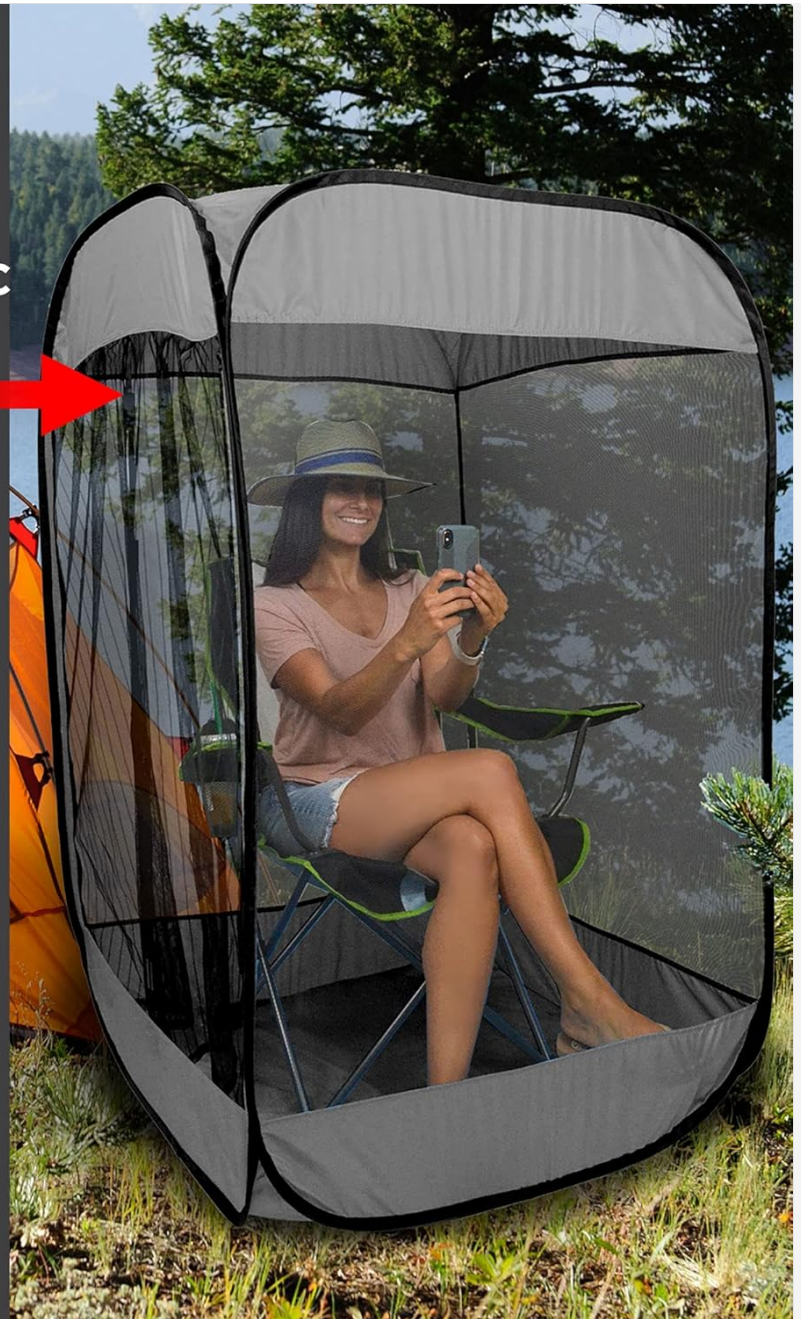
Image: A detailed view of the magnetic screen door mechanism, demonstrating how the magnets click together to close the opening, ensuring insect protection.