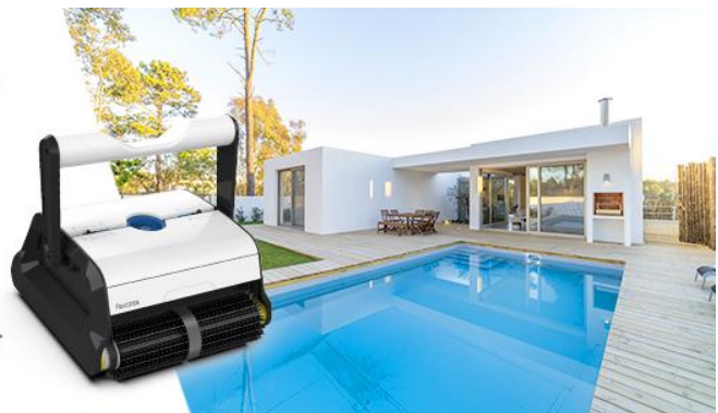
Image: Overview of the PAXCESS Robotic Pool Cleaner and its key features.