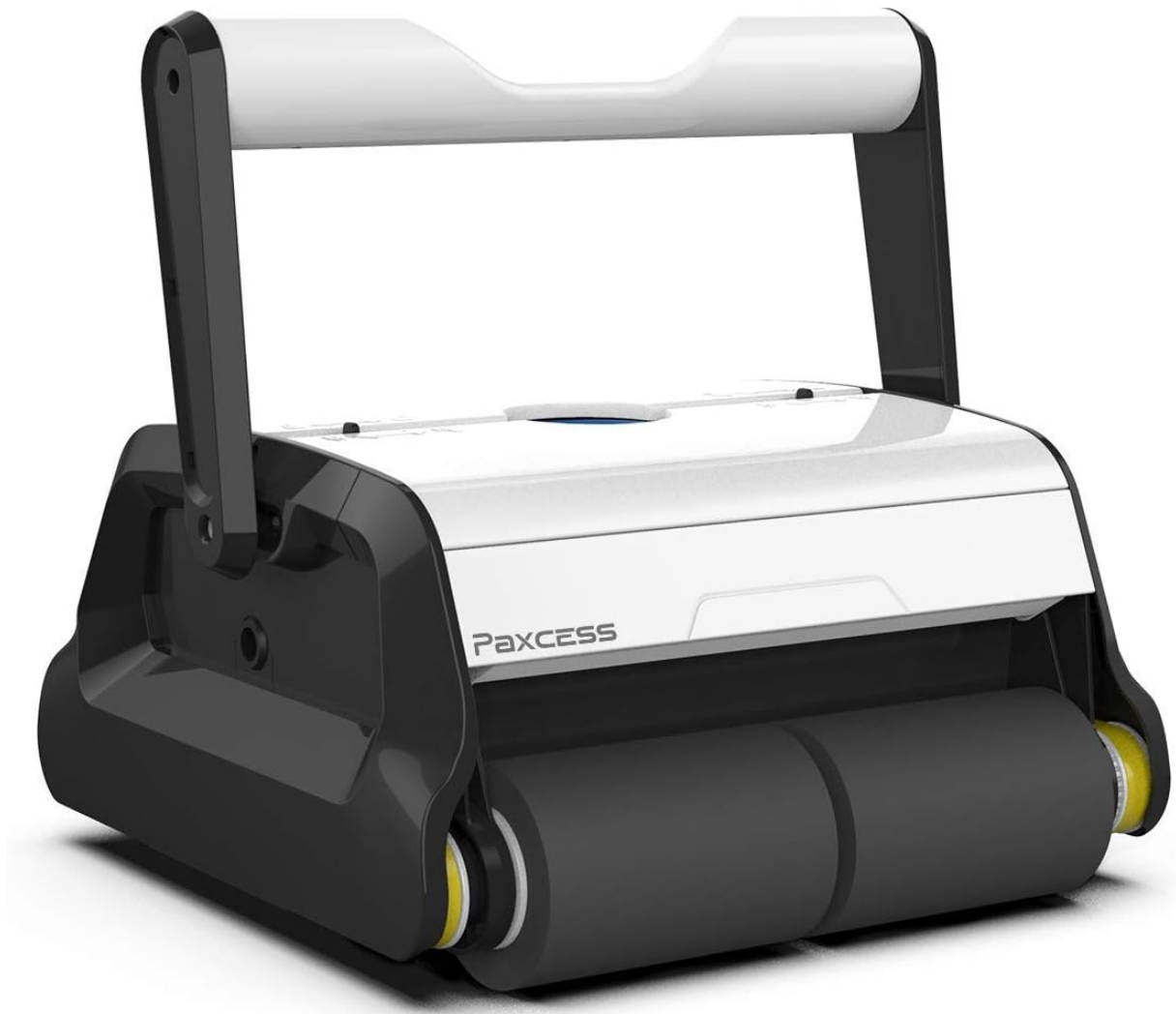
Image: The PAXCESS Robotic Pool Cleaner ready for operation.

Video: Demonstrates the initial setup, including placing the cleaner in the pool and powering it on.