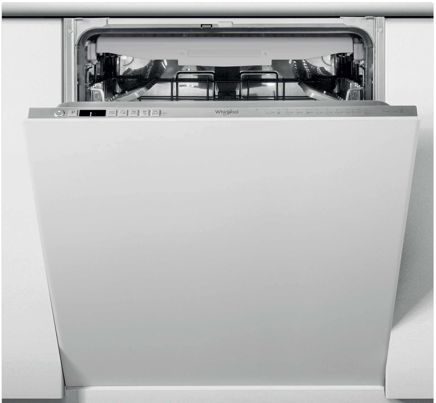
Figure 1: Front view of the Whirlpool WIS7030PEF fully integrated dishwasher. The control panel is visible at the top edge of the door, with the interior racks partially shown.