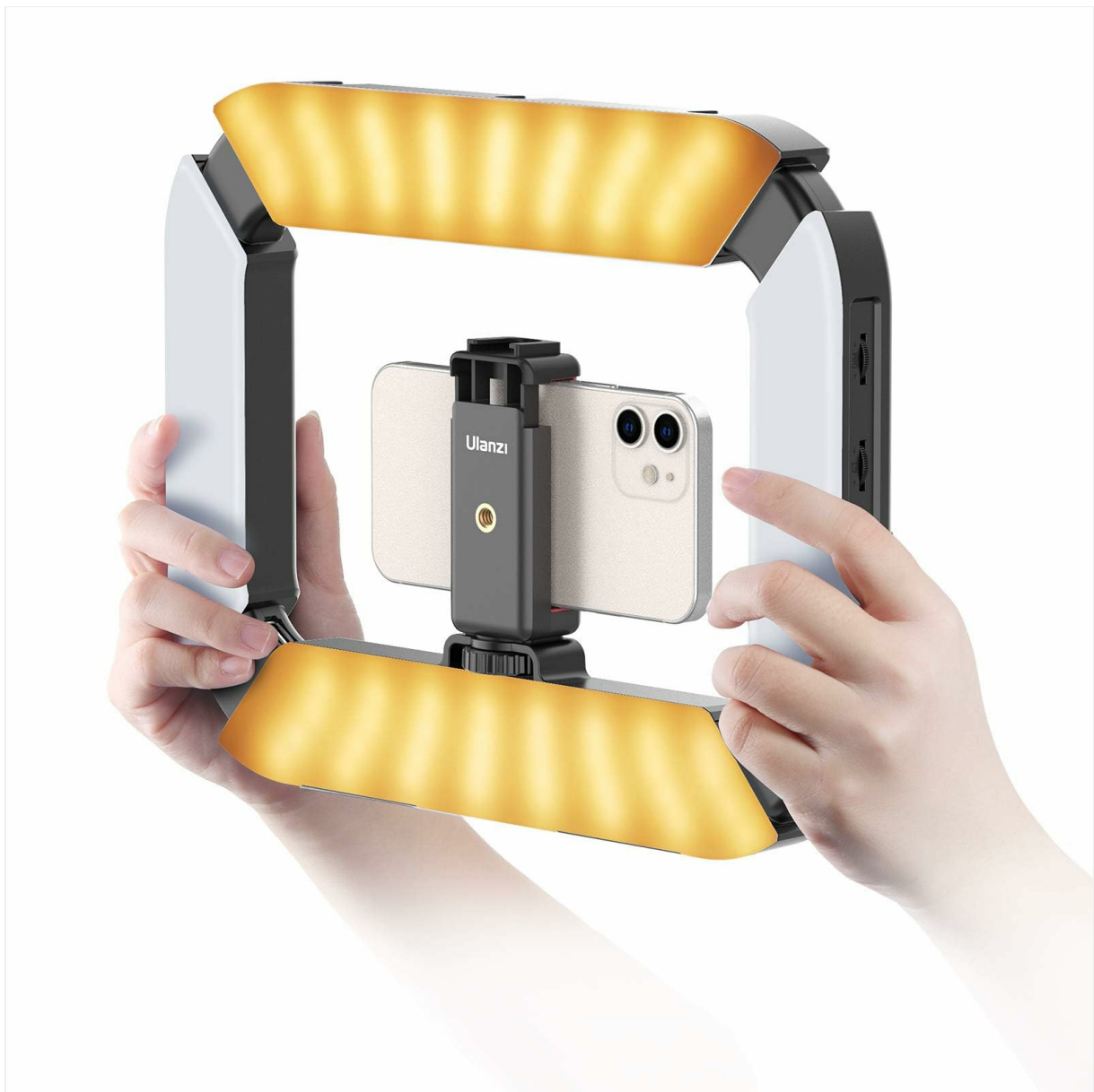
Figure 2.1: ULANZI U200 Light Smartphone Video Rig.