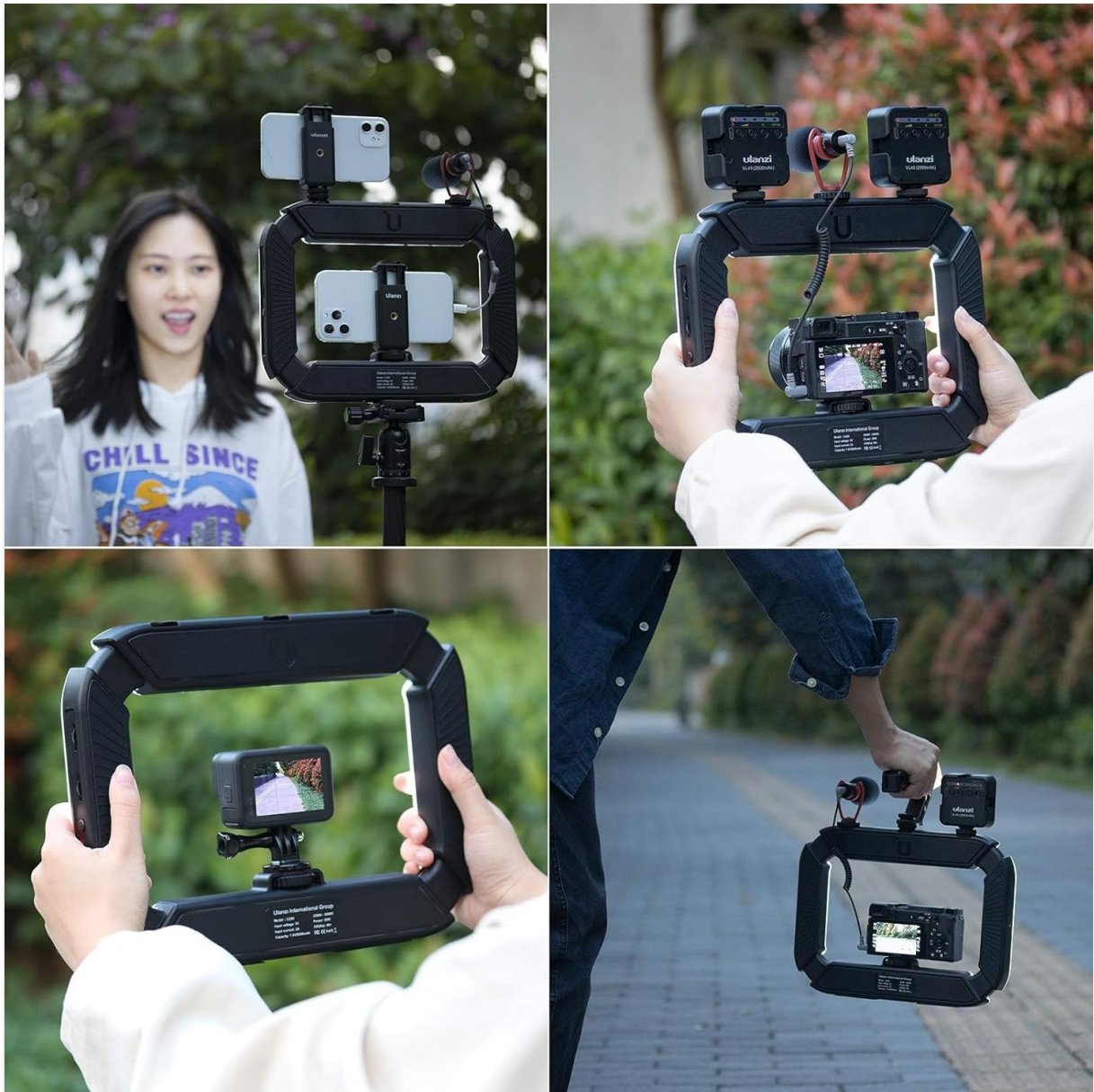
Figure 3.1: The ULANZI U200 Light with a smartphone mounted, showcasing the bottom support design and horizontal/vertical shooting capabilities.