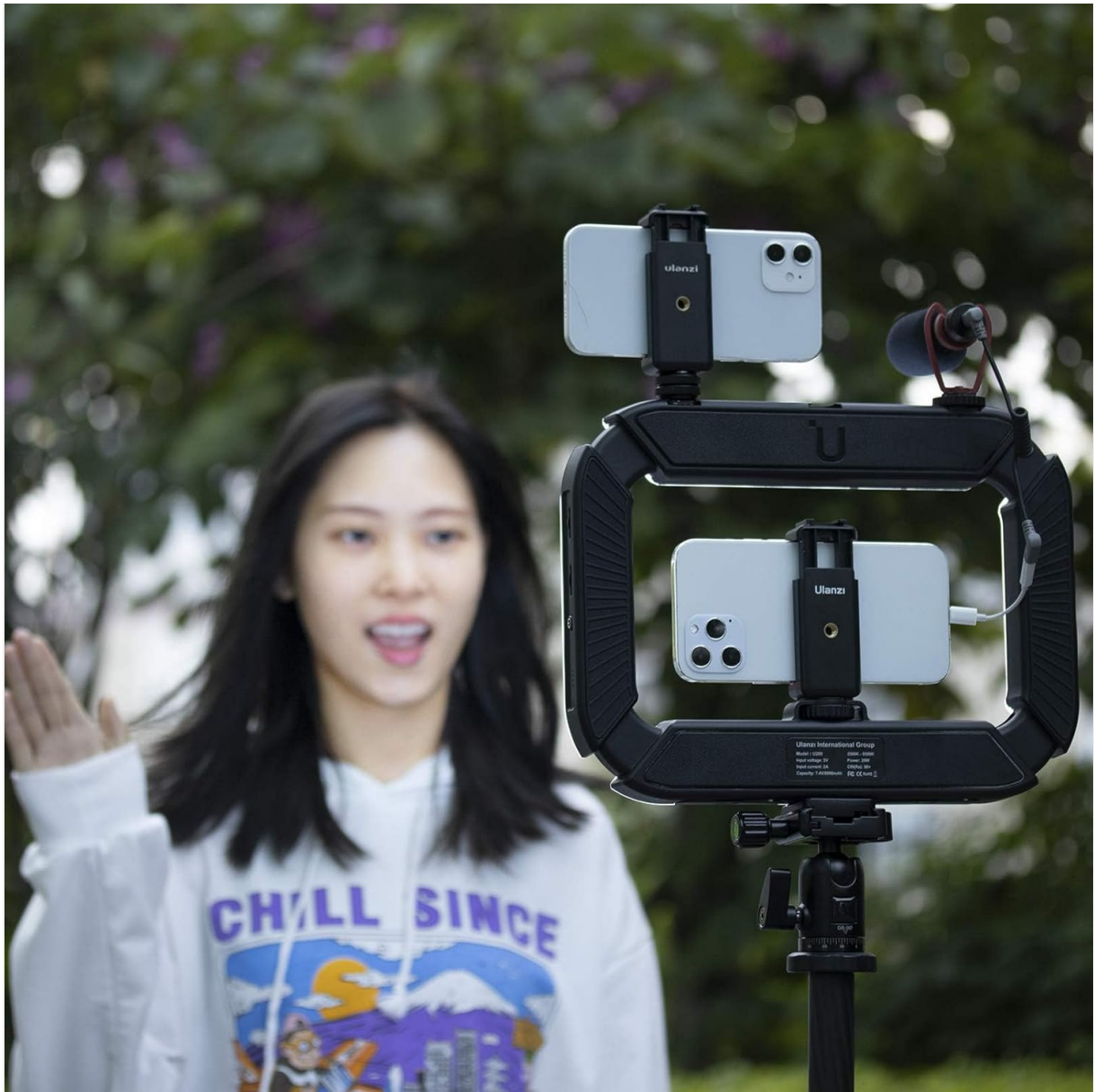
Figure 5.1: Examples of the ULANZI U200 Light being used for different types of content creation, including vlogging, product photography, and live streaming.