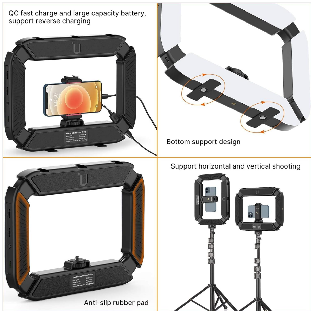
Figure 4.2: The power button allows switching between four adjustable light-emitting surfaces.