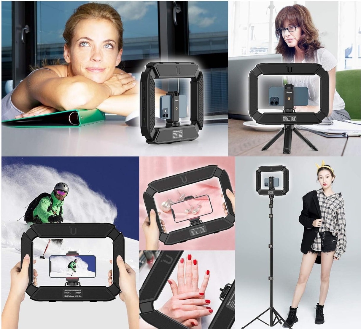
Figure 4.1: Adjustable color temperature from 2500K to 8500K and dimming range from 20% to 100%.