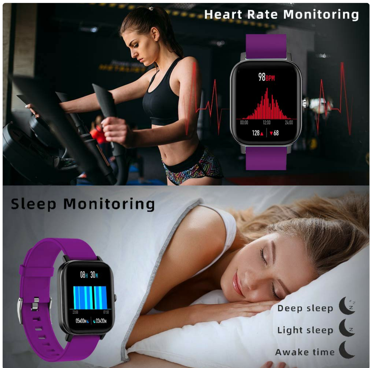
Image: Heart rate monitoring screen showing BPM and a graph, alongside sleep monitoring data.