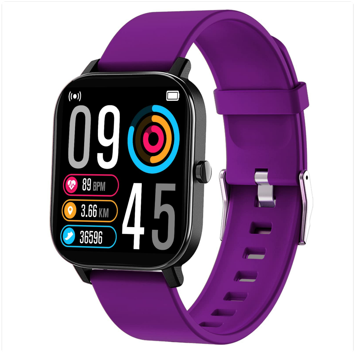
Image: Daily activity tracking interface showing steps, distance, calories burned, and active minutes.