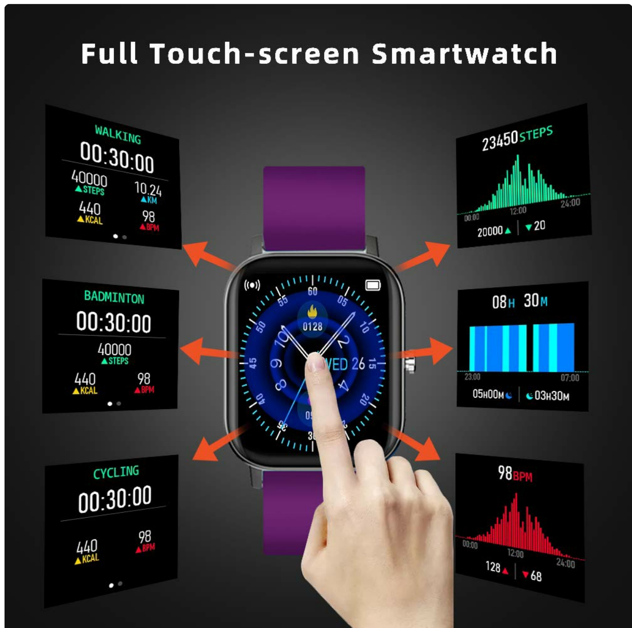
Image: The full touch-screen interface displaying different activity tracking modes and watch faces.

The watch features a 1.4-inch full touch screen for intuitive control.