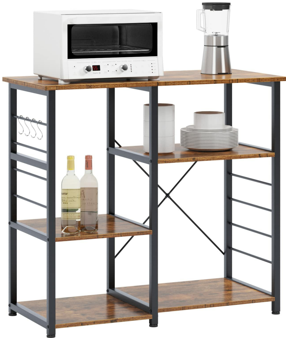
Image 1.1: Assembled soges Baker's Rack. Ensure proper assembly for safety and stability.