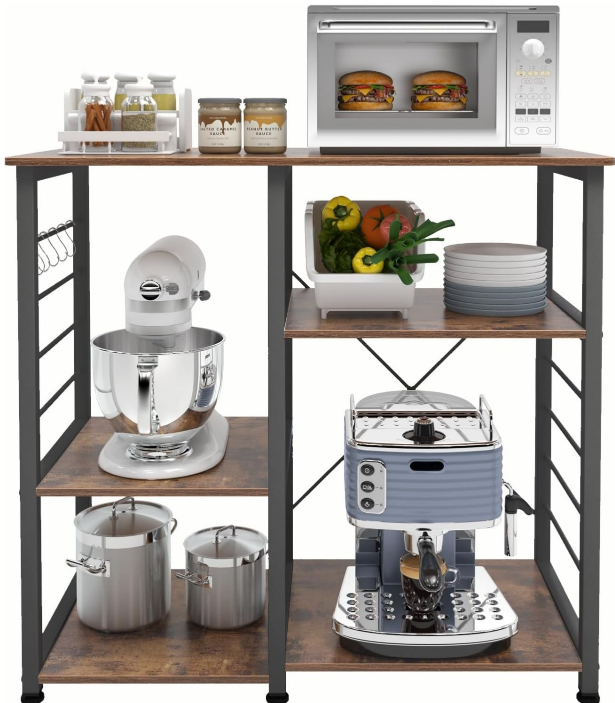
Image 3.1: Key features for assembly and stability: adjustable foot pads, X-frame support, and S-hooks for utensils.