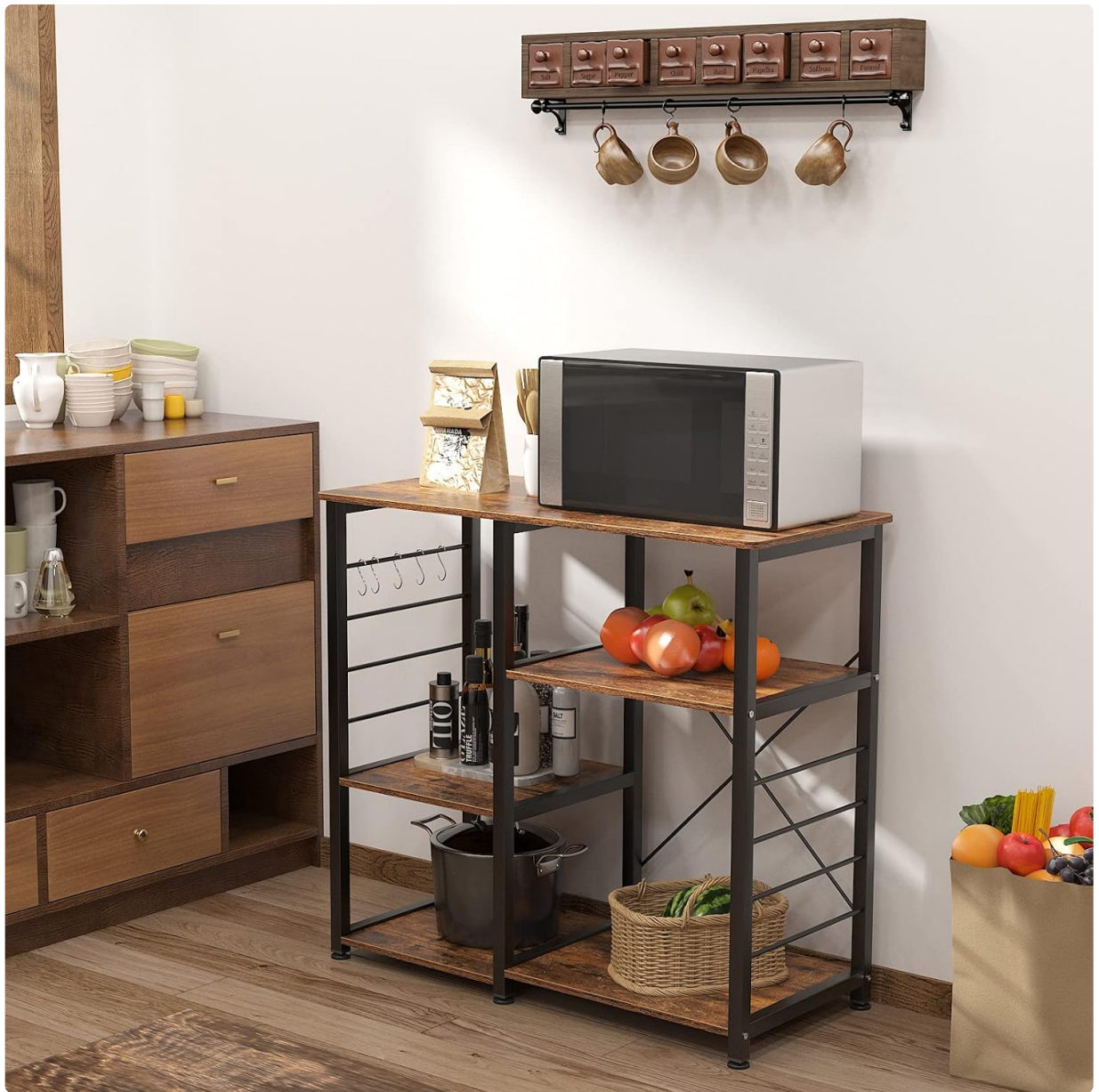
Image 4.1: Example of the rack in use, holding a microwave, bottles, and other kitchen essentials.