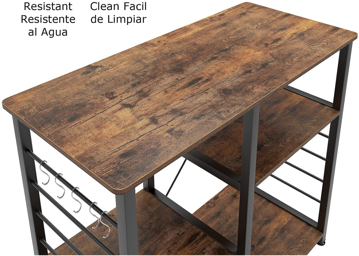
Image 4.2: The rack configured as a versatile coffee station, demonstrating its multi-functional storage capabilities.

Your browser does not support the video tag.