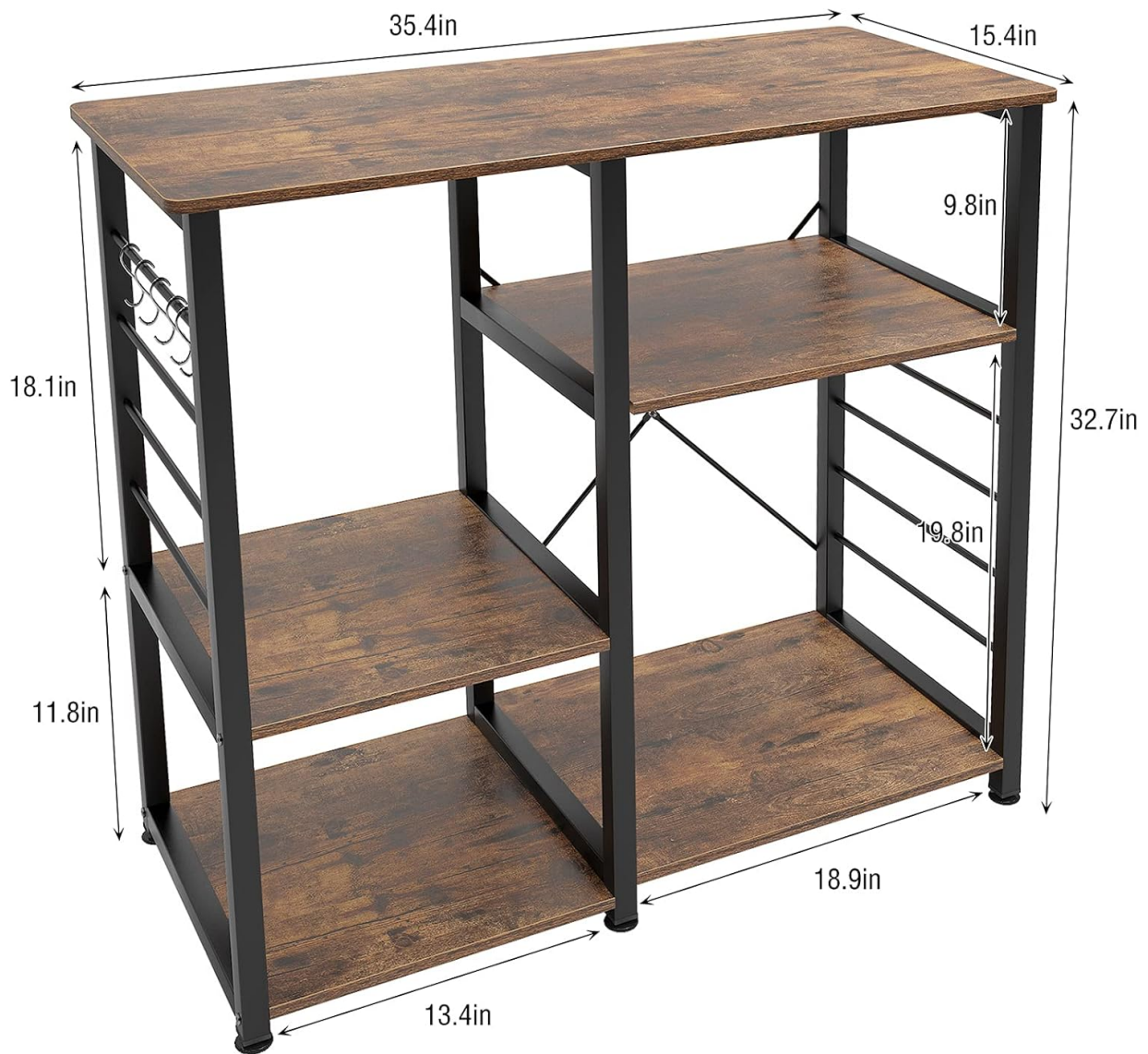
Image 3.2: Product dimensions for planning placement. L x W x H = 35.43 x 15.75 x 32.68 inches.