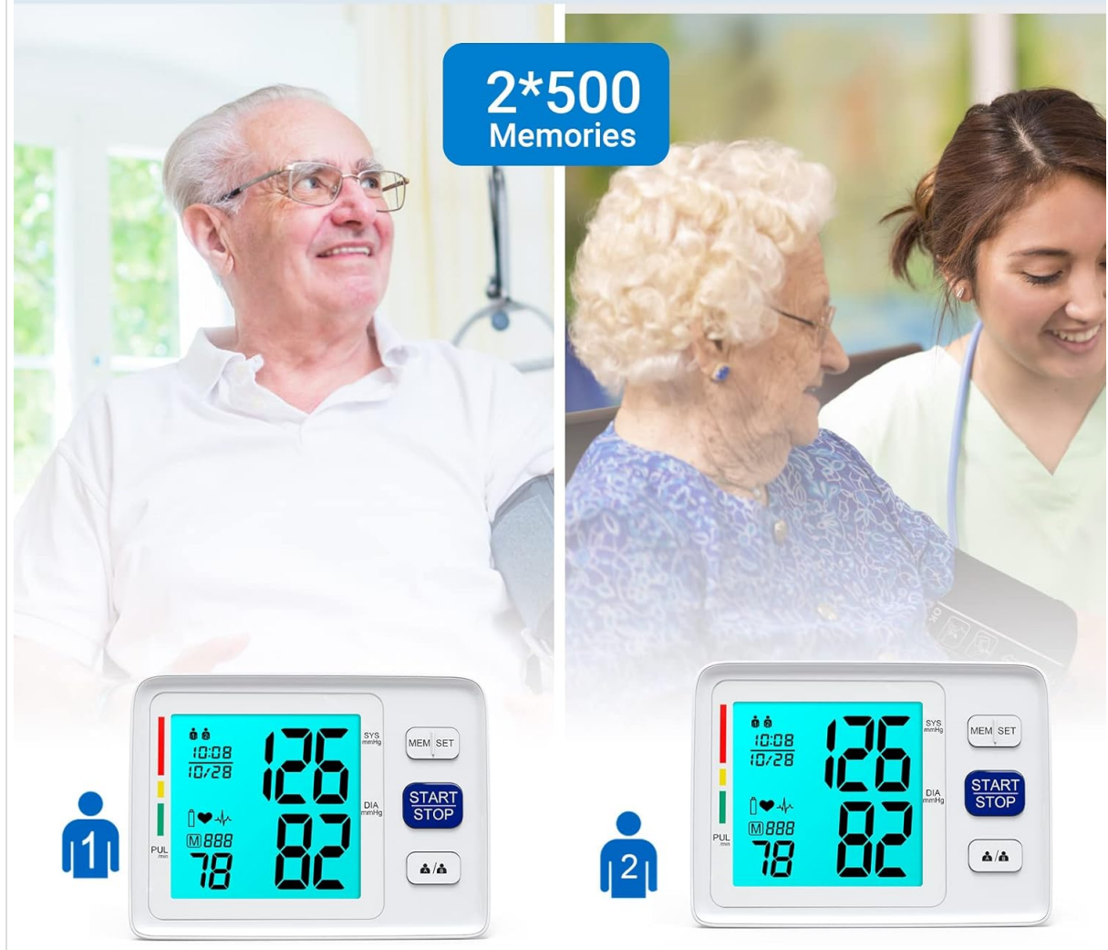
Image Description: A split image demonstrating the dual user mode of the AlphaMed U80A monitor. Two individuals, an elderly man and a young woman, are shown with their respective blood pressure readings displayed on separate monitor interfaces, highlighting the 2x500 memory capacity for two users.