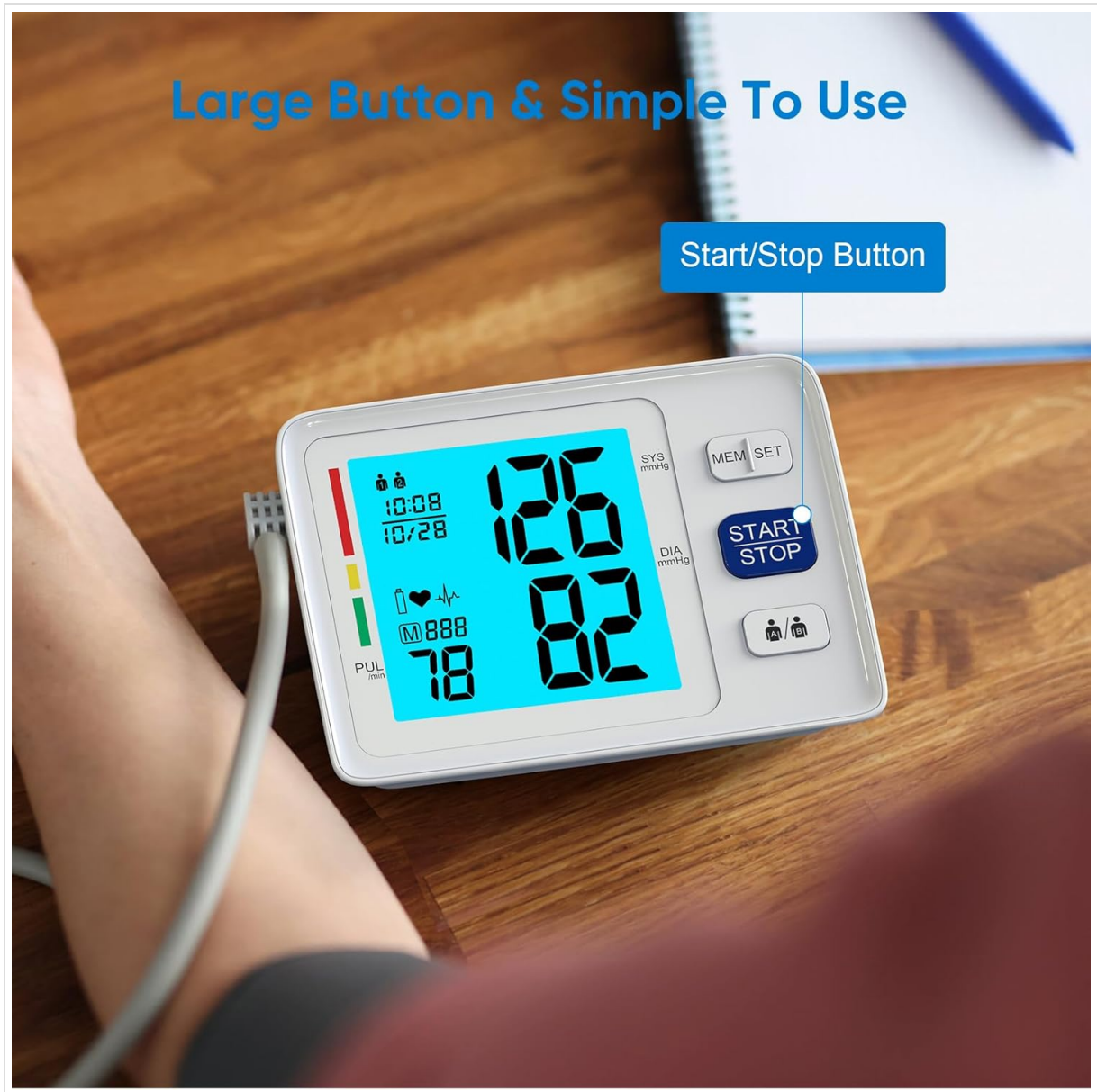
Image Description: A close-up of the AlphaMed U80A Blood Pressure Monitor in use, with the cuff on a person's arm. The large 'START/STOP' button is prominent, and the backlit display shows clear, oversized numbers for blood pressure and pulse readings, highlighting its simple operation.