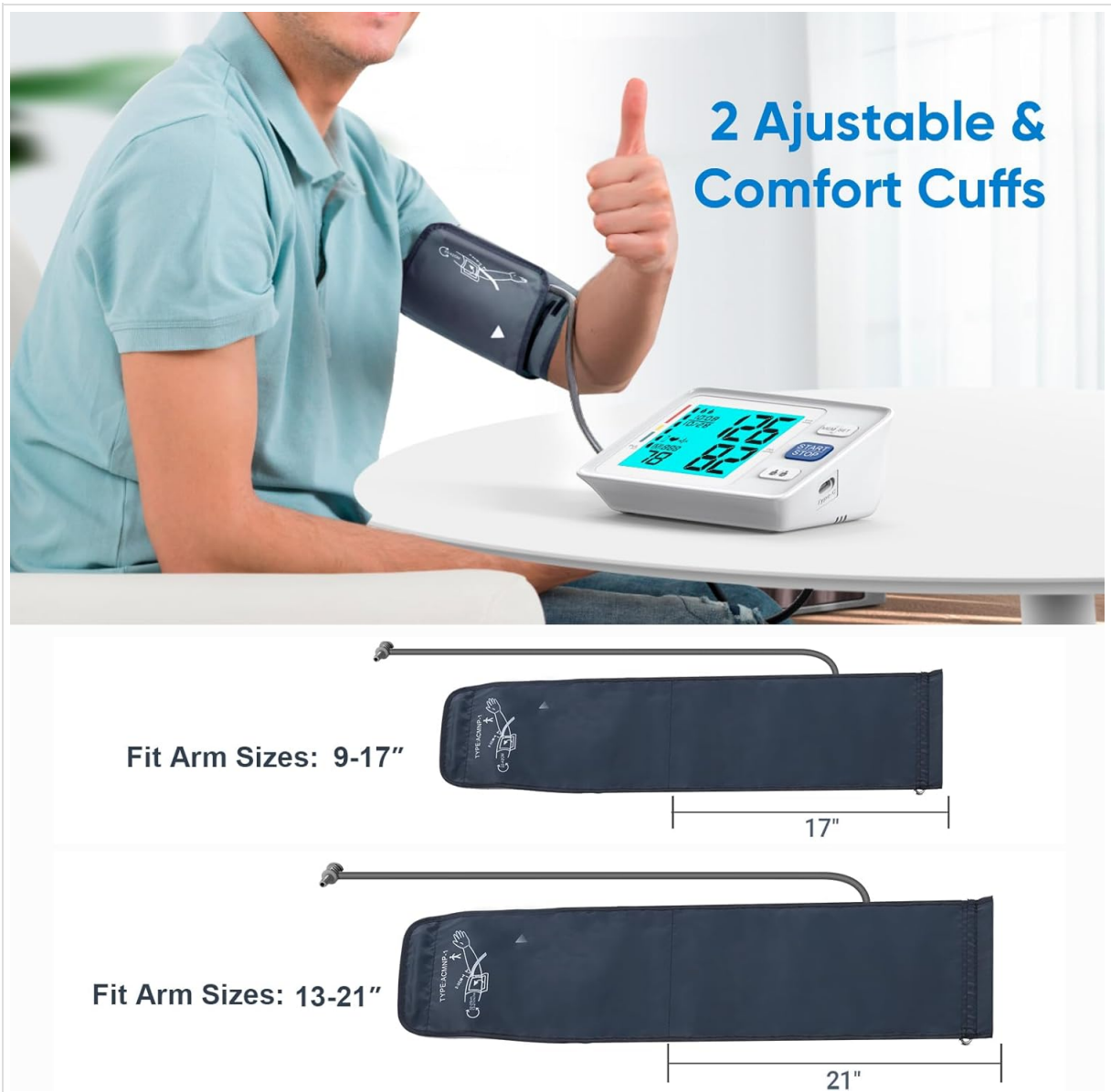
Image Description: A person is shown with the AlphaMed U80A blood pressure cuff correctly placed on their upper arm, giving a thumbs-up. The monitor displays clear readings. Below, two cuffs are illustrated with their respective arm size ranges: 9-17 inches and 13-21 inches, emphasizing the adjustable and comfortable fit.