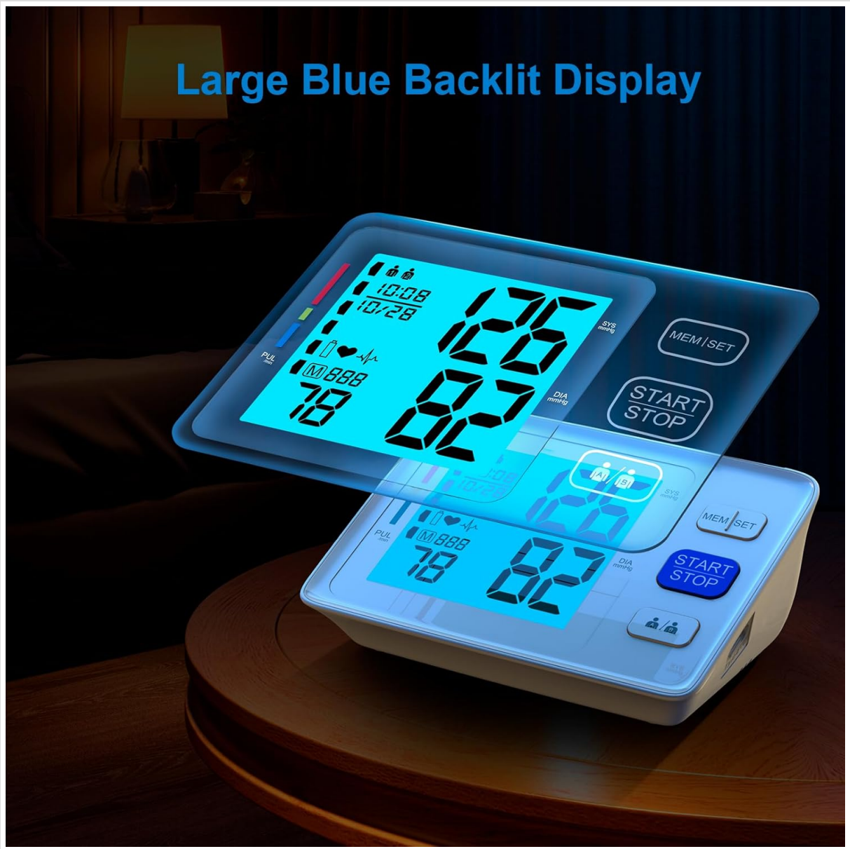
Image Description: The AlphaMed U80A monitor showcasing its large, bright blue backlit LCD display. The screen clearly shows large numerical readings for systolic and diastolic blood pressure, pulse rate, and includes indicators for date, time, and user profile.