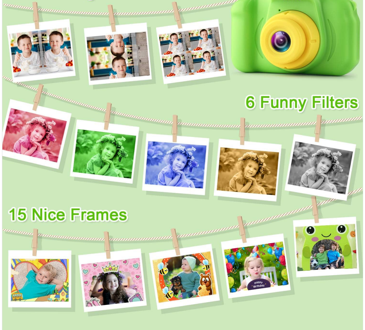
Image: A collage showing various creative options for the GKTZ Kids Camera, including distorting mirror effects, color filters, and decorative frames applied to photos of children.