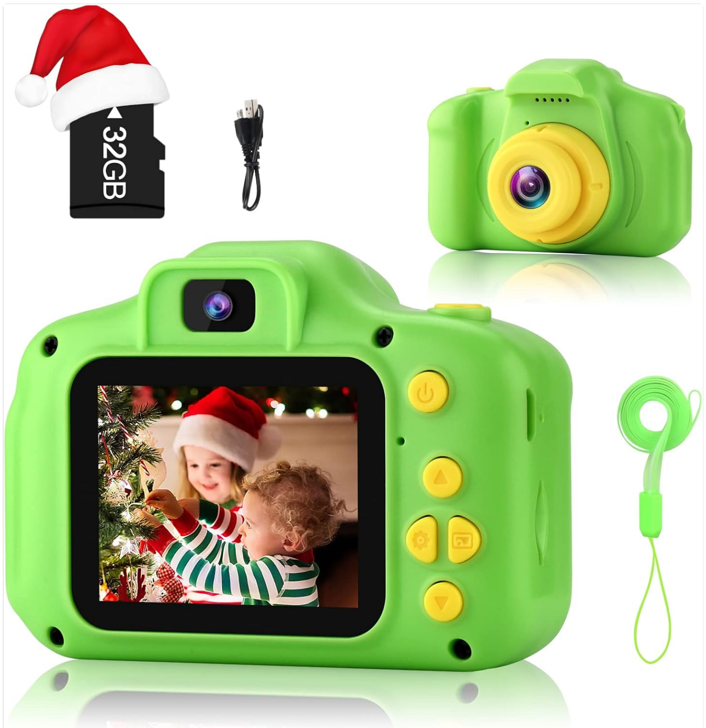
Image: Front and back views of the green GKTZ Kids Camera. The back shows the screen and control buttons (power, up, down, menu, shutter), while the front shows the lens.