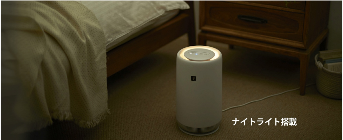
Sharp FU-NC01-W air purifier placed in a bedroom.