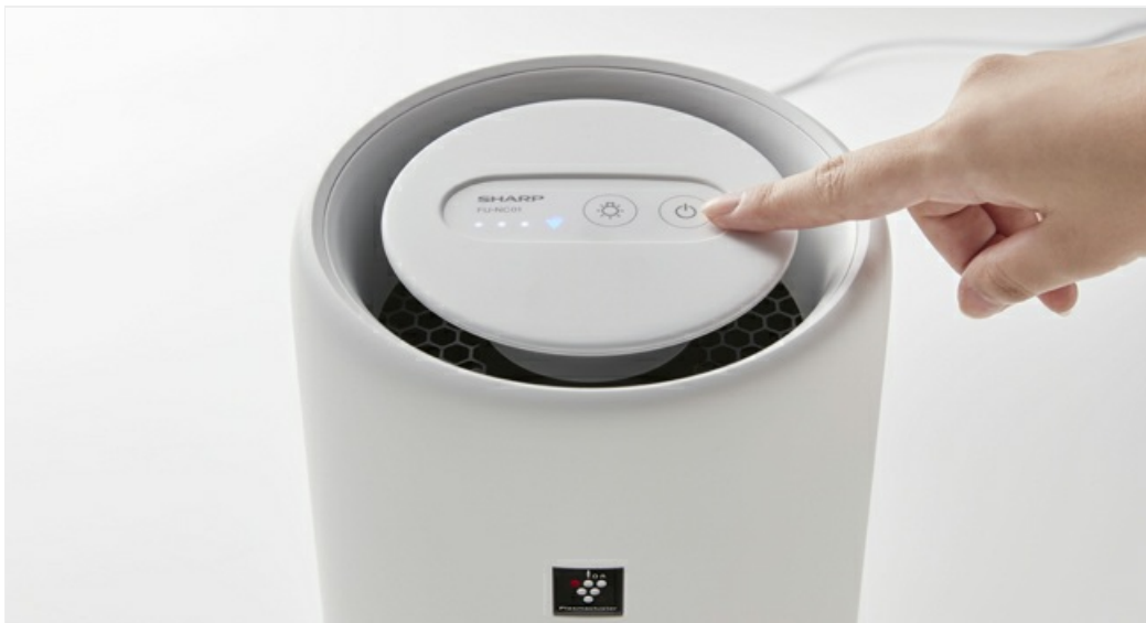
Image: Close-up of the Sharp FU-NC01-W air purifier's simple control panel with power, mode, and night light buttons.

The control panel is located on the top of the unit. It includes power, mode selection, and night light buttons.