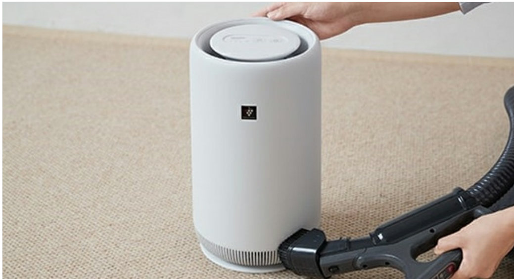
Image: A person cleaning the Sharp FU-NC01-W air purifier with a vacuum cleaner, demonstrating how to remove dust from the pre-filter and air intake.