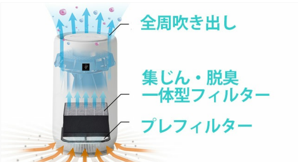
Visual representation of the air purification process within the Sharp FU-NC01-W.