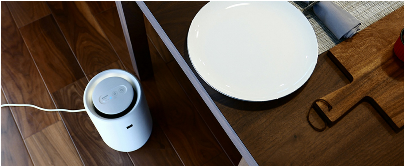
Sharp FU-NC01-W air purifier in a kitchen setting.