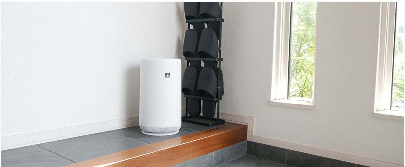
Sharp FU-NC01-W air purifier positioned near an entrance.