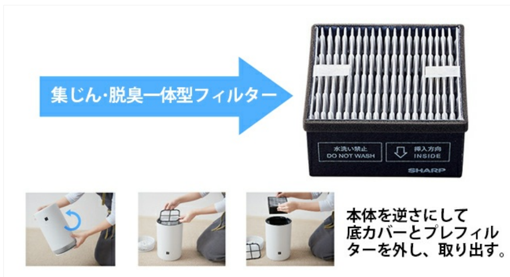
Image: Close-up view of the integrated dust collection and deodorization filter, highlighting its design for effective air purification.