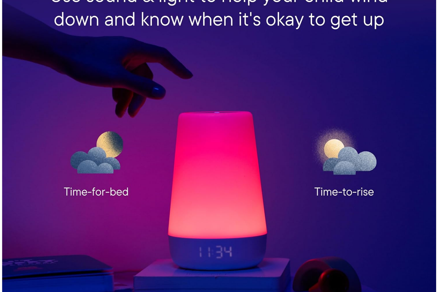
Figure 4: Visual cues from the night light, such as color changes, help children understand when it's time to sleep and when it's time to wake up.

Use sound & light to help your child wind down and know when it's okay to get up