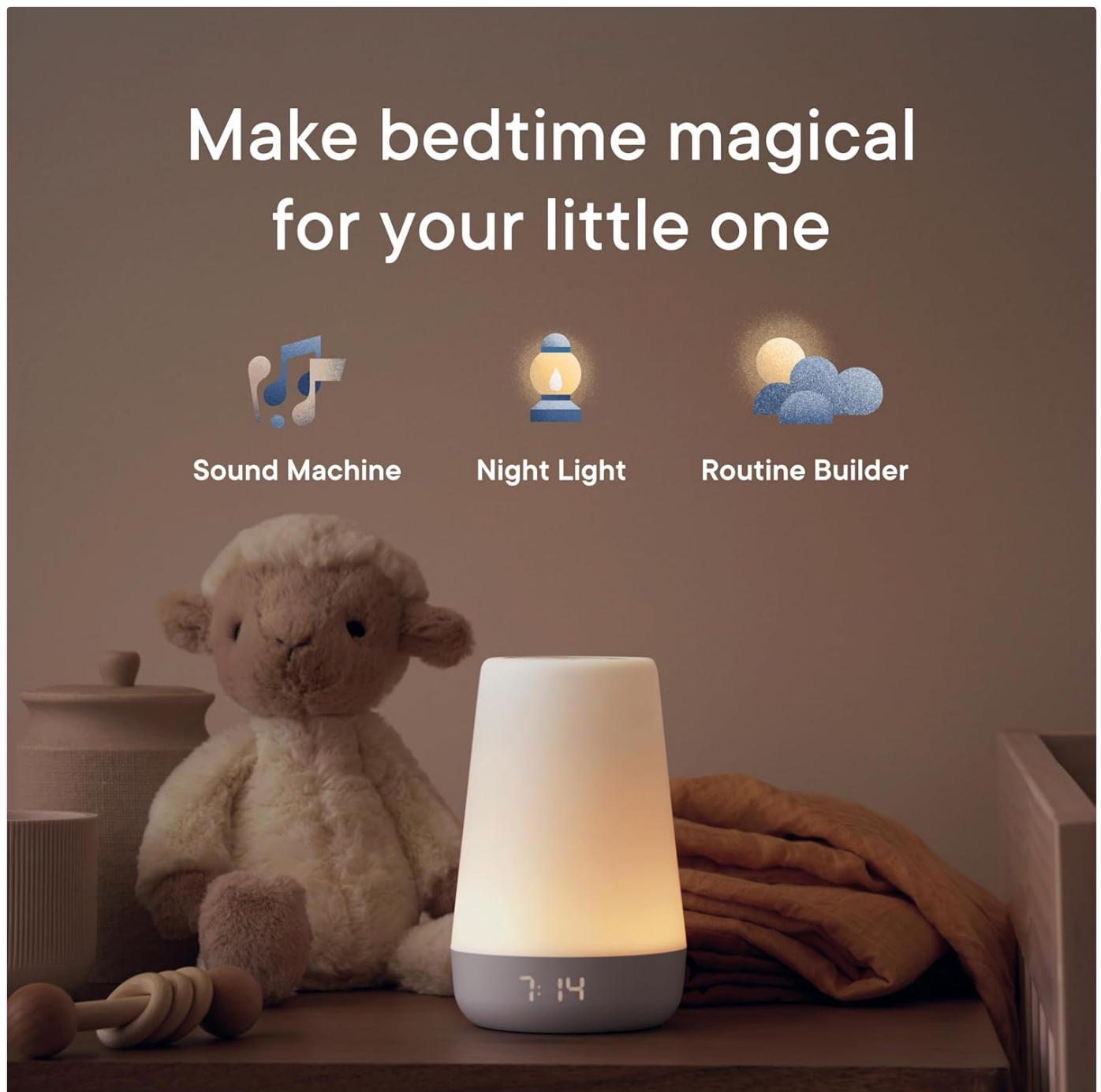
Figure 3: The Hatch Rest integrates a sound machine, night light, and routine builder to simplify bedtime routines.