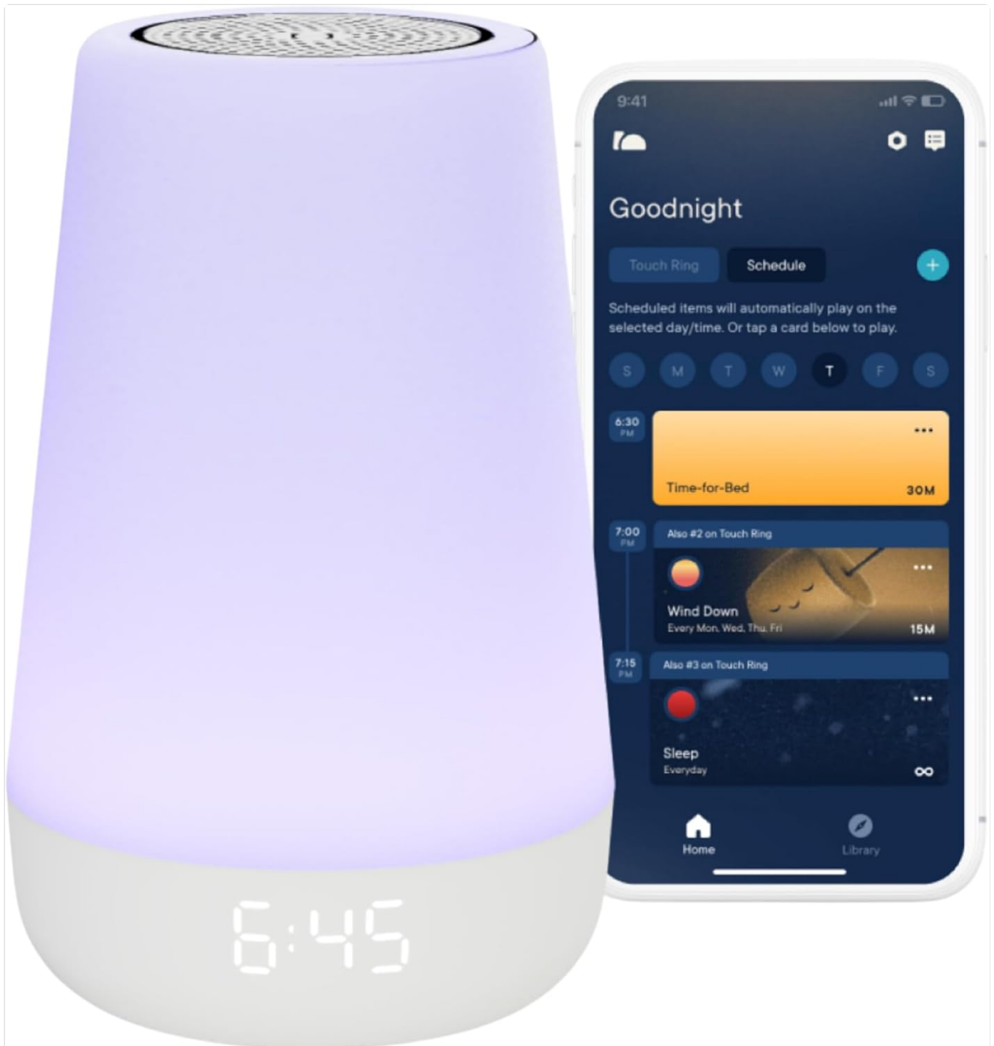
Figure 1: The Hatch Rest 2nd Gen device and its accompanying mobile application for easy control and customization.