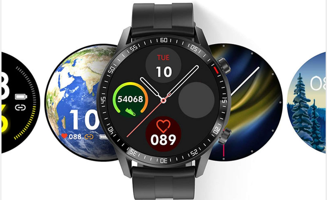
Image 6.3: The smartwatch showcases multiple customizable watch faces, emphasizing the variety available through the app to match personal style.

Download the dial that comes with the watch and the rich dial market in the APP. There are many changes in the wrist, and the world is loaded into your wrist.