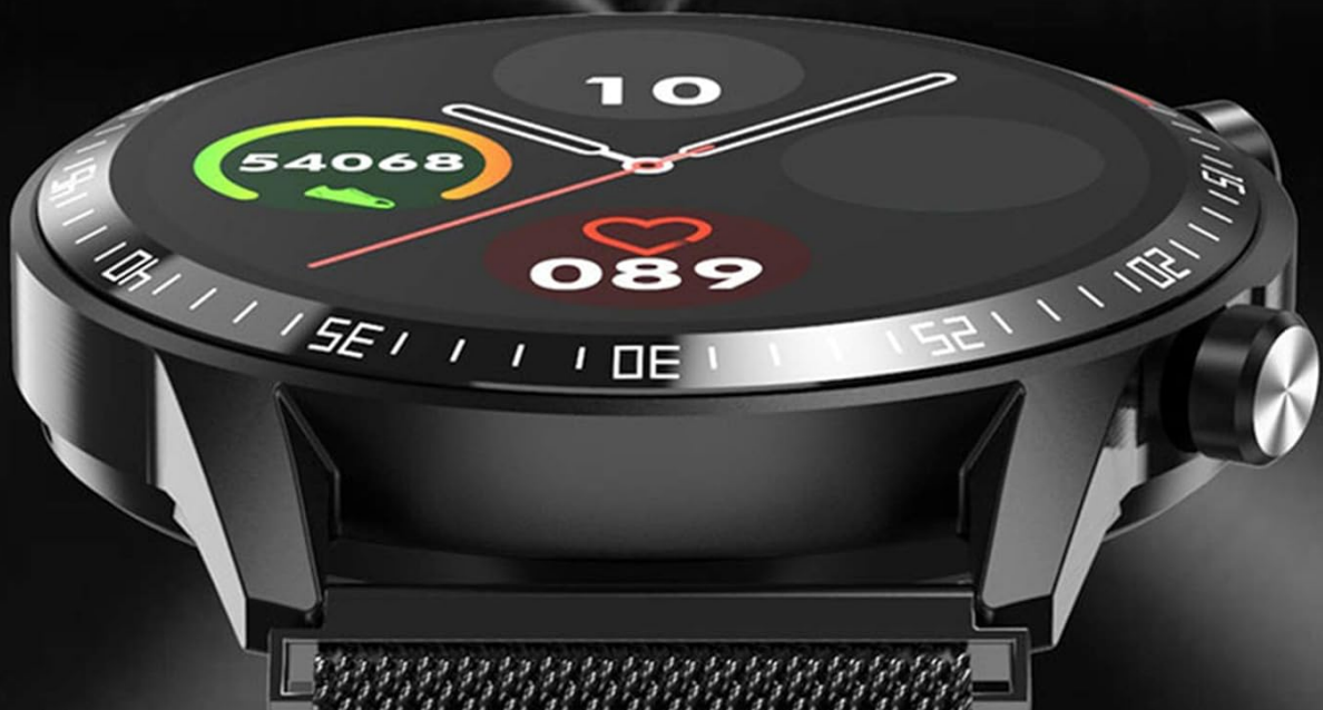
Image 4.1: The smartwatch features a large, tempered glass screen with 240x240 pixel resolution, offering clear picture quality and rich colors. It highlights 1.3-inch display, CNC highlight bevel, and G+F Touch.