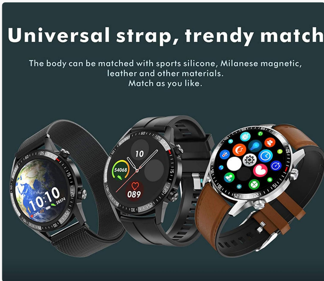
Image 7.1: The image displays the Q88 Smartwatch with three different strap options: a black Milanese magnetic strap, a black silicone strap, and a brown leather strap, highlighting its universal strap compatibility.

The Q88 Smartwatch supports various strap materials, including silicone, Milanese magnetic, and leather. Clean straps according to their material type.