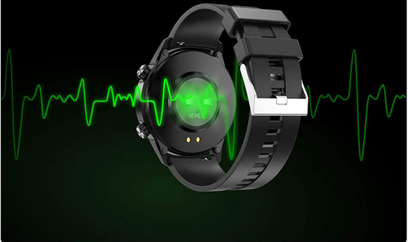
Image 6.2: The rear view of the Q88 Smartwatch highlights the HX3880 heart rate sensor, which provides 24-hour smart heart rate detection for continuous monitoring.

Hx3880 Heart rate monitoring technology 24/7 accurate heart rate monitoring Give you intimate care every moment