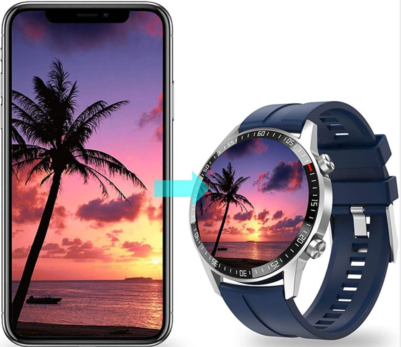
Image 6.4: This image demonstrates the DIY Wallpaper dial feature, where users can upload any preferred image from their phone to be used as the smartwatch's background.

Upload any wallpaper you like to the watch through the APP as the dial wallpaper.