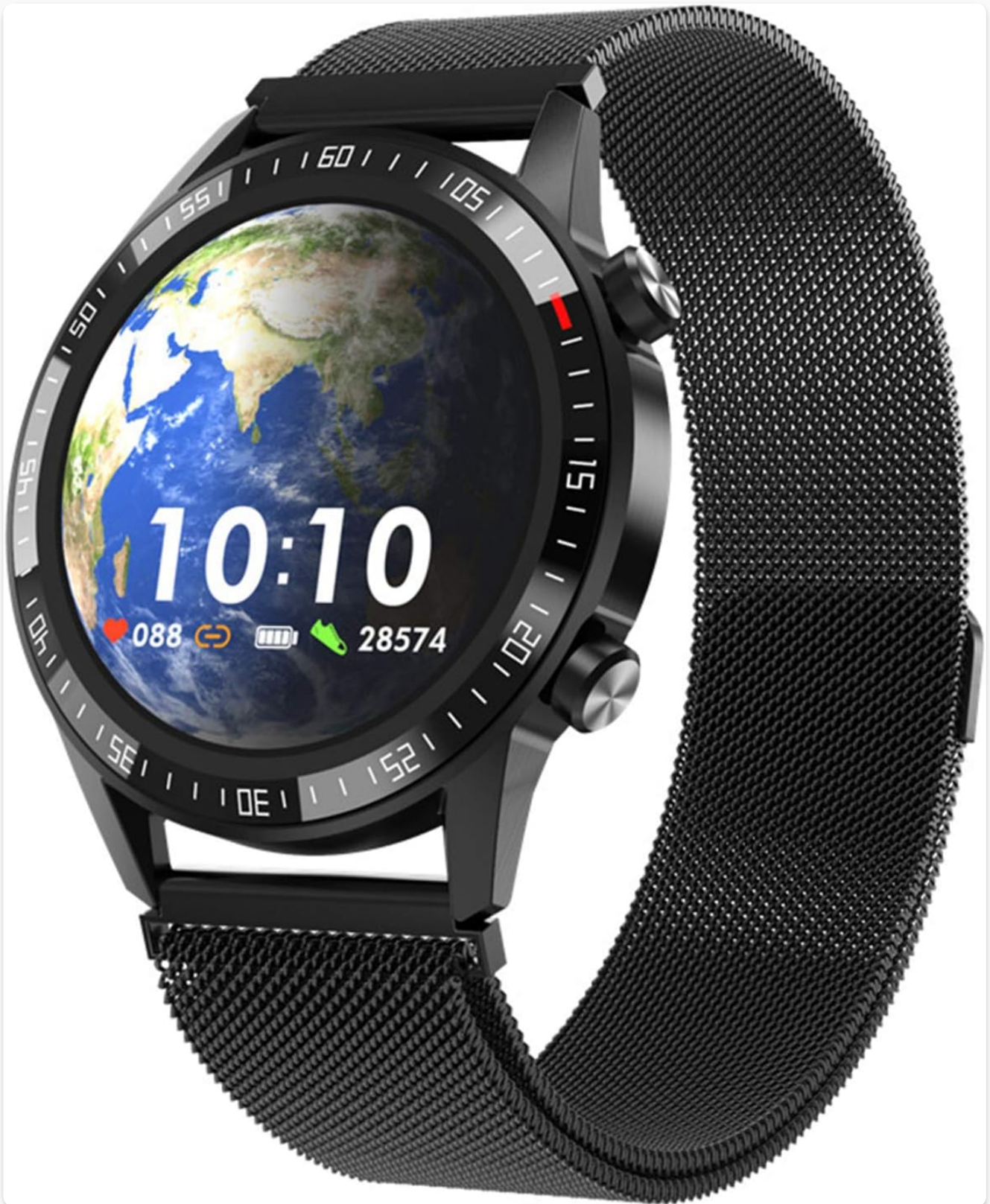
Image 1.1: HFGH Q88 Smartwatch with a black mesh strap. The watch face shows a world map background with the time 10:10, battery status, and step count.