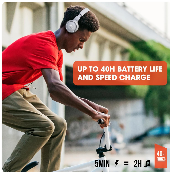
Image: Visual representation of the JBL Tune 510BT's impressive battery life and quick charge feature, highlighting 40 hours of playtime and 5 minutes of charging providing 2 hours of audio.

Quick Charge: A 5-minute charge provides up to 2 hours of playtime.