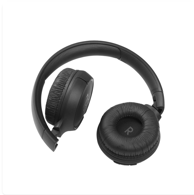
Image: The JBL Tune 510BT headphones folded flat, demonstrating their compact design for convenient storage and travel.