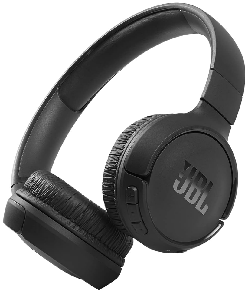
Image: The JBL Tune 510BT headphones in black, showcasing their sleek, on-ear design.