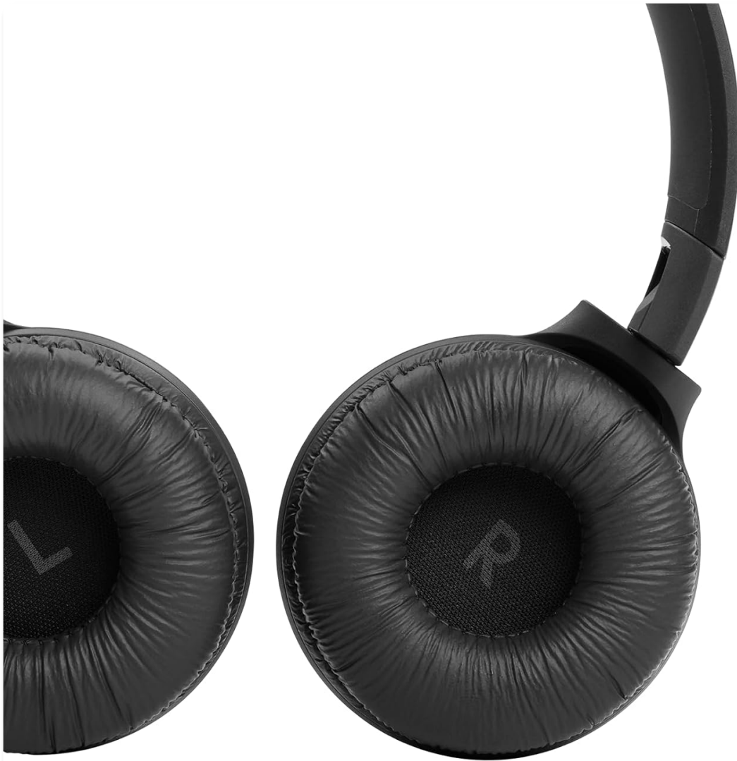
Image: A close-up view of the left and right earcups, indicating proper wearing orientation.