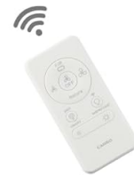
Image: The SMAAIR 52 Inch Smart Ceiling Fan with its remote control, highlighting the convenience of remote operation.