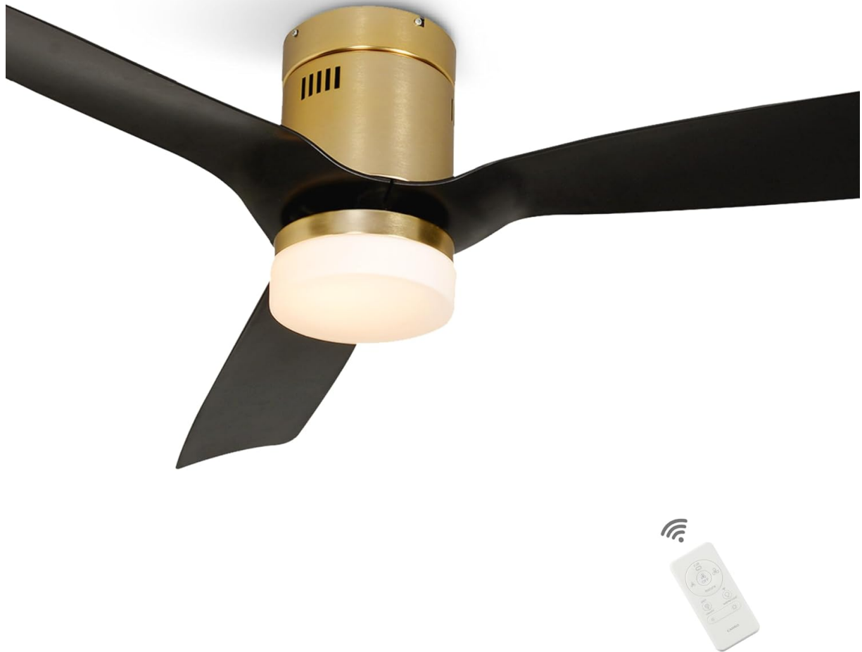
Image: The SMAAIR 52 Inch Smart Ceiling Fan in black and gold, featuring three blades and an integrated LED light, with its remote control shown in the foreground.