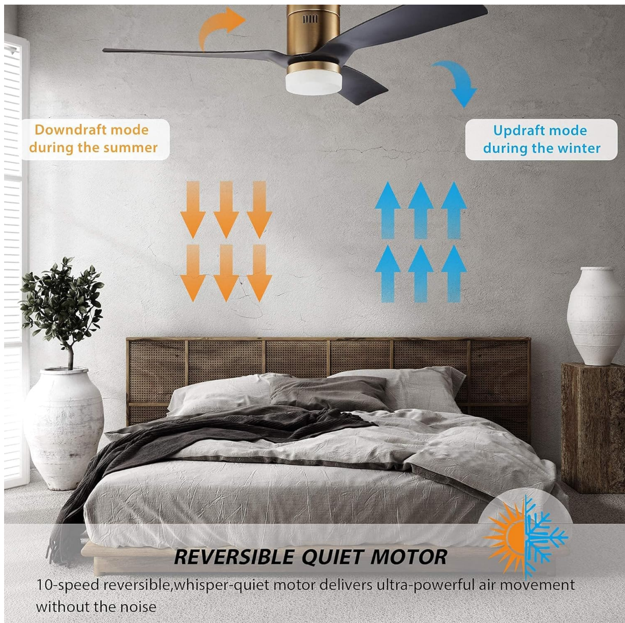
Image: A visual representation of the SMAAIR ceiling fan's reversible motor function, showing downdraft mode for summer and updraft mode for winter to optimize air circulation.