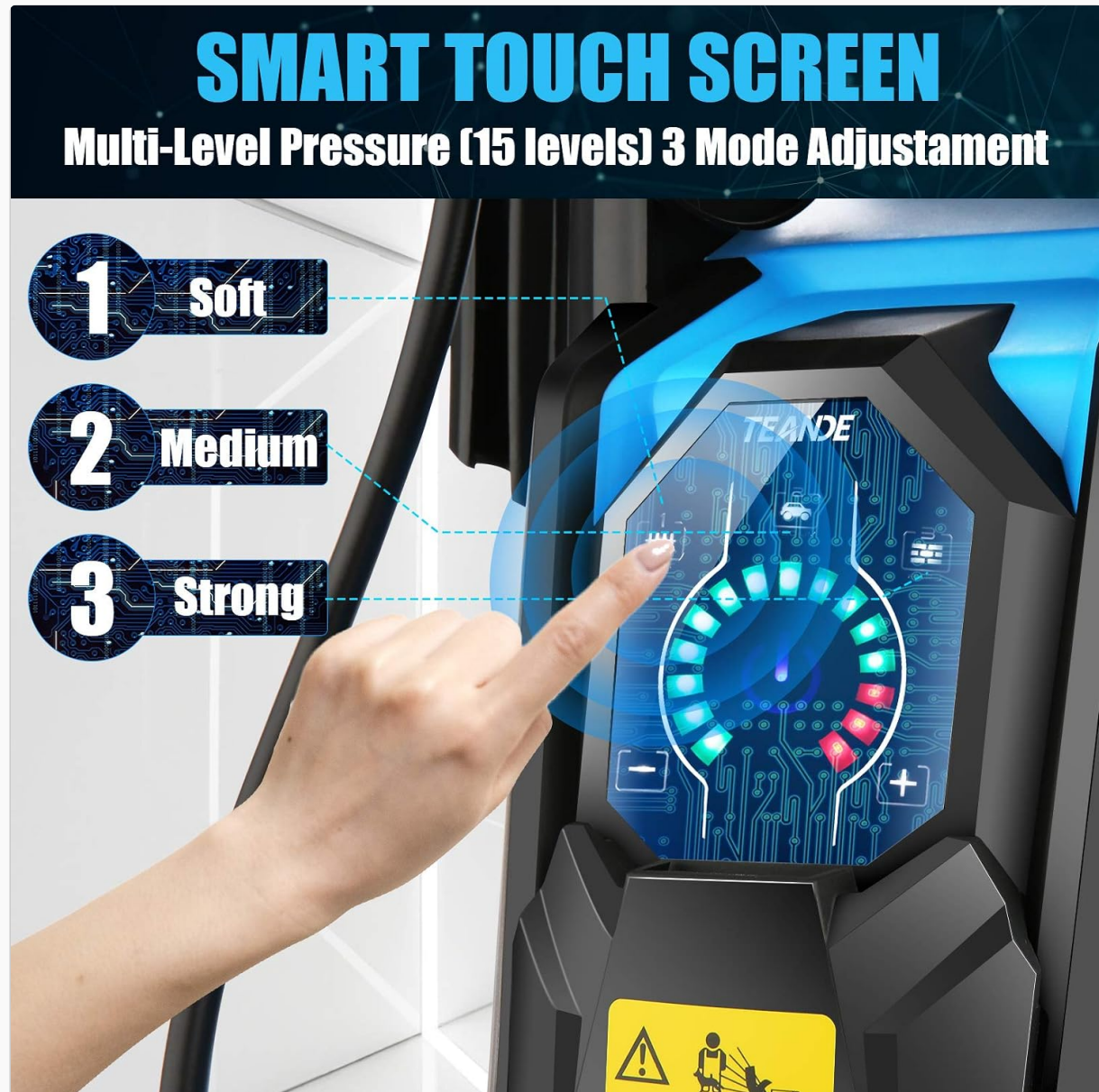
Image 6.1: The smart touch screen interface showing the three main pressure modes: Soft, Medium, and Strong, with 15 adjustable levels.

Your TEANDE pressure washer features an intelligent touch screen for precise pressure control. You can adjust the water pressure across 15 levels, categorized into 3 main gear levels: Soft, Medium, and Strong.