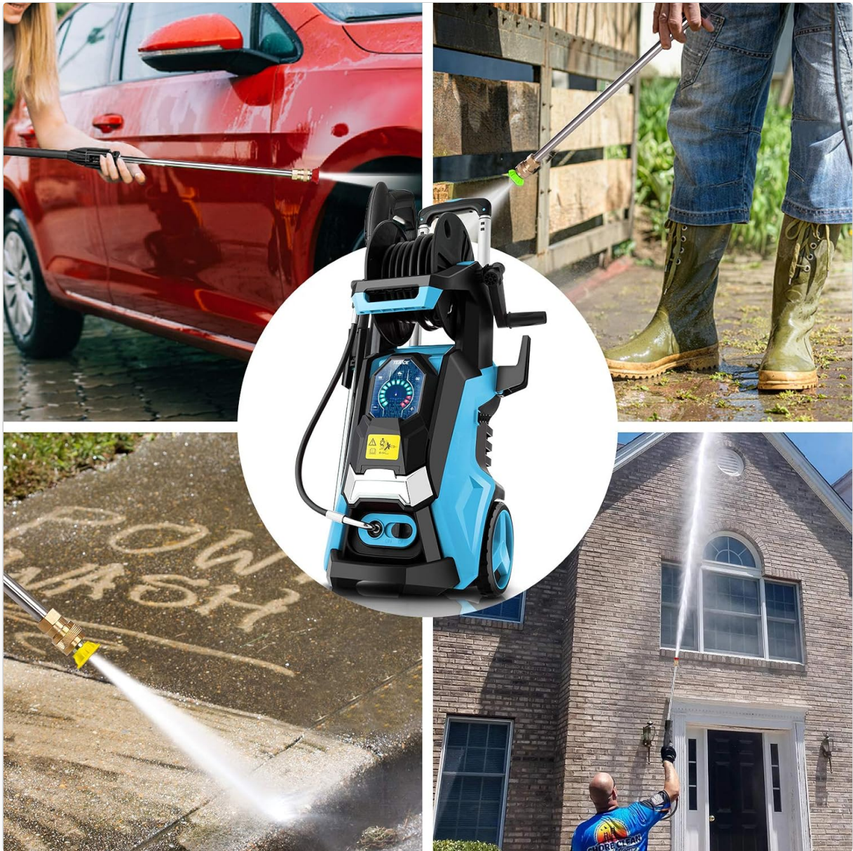
Image 6.3: Visual examples of the pressure washer being used for cleaning a car, fence, driveway, and house siding.

Always test the spray on an inconspicuous area first to avoid damage. Maintain a safe distance from the surface being cleaned, adjusting as needed based on the nozzle and pressure setting.