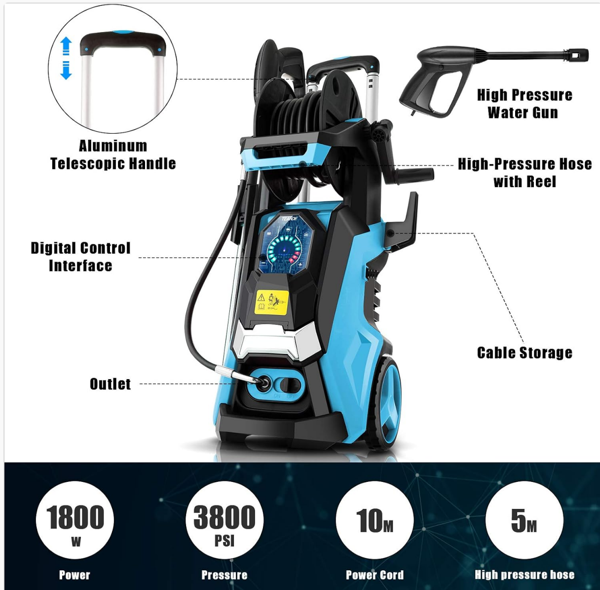
Image 4.1: Main components of the TEANDE Electric Pressure Washer, including the digital control interface, aluminum telescopic handle, high-pressure water gun, high-pressure hose with reel, outlet, and cable storage.

Familiarize yourself with the main components of your pressure washer: