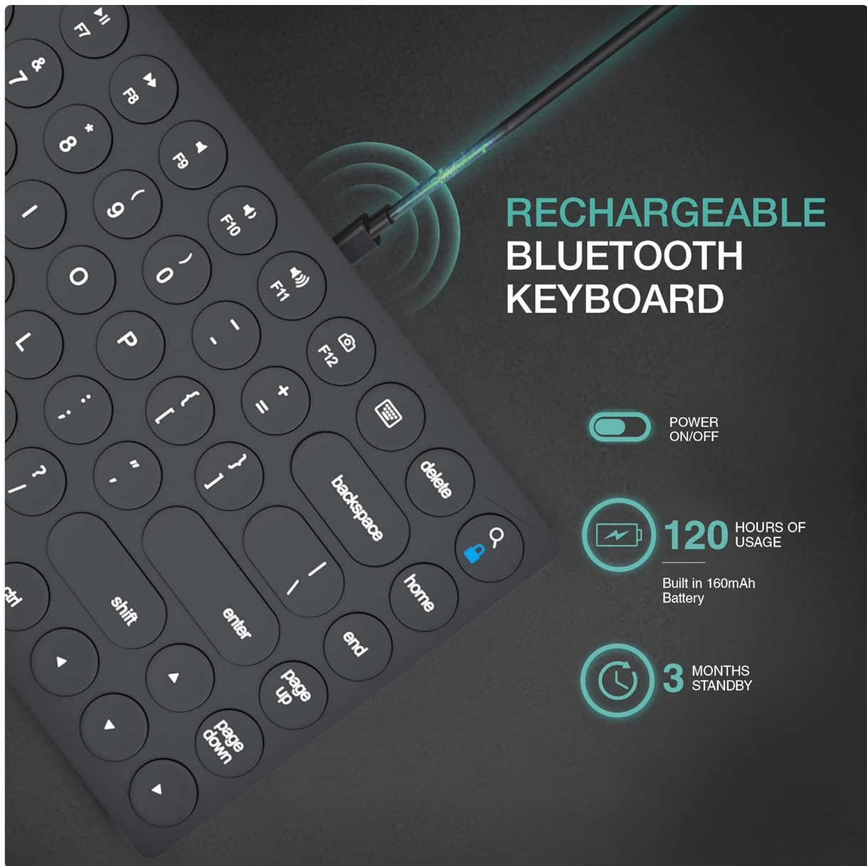
Image 4.1: USB-C charging port and power switch. The keyboard offers up to 120 hours of usage on a single charge.