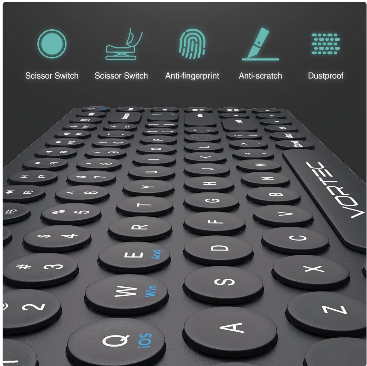
Image 3.3: Key features of the keyboard, including scissor-switch technology, anti-fingerprint, anti-scratch, and dustproof design.