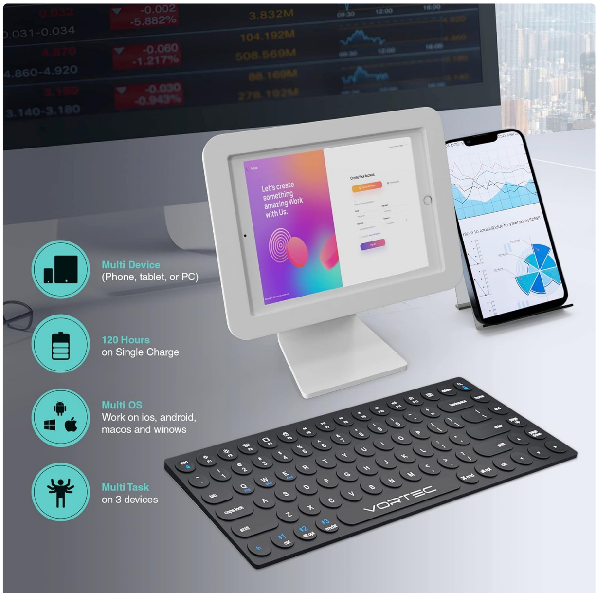
Image 3.2: Keyboard showcasing multi-device and multi-OS features, along with 120 hours of usage on a single charge.