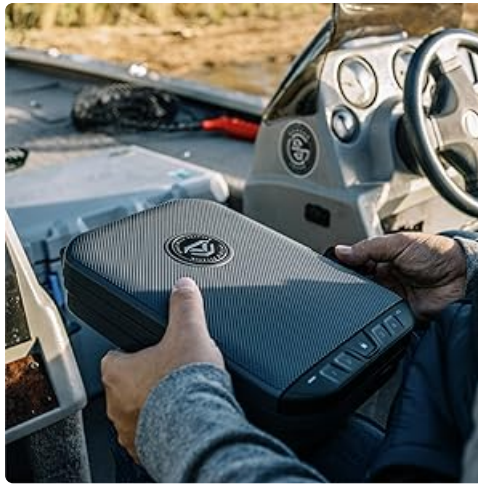
Image: Detail of the built-in lock system on the LifePod 2.0, showing its engagement mechanism.