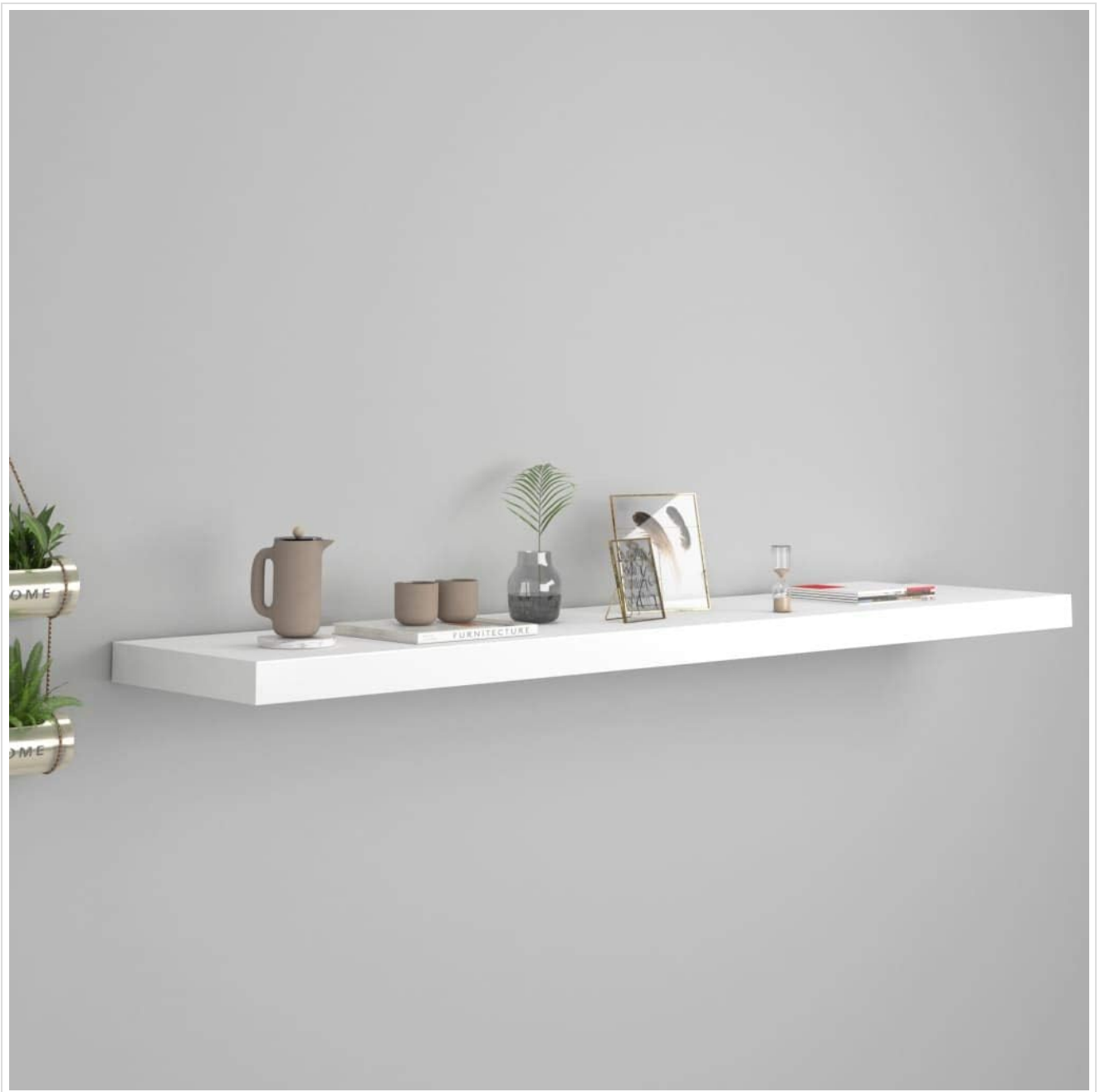
Image: The floating shelf installed on a wall, adorned with decorative items.