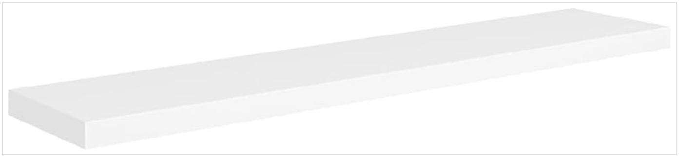
Image: The complete floating shelf, showcasing its sleek white design.