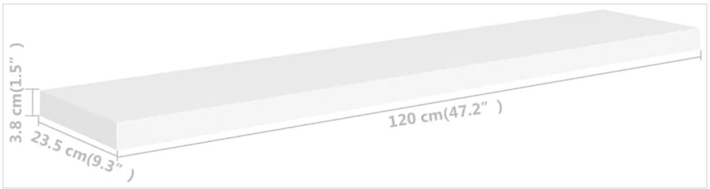
Image: Diagram showing the dimensions of the floating shelf.