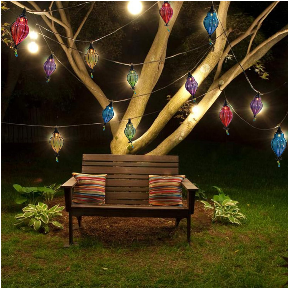
Image: String lights installed outdoors, providing ambient lighting over a patio bench.

Your browser does not support the video tag.