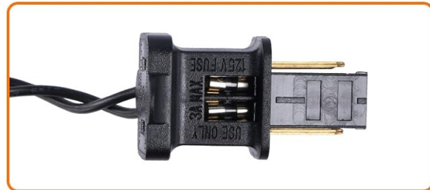
2 SPARE FUSES