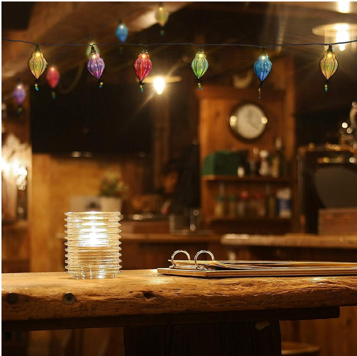
Image: String lights providing ambient lighting in an indoor bistro setting.