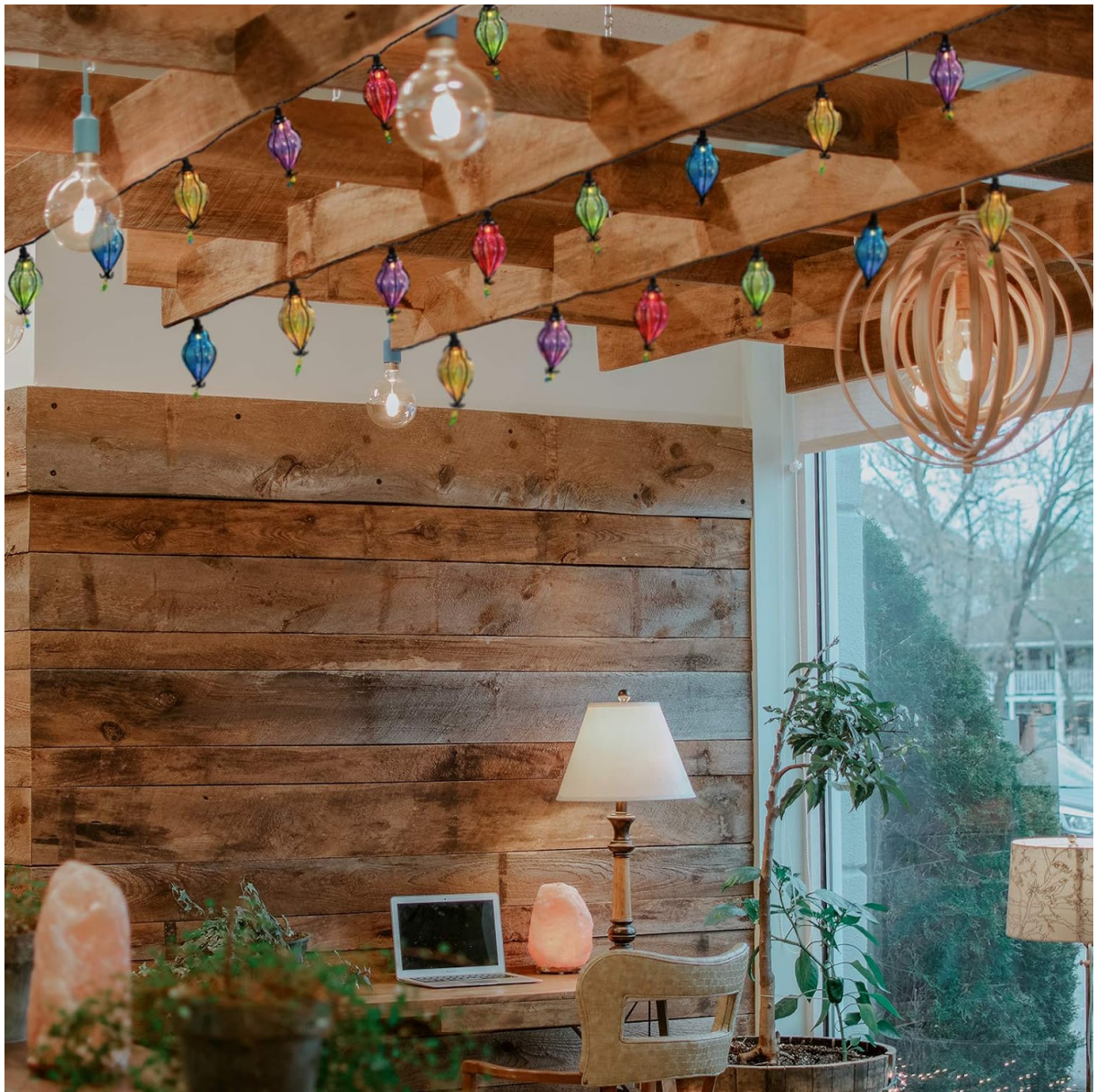
Image: String lights installed indoors, draped across a wooden ceiling structure.