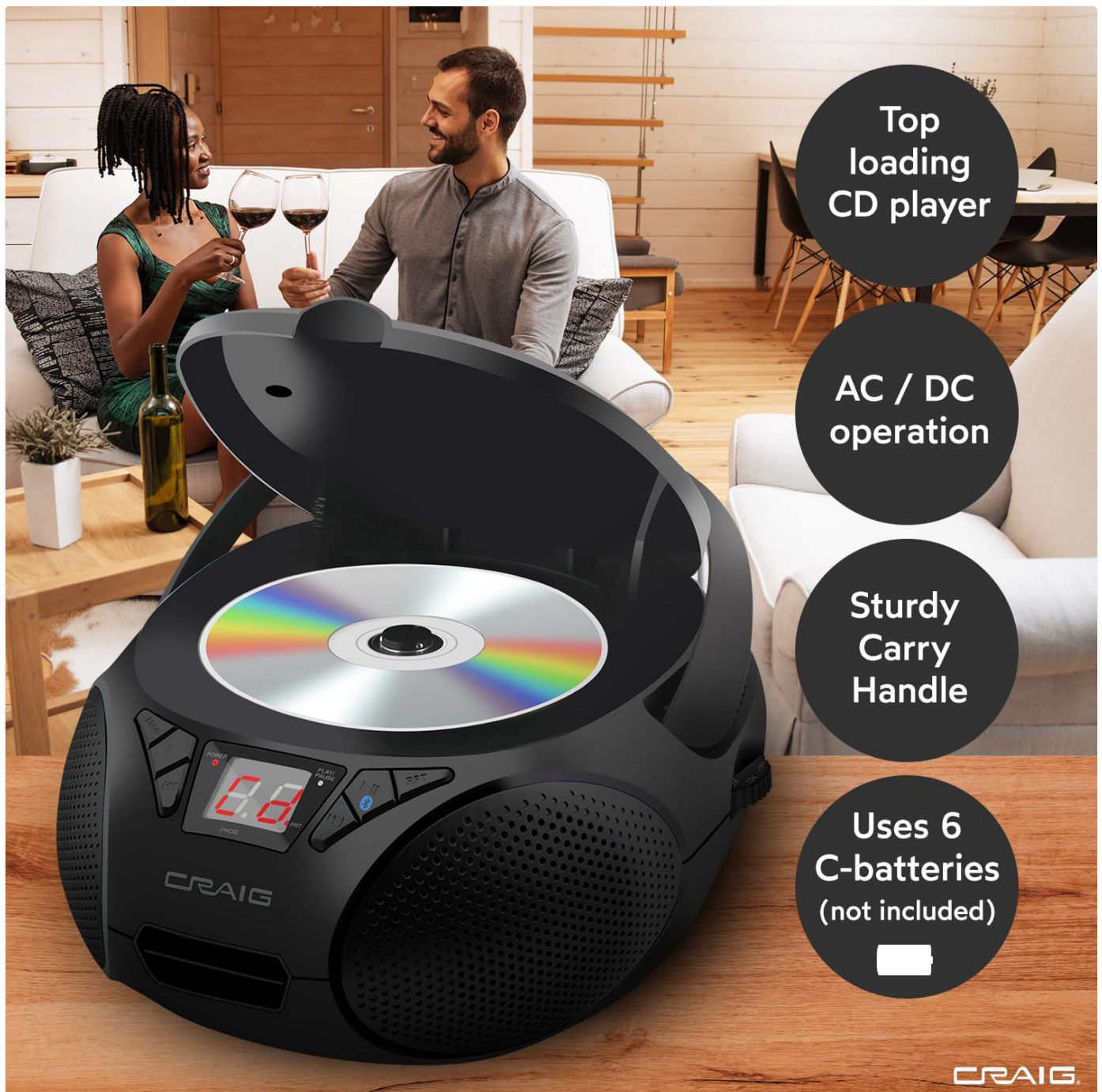
Figure 6.1: Illustrates the top-loading CD player and power options. This image shows the boombox with its CD compartment open, and text indicating AC/DC operation and battery requirements.