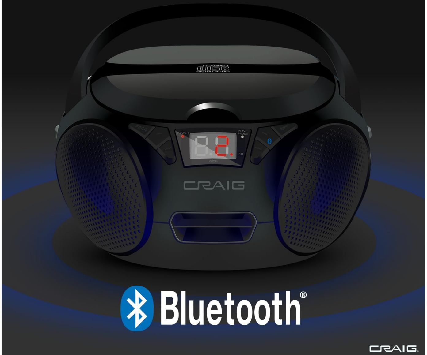
Figure 7.1: Illustrates Bluetooth connectivity. This image shows the boombox with a prominent Bluetooth logo, indicating its wireless audio streaming capability.