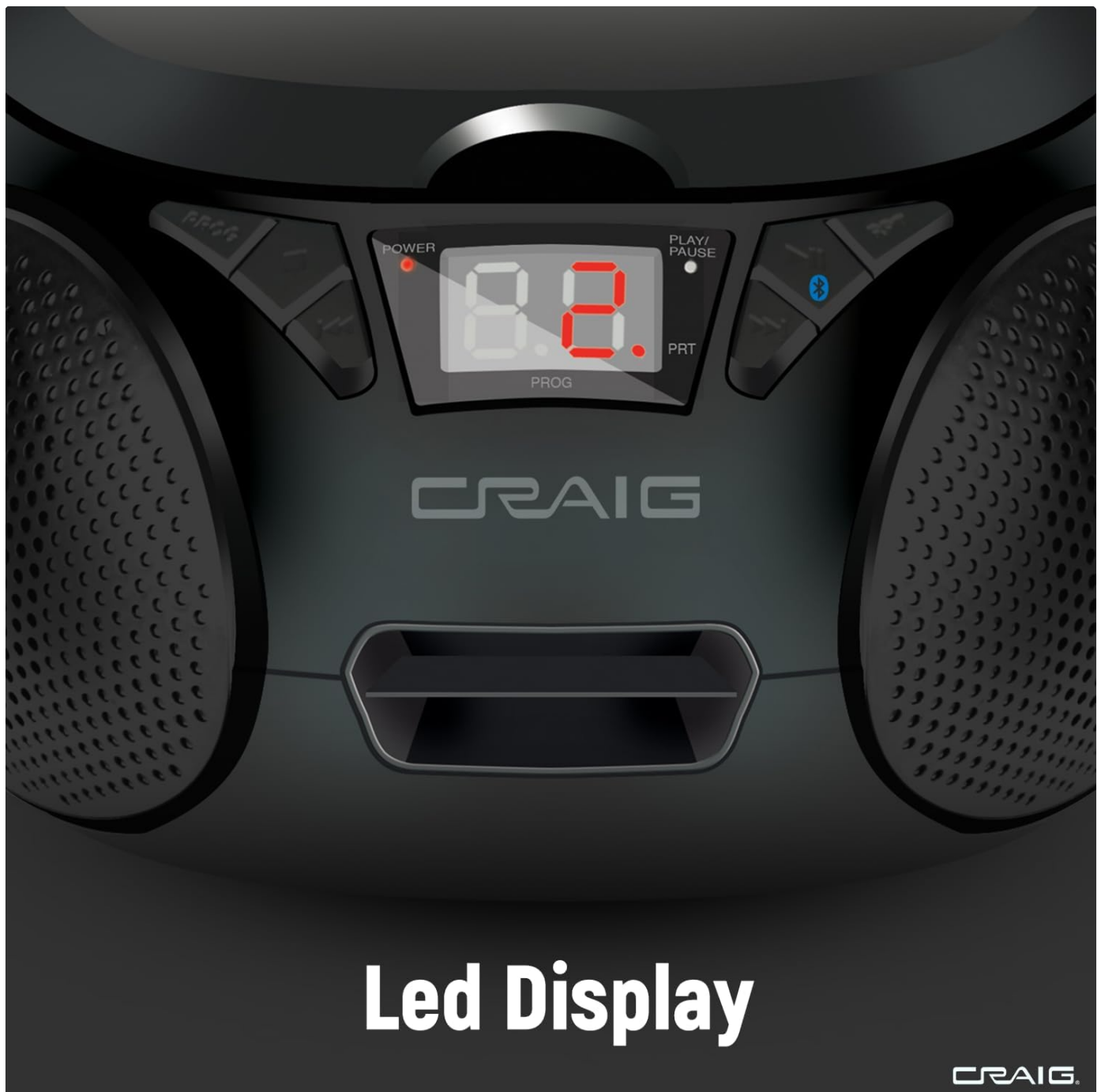
Figure 5.1: Close-up of the LED display and control buttons. This image provides a detailed view of the central control panel, including the digital display and various function buttons.