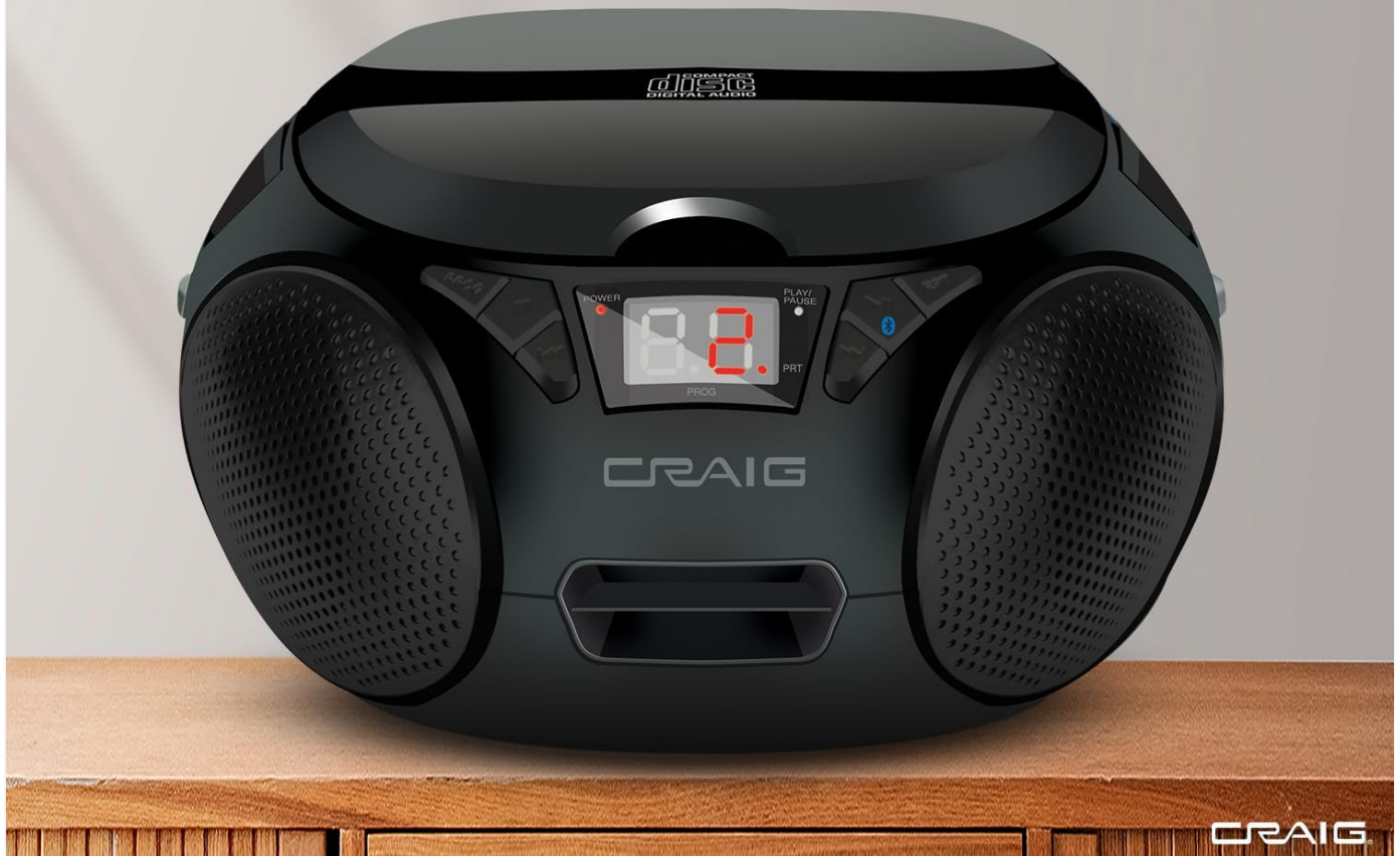
Figure 4.1: Overview of key features. This image highlights the main functionalities of the boombox, including CD compatibility, radio, LED display, audio output, and Bluetooth connectivity.