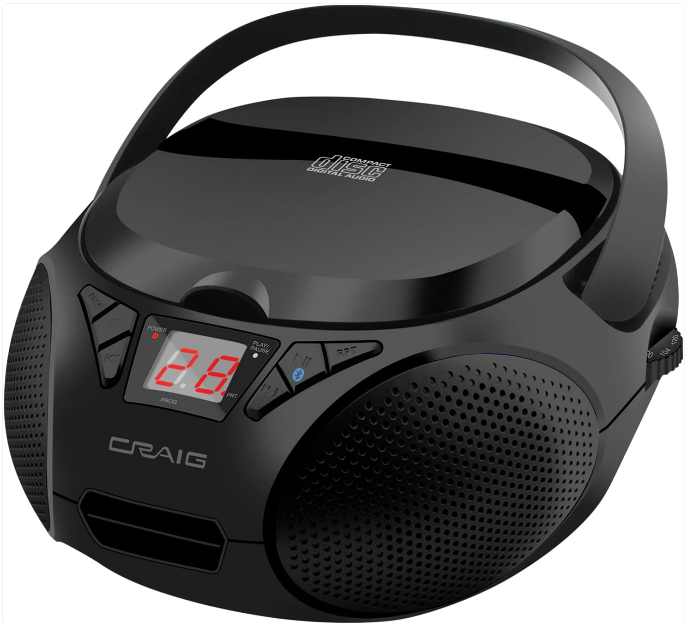
Figure 1.1: Front view of the Craig CD6925 Boombox. This image displays the main unit with its controls and speakers, providing a general overview of the product's appearance.