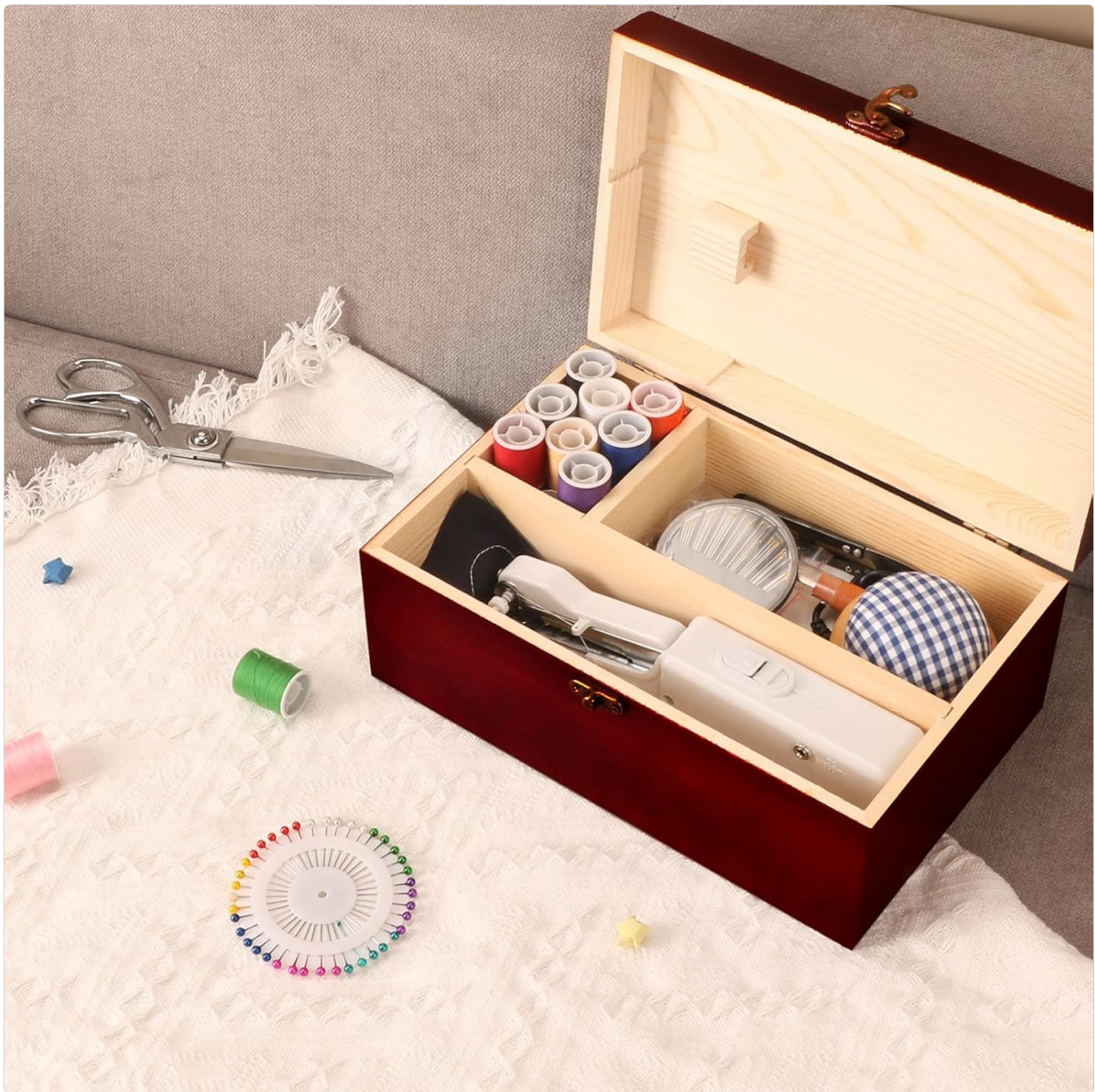
Image: Visual examples of the handheld sewing machine's applications, such as repairing pillows, sheets, shopping bags, jeans, aprons, and dolls.