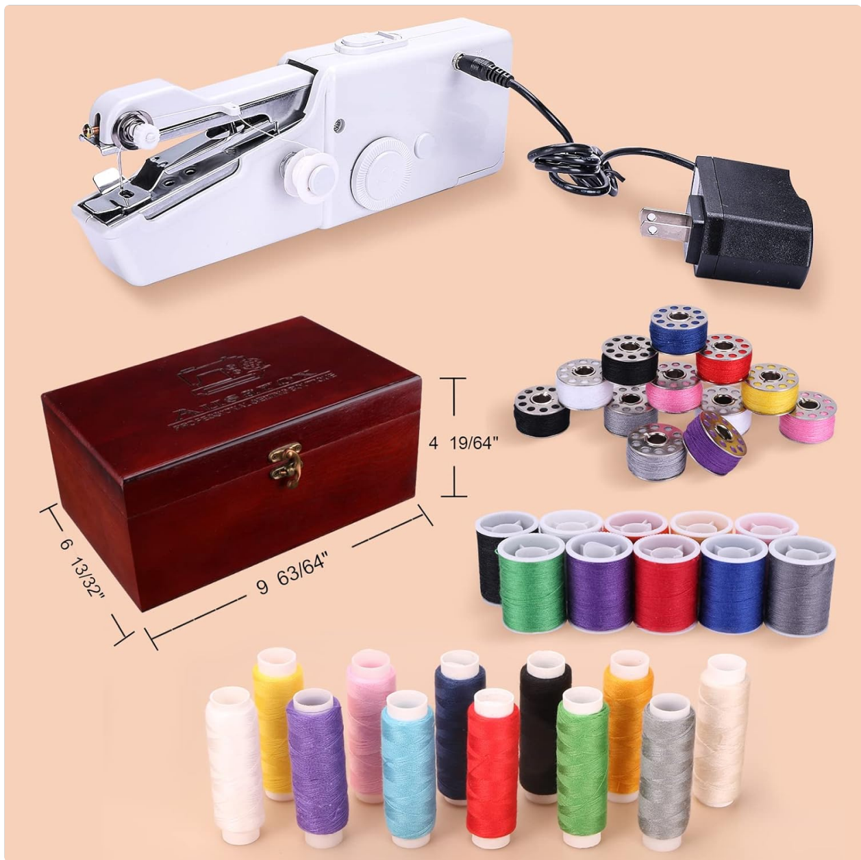
Image: The handheld sewing machine illustrating the battery compartment for 4 AA batteries and the connection point for the 6V power adapter.