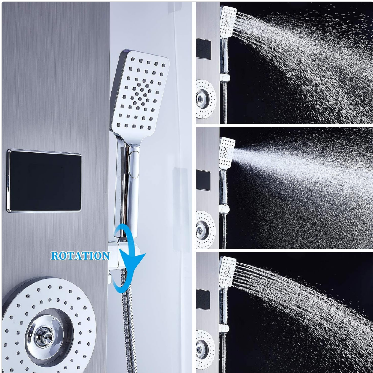
Figure 7.3: A close-up view illustrating the rotation capability of the handheld shower unit on the ELLO&ALLO Shower Panel, allowing for adjustable spray direction.