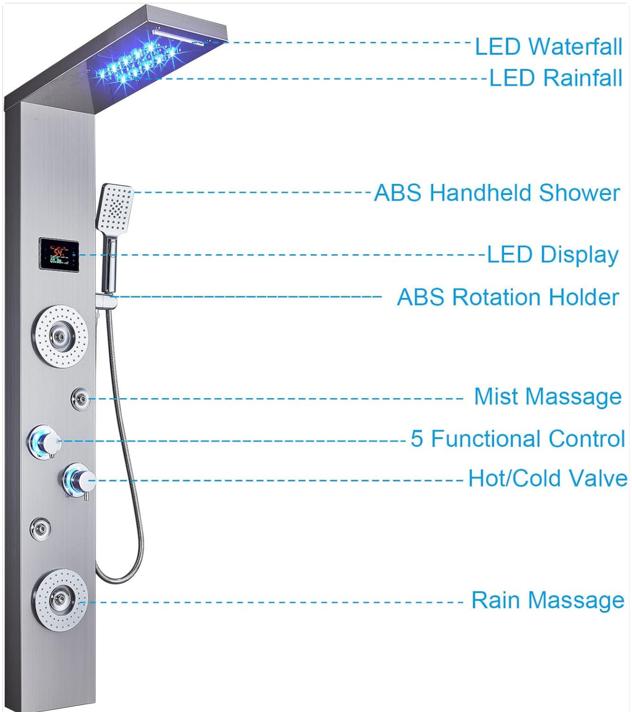
Figure 4.1: Labeled diagram of the ELLO&ALLO Shower Panel, indicating the LED Waterfall, LED Rainfall, ABS Handheld Shower, LED Display, ABS Rotation Holder, Mist Massage jets, 5 Functional Control knob, Hot/Cold Valve, and Rain Massage jets.

Familiarize yourself with the components of your shower panel system: