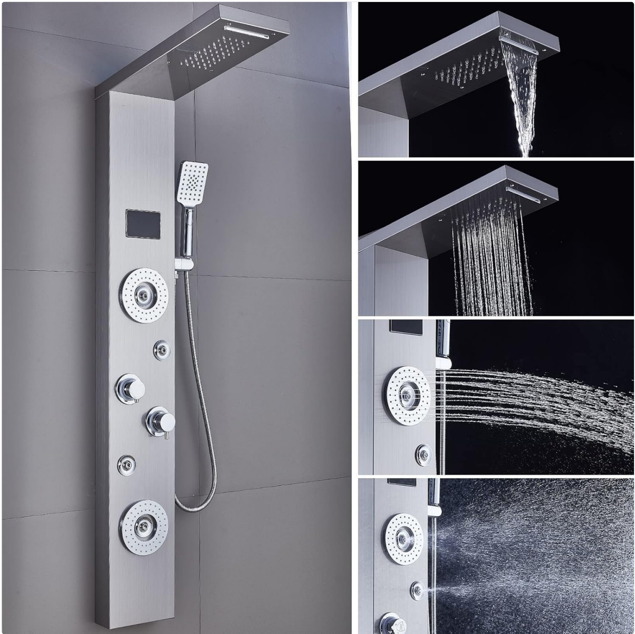
Figure 7.2: The ELLO&ALLO Shower Panel showcasing the distinct spray patterns of the waterfall, rainfall, mist massage, and rain massage functions.