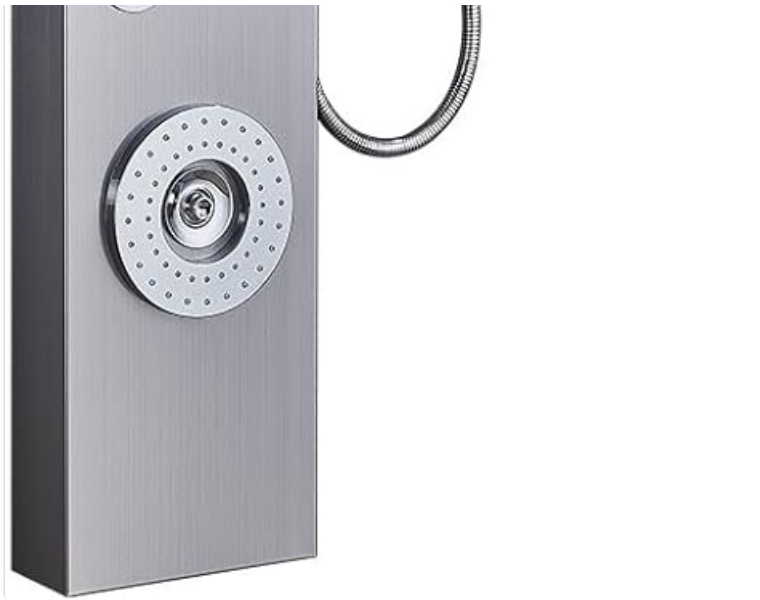
Figure 6.1: An ELLO&ALLO Shower Panel with LED rainfall showerhead, handheld shower, and body jets, showcasing its design and typical installation appearance.