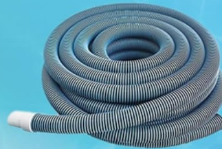
25-Ft Vacuum Hose