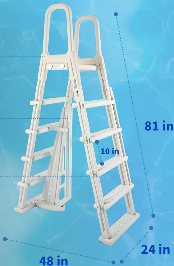
Image: The A-frame pool ladder, detailing its dimensions (81 inches high, 48 inches wide, 24 inches deep) and features like durable resin materials, a two-piece barrier, and lockable flip-up steps.

For detailed, step-by-step instructions, always refer to the official PDF user manual provided with your product or available for download from the manufacturer's website.