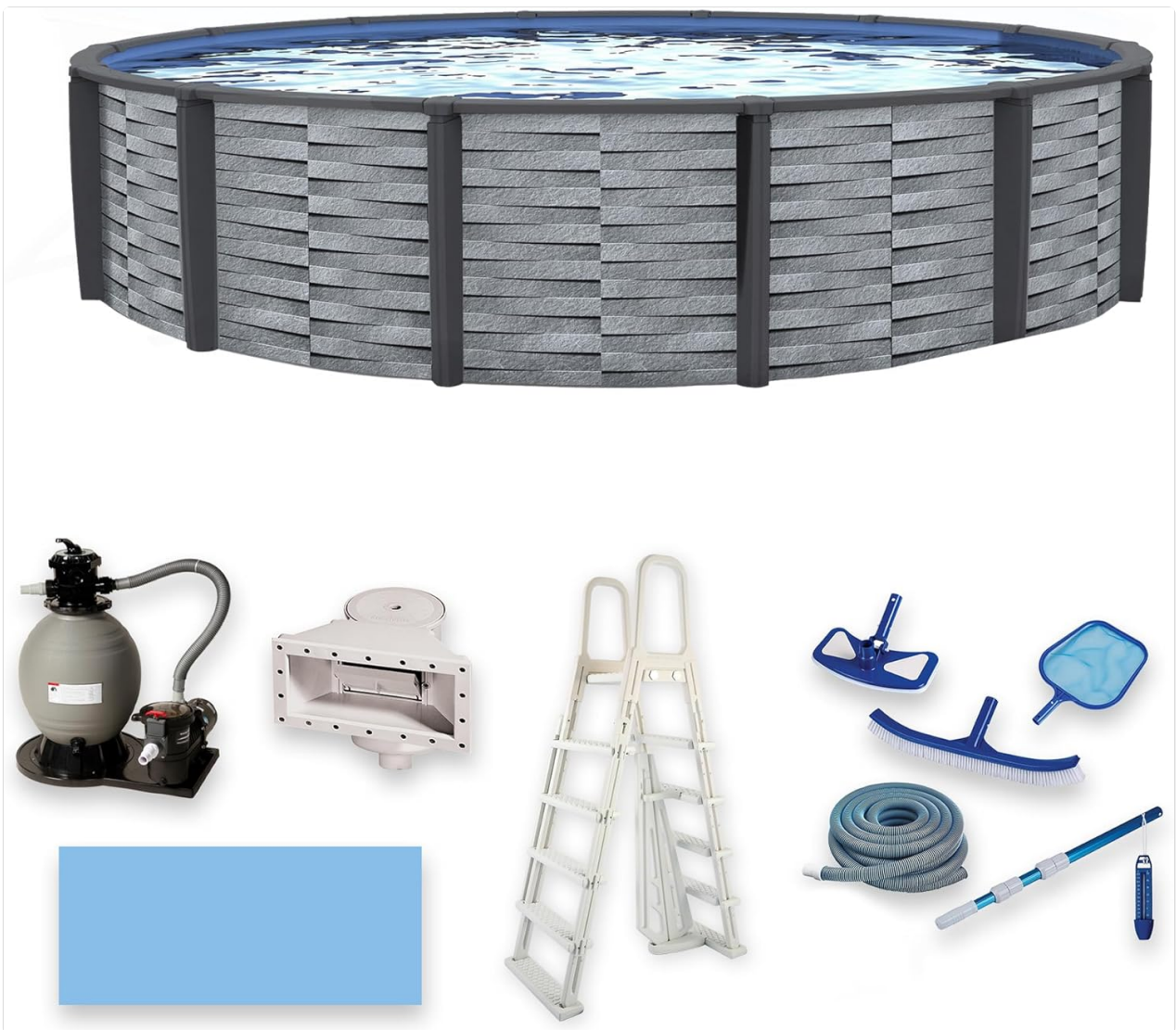
Image: The complete Blue Wave Affinity 18-ft Round Above Ground Swimming Pool, assembled and filled with water.