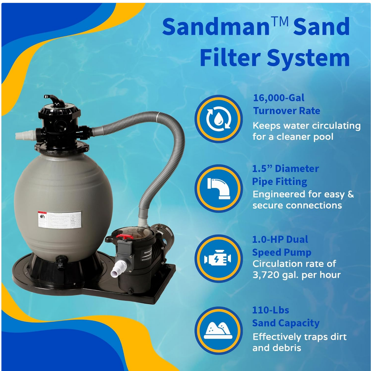
Image: The Sandman Sand Filter System, showing the sand tank, pump, and connecting hoses, with specifications like 16,000-gallon turnover rate and 1.0 HP dual-speed pump.