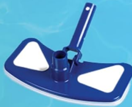
Vinyl Liner Vacuum Head