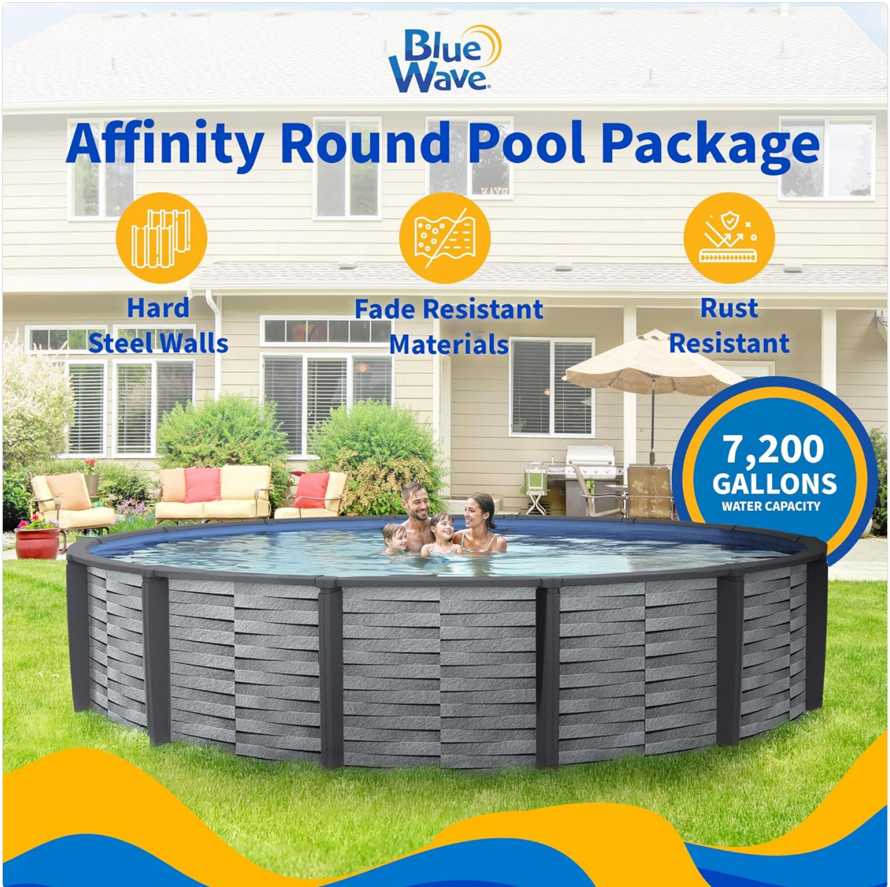
Image: An aerial view of the Blue Wave Affinity pool in a backyard setting, highlighting its hard steel walls, fade-resistant materials, rust resistance, and 7,200-gallon water capacity.