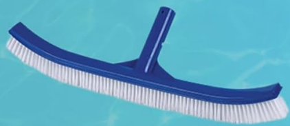
Nylon Wall Brush