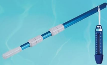
3-Piece 12-Ft Pole and Thermometer