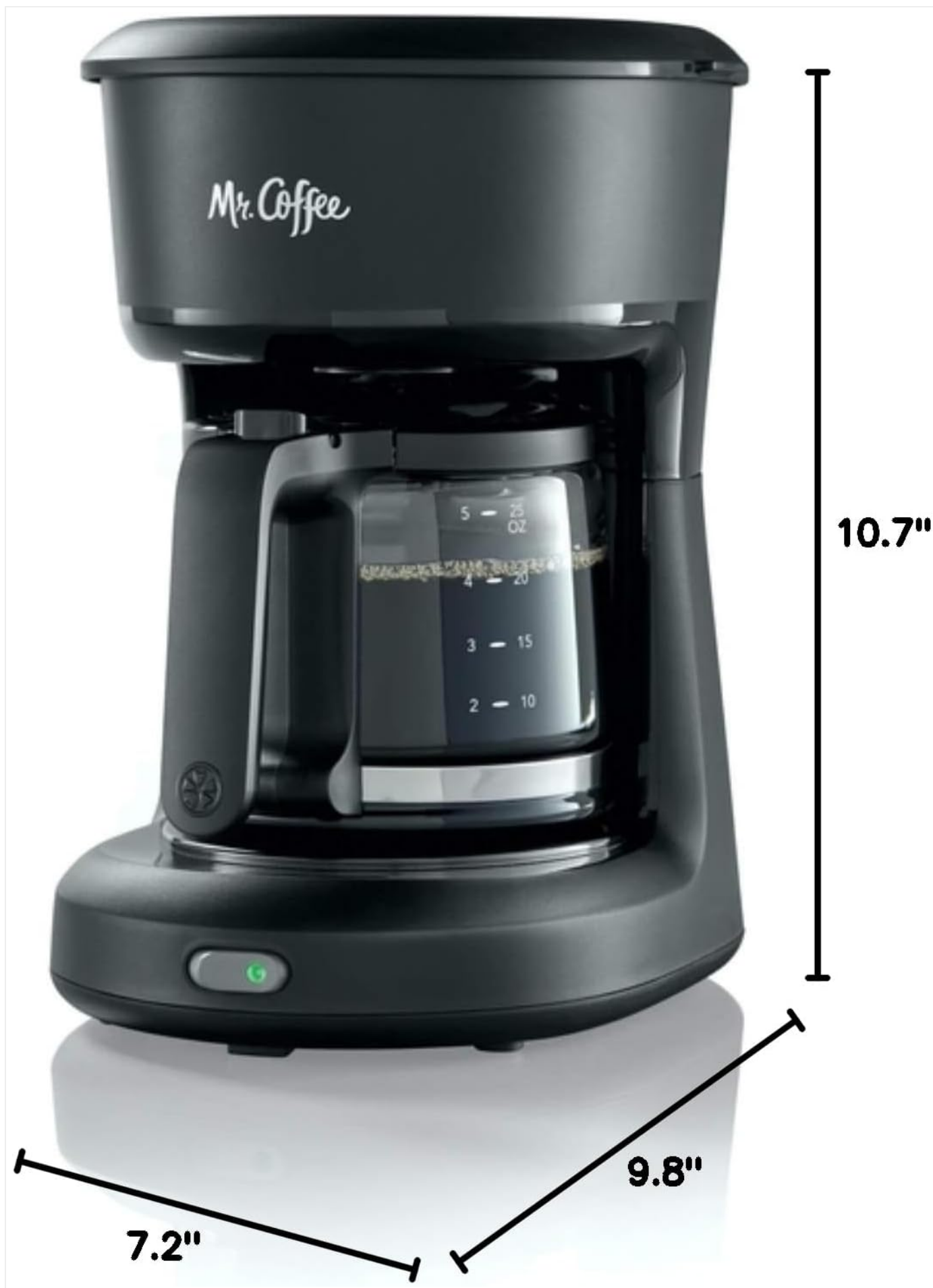
Image: Side view of the Mr. Coffee 5-Cup Mini Brew Switch Coffee Maker with its dimensions labeled. The height is 10.7 inches, depth is 7.2 inches, and width is 9.8 inches, highlighting its compact size.