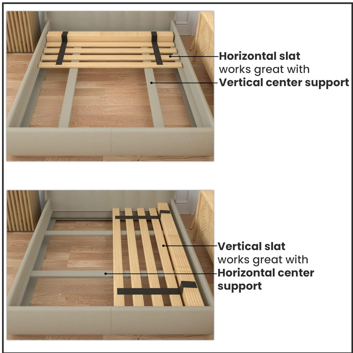
Figure 3: Visual guide illustrating the difference between horizontal and vertical slat placement and their compatibility with different types of center supports. This product uses vertical slats.