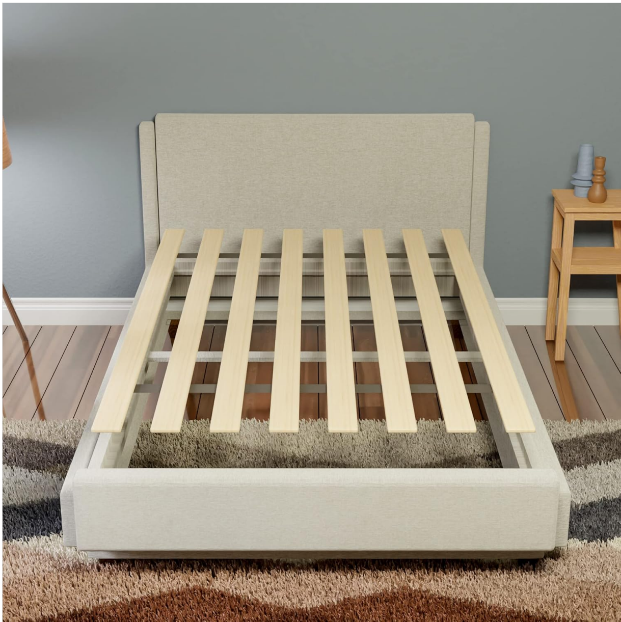
Figure 5: A visual representation of the Mayton bed slats properly installed within a bed frame, demonstrating their appearance and fit.