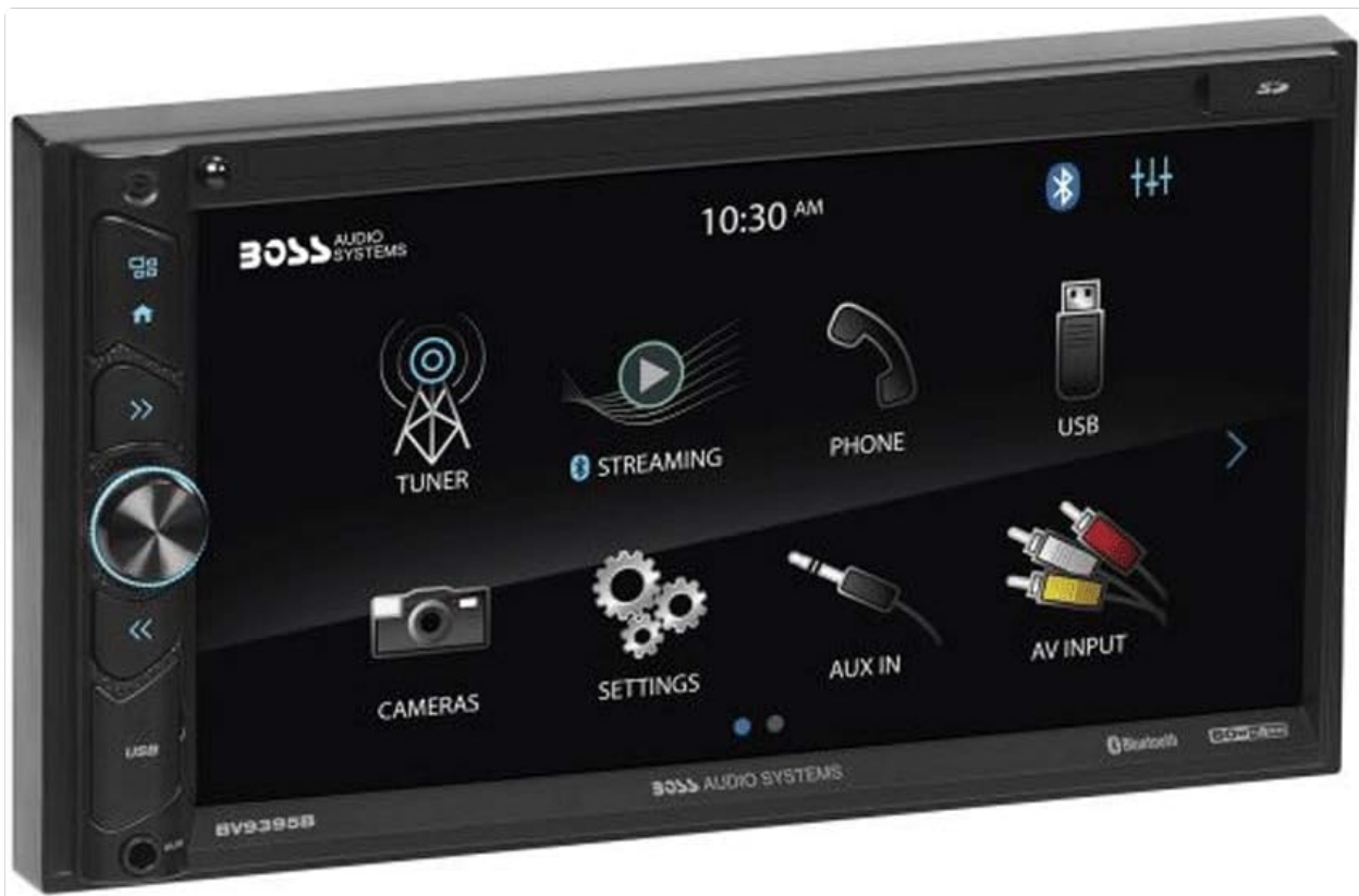
Image 1.2: Angled view of the BV9395B unit, highlighting its double DIN form factor.