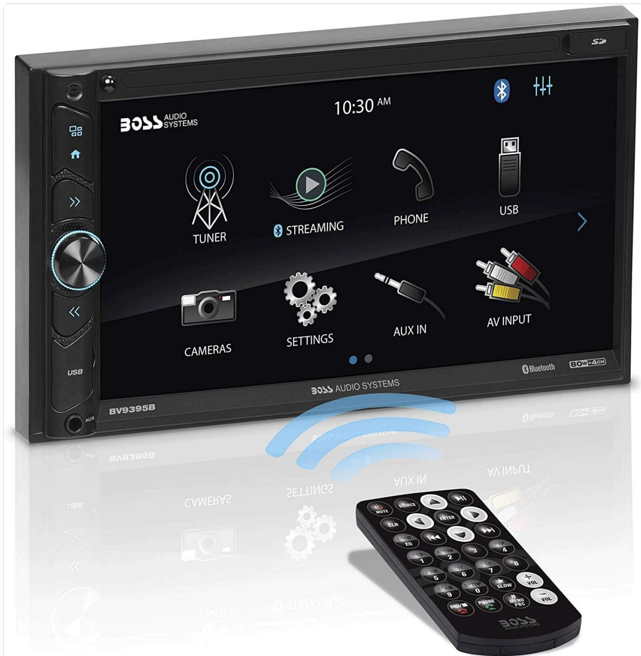
Image 6.2: The BV9395B unit demonstrating wireless control capabilities with the remote.