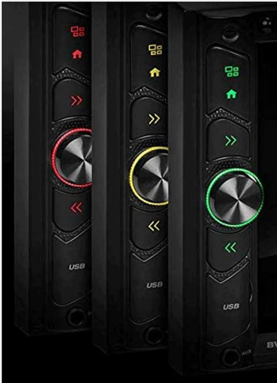
Image 6.1: Example of the multi-color illumination feature on the unit's side panel.