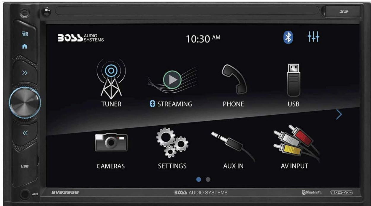
Image 1.1: Front view of the BV9395B Car Stereo Receiver displaying the main menu interface.

The BOSS Audio Systems BV9395B is a double DIN car stereo receiver featuring a 6.95-inch touchscreen display. It integrates various multimedia functionalities including Bluetooth for hands-free calling and audio streaming, A-Link for screen mirroring with Android devices, and multiple media playback options. This manual provides essential information for the proper installation, operation, and maintenance of your BV9395B unit.