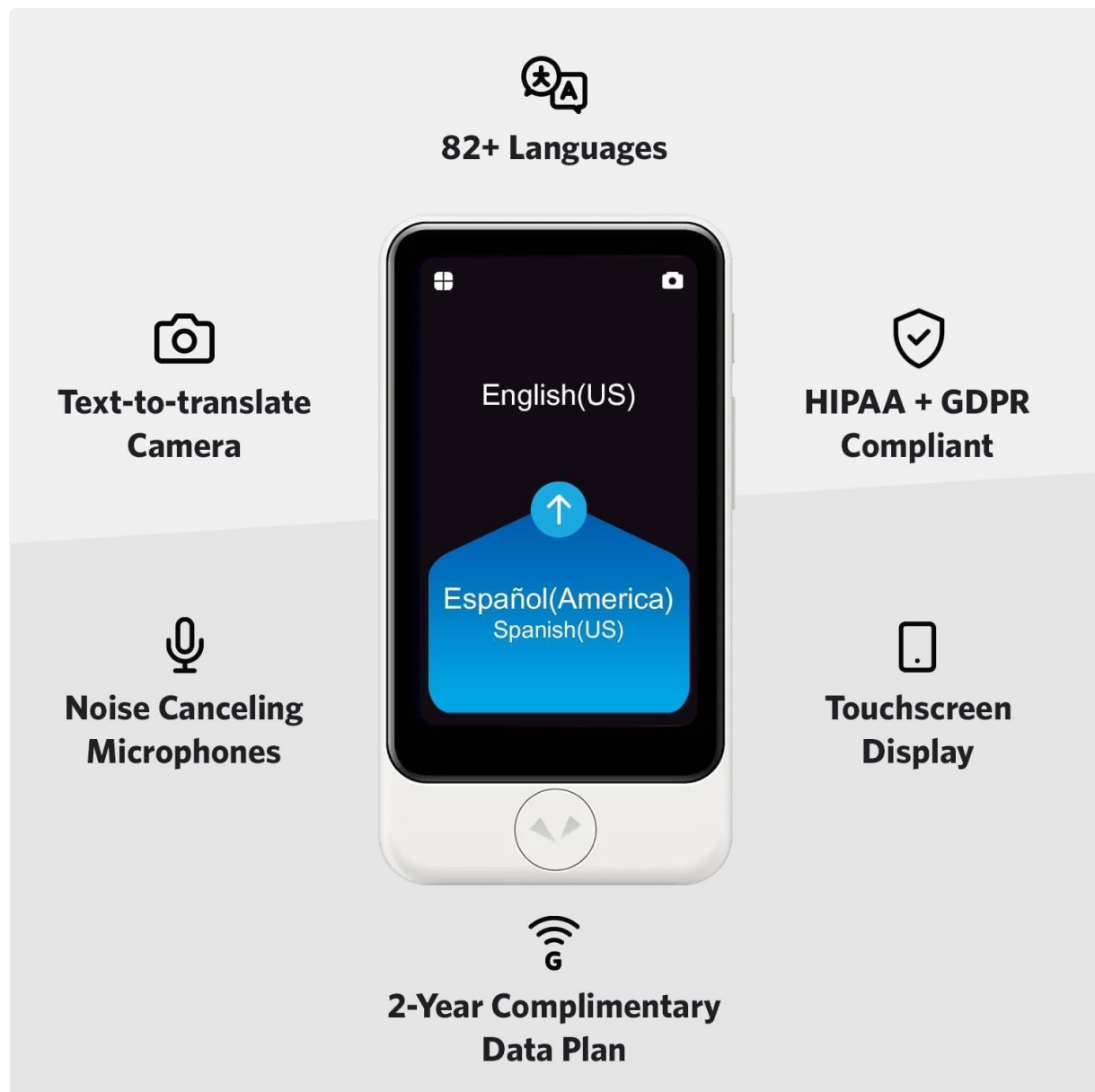
Image: Overview of POCKETALK Plus key features, including language support, camera translation, and data plan.