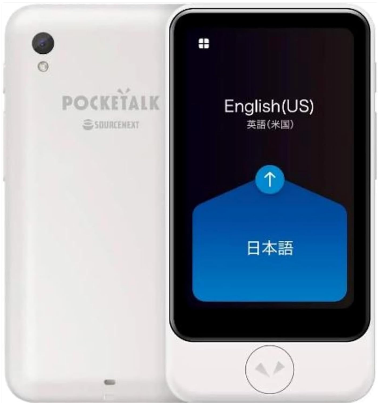
Image: Front and back view of the POCKETALK Plus device, showing its display and rear camera.

The POCKETALK Plus features a sleek design with a large touchscreen on the front and a camera on the back. It includes essential buttons for power, volume, and translation activation. The device is designed for intuitive one-handed operation.