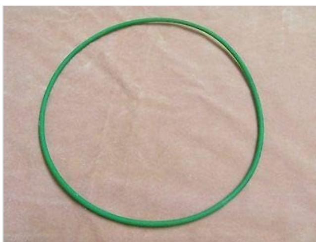
Image 2: The N-brand replacement blower fan belt laid flat on a textured surface, highlighting its green color and circular shape. This image provides a clearer view of the belt's material and form.