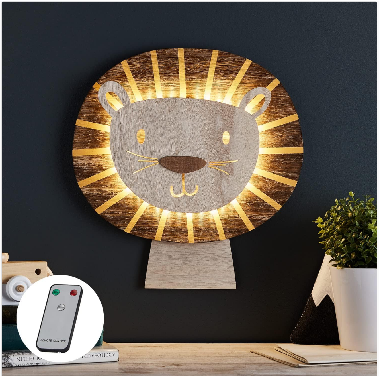
Image: The illuminated lion head wall light with its remote control.