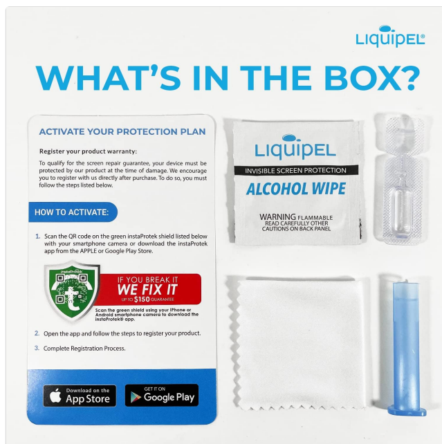
Image: The LIQUIPEL Liquid Glass Screen Protector kit, displaying the liquid glass vial, alcohol wipe, microfiber cloth, and the protection plan activation card.