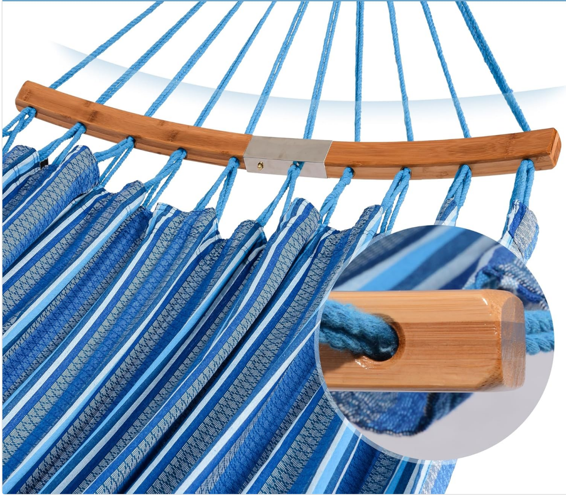
Figure 3.1: Detail of the strong curved spreader bar, highlighting the connection mechanism and the countersunk holes for ropes. The curved design helps maintain hammock shape.