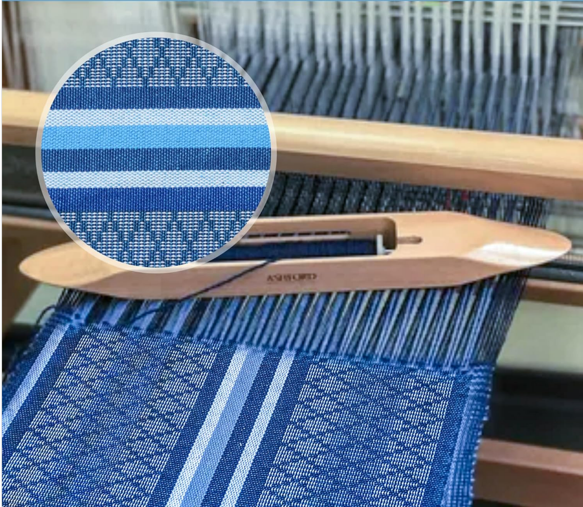
Figure 5.1: The upgraded poly-cotton fabric of the hammock, known for its durability and comfort. Regular cleaning helps maintain its quality.