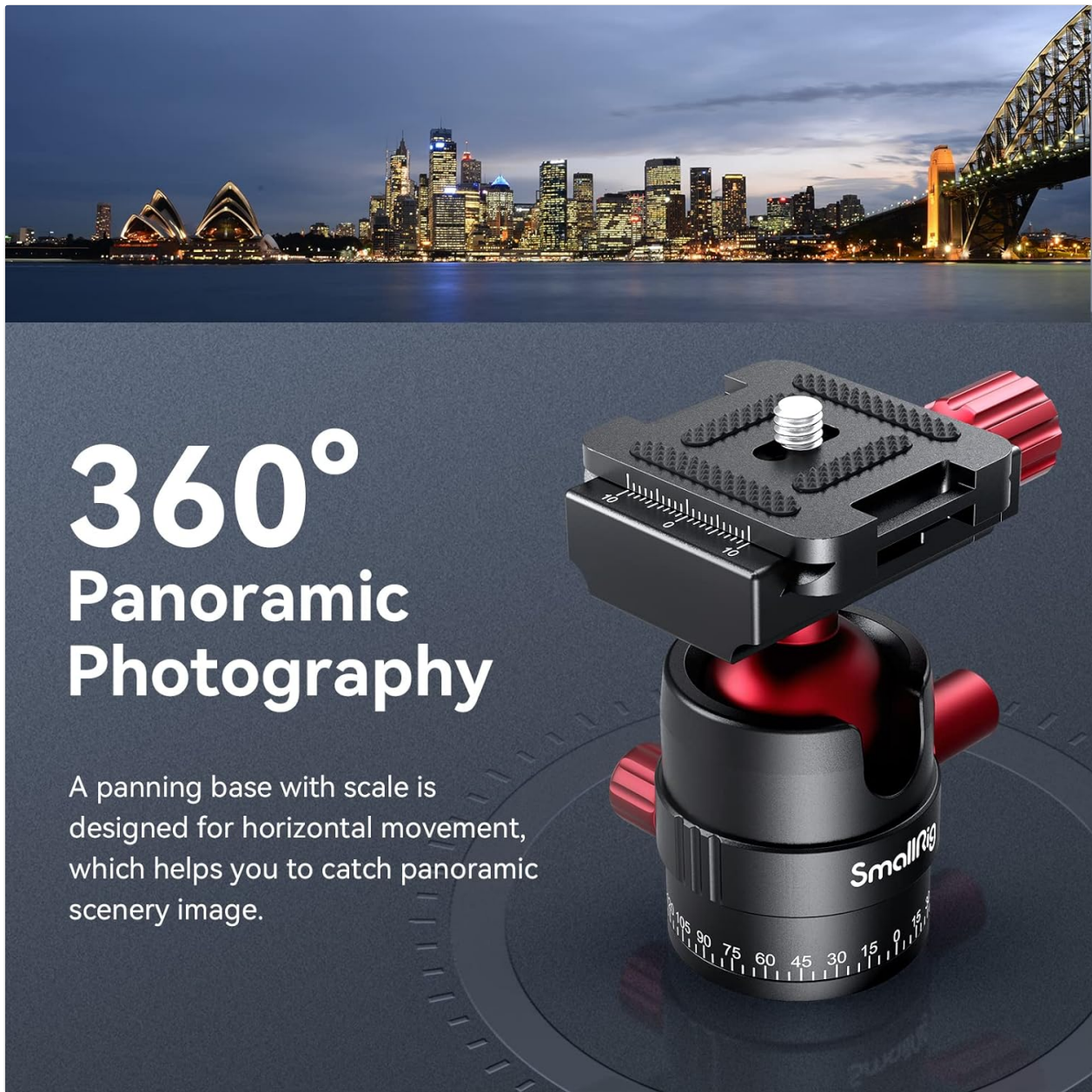
Figure 6: The 360° panoramic feature allows for seamless horizontal rotation, ideal for capturing wide landscapes or sweeping scenes.