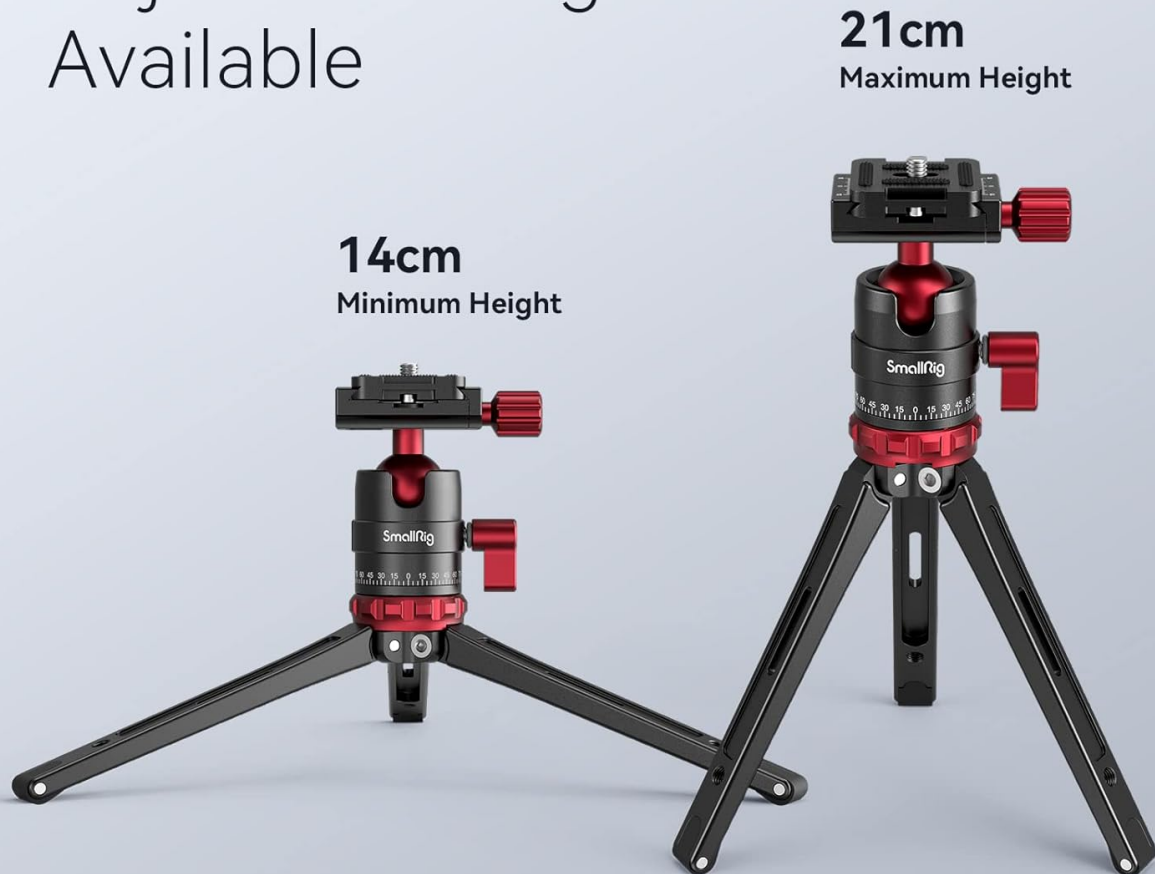
Figure 4: The tripod can be adjusted to two distinct heights, offering flexibility for various shooting scenarios.