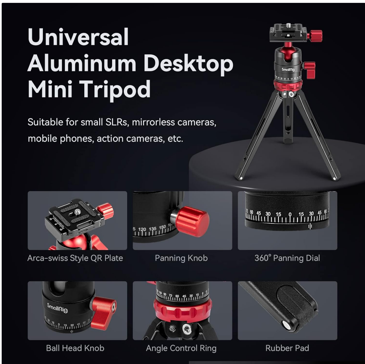
Figure 1: Universal Aluminum Desktop Mini Tripod with labeled components including Arca-Swiss style QR Plate, Panning Knob, 360° Panning Dial, Ball Head Knob, Angle Control Ring, and Rubber Pad.

Familiarize yourself with the main components of your SMALLRIG 3033 Mini Tripod: