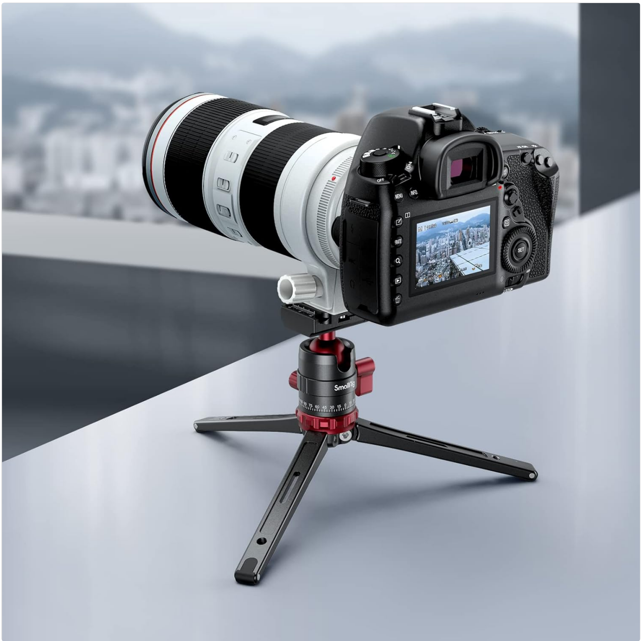
Figure 3: A DSLR camera is shown securely mounted on the SMALLRIG 3033 Mini Tripod, ready for use.