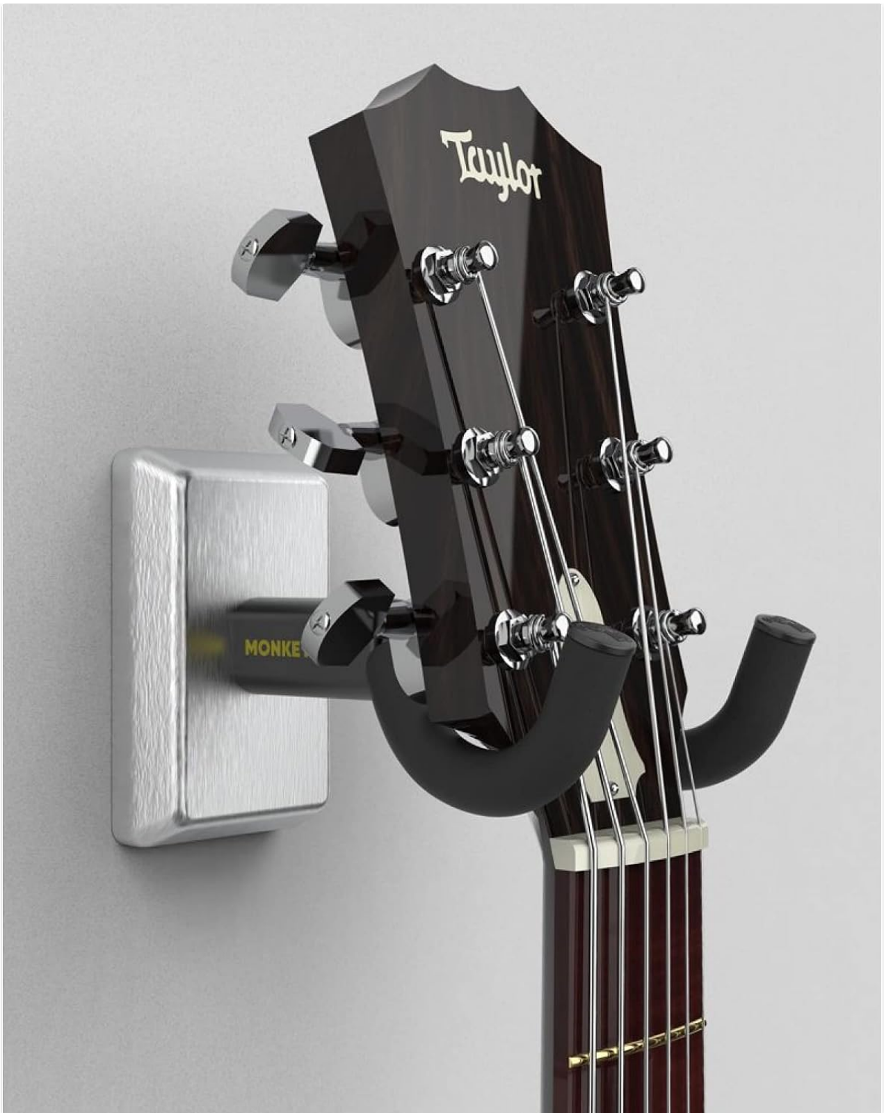
Figure 4: An electric guitar displayed on the wall mount.