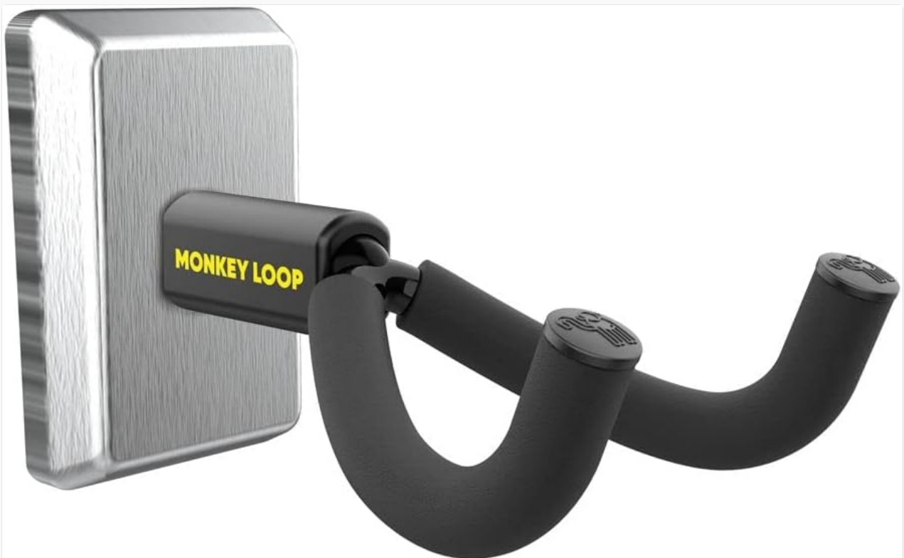
Figure 2: Front view of the assembled MONKEY LOOP Wall Prime Chrome guitar wall mount.