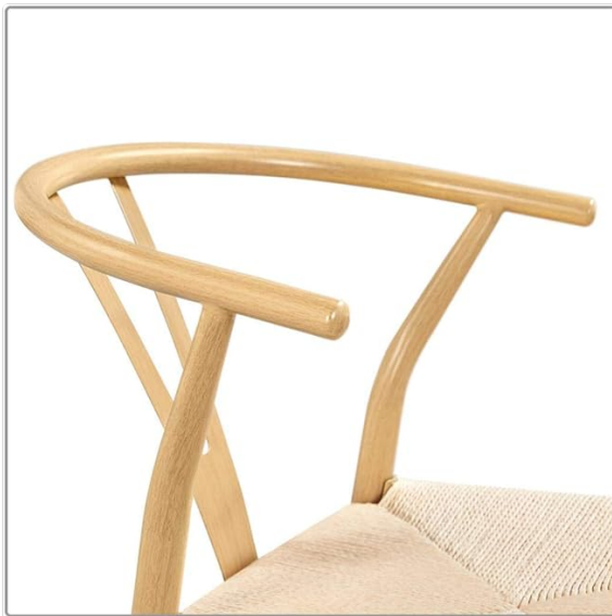
Integral Armrest & Backrest