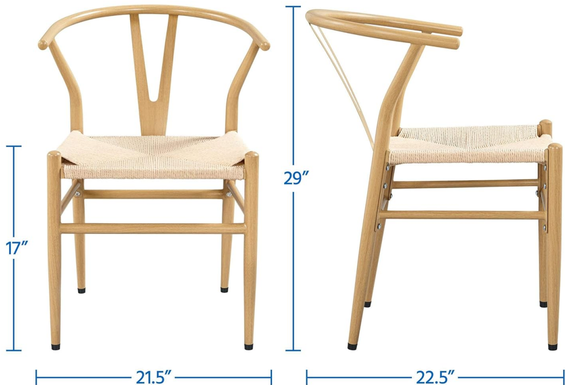
Figure 5: Product Dimensions and Weight Capacity