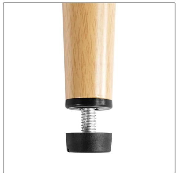
Adjustable Foot Pads