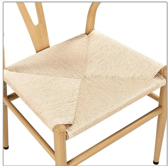
Natural Paper Twine