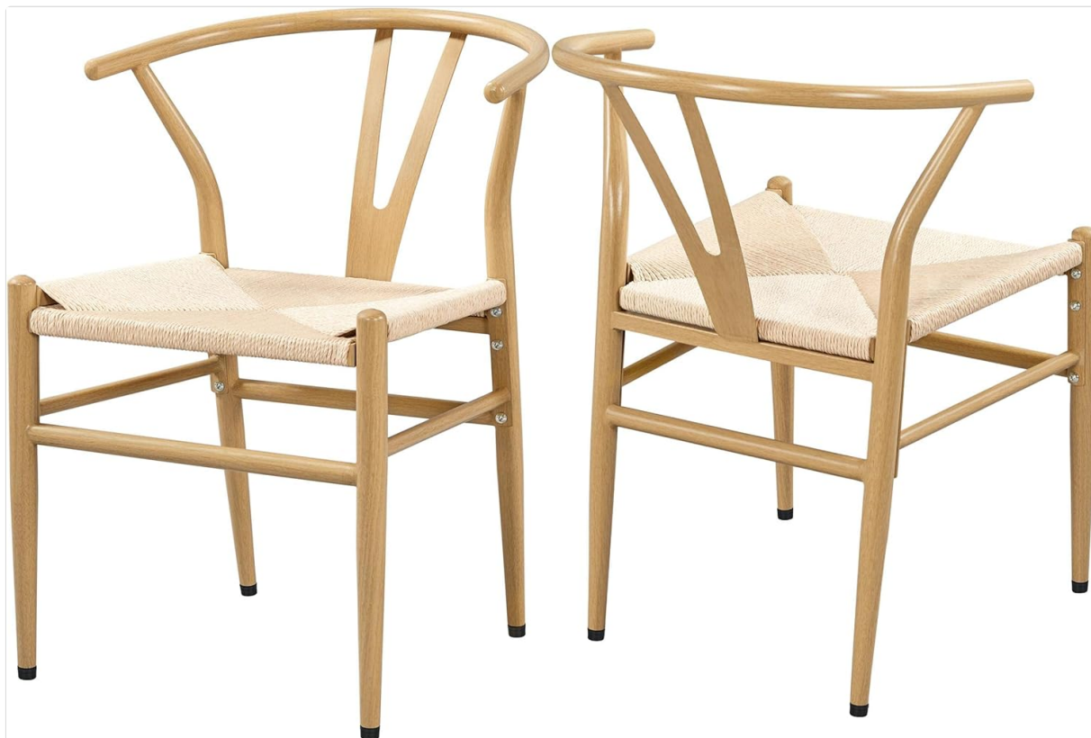
Figure 1: Yaheetech Metal Weave Arm Chairs (Set of 2)

Thank you for choosing the Yaheetech Metal Weave Arm Chair. This manual provides essential information for the safe and correct assembly, operation, and maintenance of your new dining chairs. Please read these instructions thoroughly before beginning assembly and retain them for future reference.