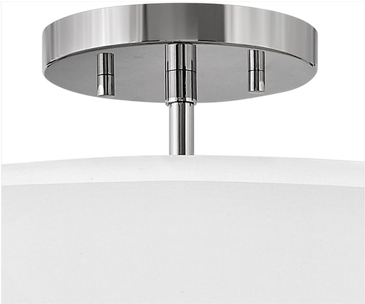
Figure 5.1: Close-up view of the fixture's canopy, showing the polished nickel finish and attachment points to the ceiling.