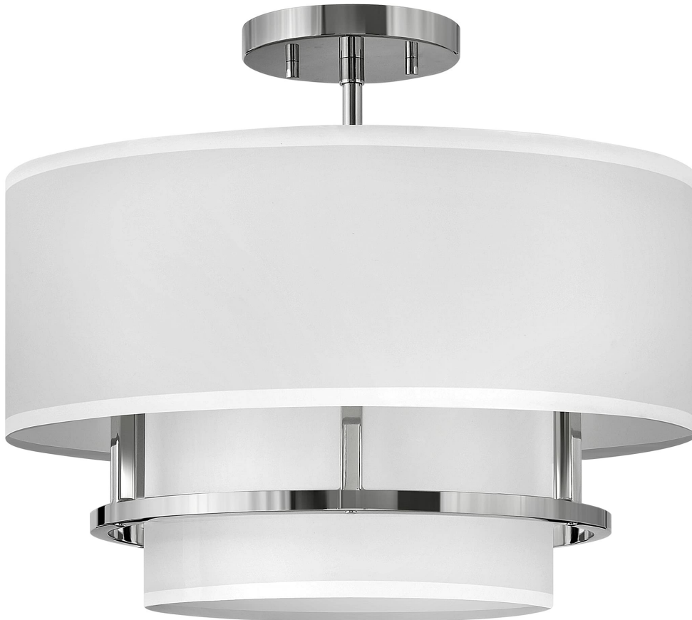
Figure 1.1: The Hinkley Graham 38893PN Medium Semi-Flush Mount Ceiling Light in Polished Nickel. This image shows the overall design of the fixture with its double drum faux parchment shades and polished nickel frame.

Your browser does not support the video tag.