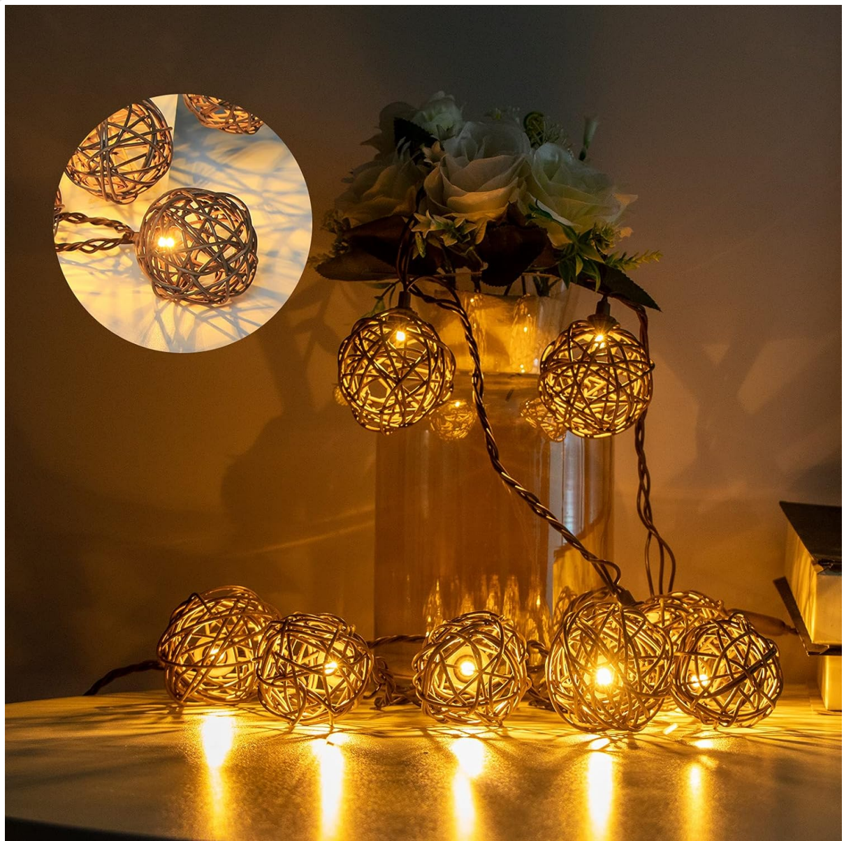
Image 1: Overview of Vigdur Rattan Ball String Lights, showing the 9.84 ft length and individual ball dimensions of 2.75 inches.

Carefully remove the string lights from the packaging. Untangle the string and inspect all components for any signs of damage. Ensure all rattan balls are securely attached to the light string.