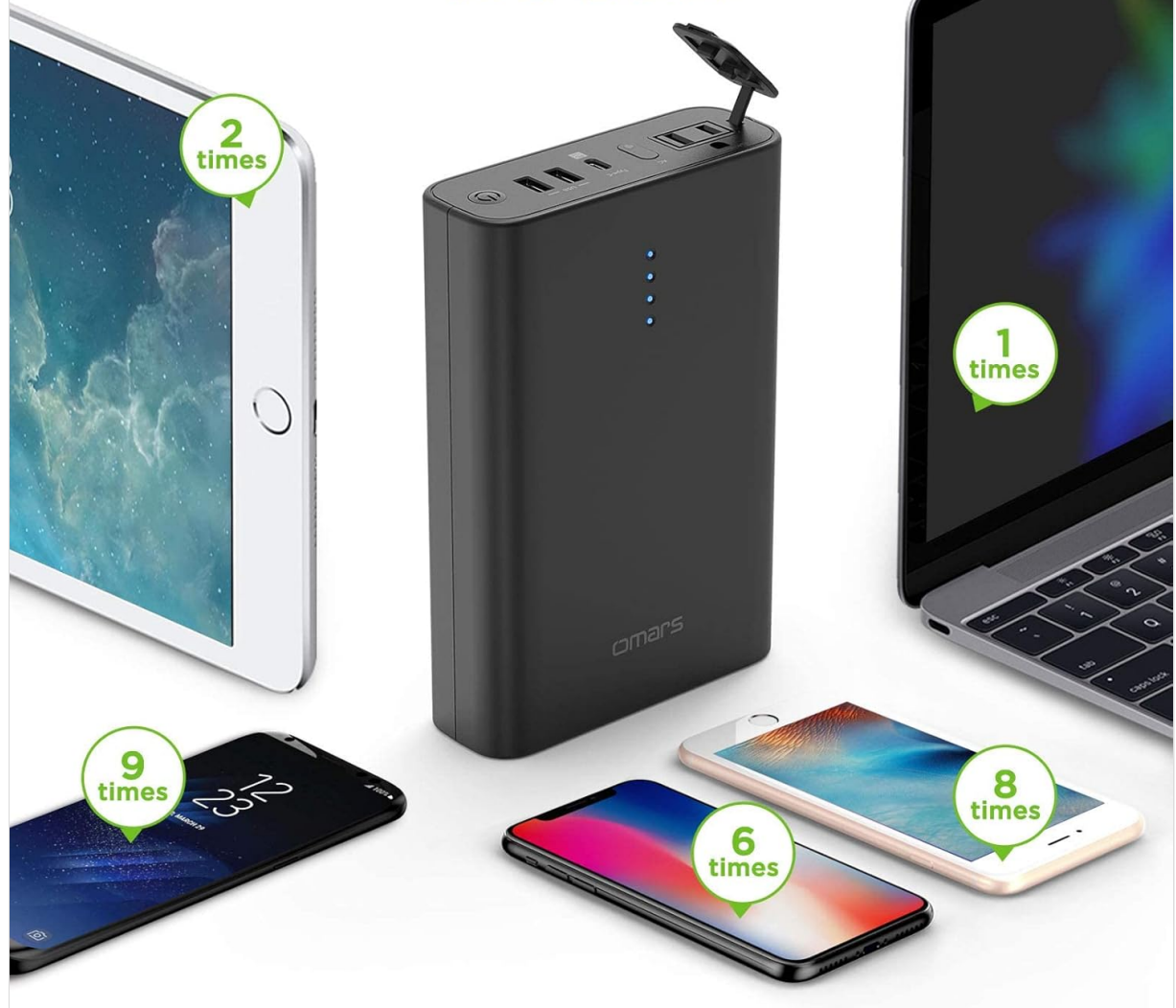
Image: The Omars Portable Power Bank connected to and charging various devices, including a tablet, laptop, and multiple smartphones, demonstrating its multi-device charging capability and estimated charge cycles.