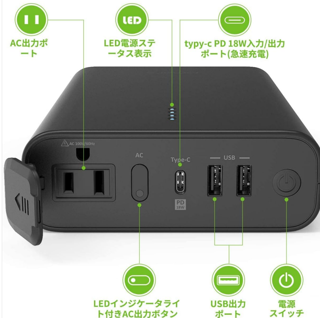
Image: Diagram illustrating the various ports and indicators on the Omars Portable Power Bank, including the AC output port, LED power status indicators, Type-C PD 18W input/output port, USB output ports, and power switch.