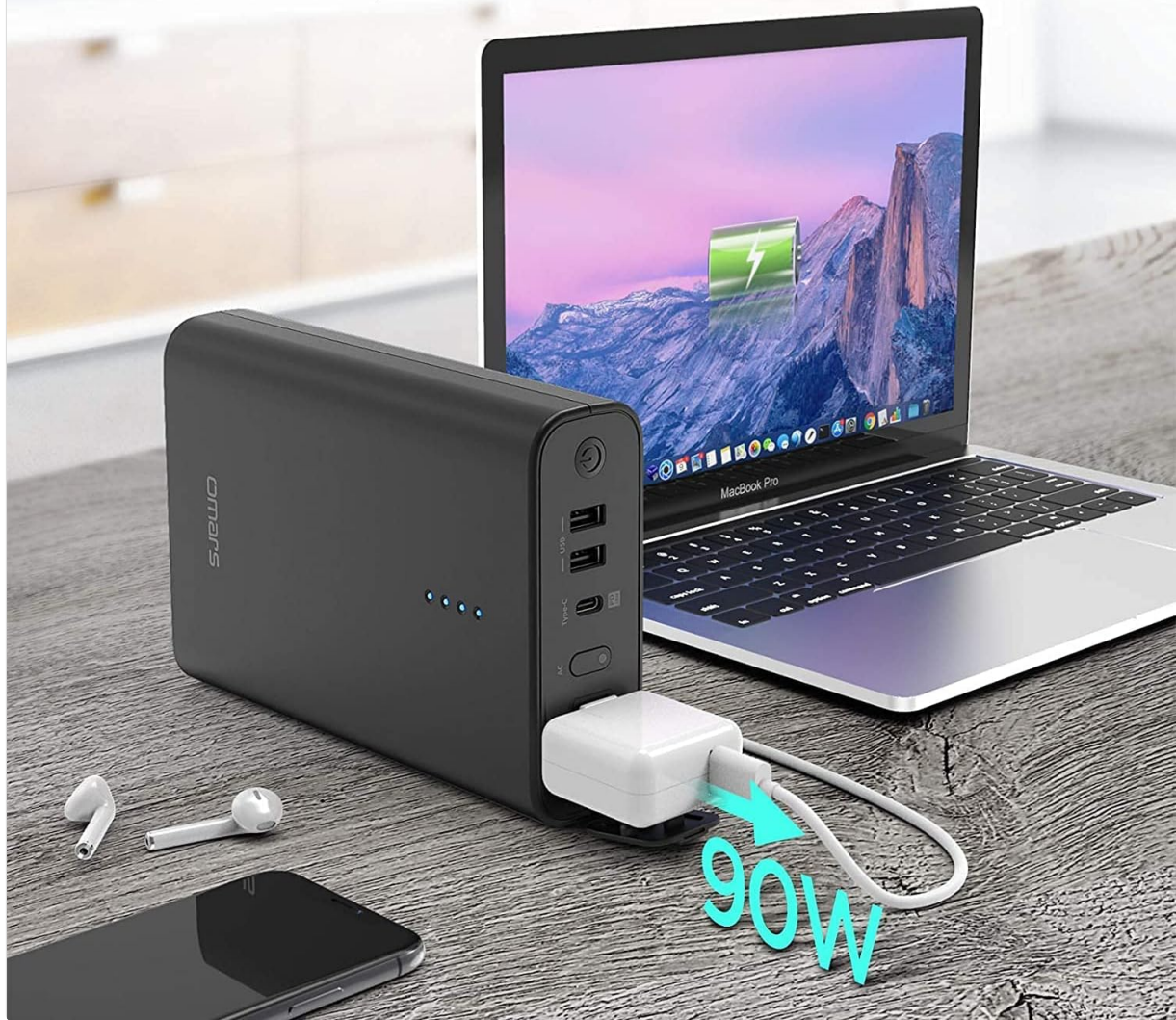
Image: The Omars Portable Power Bank providing power to a laptop via its AC output, highlighting its compatibility with devices under 90W.