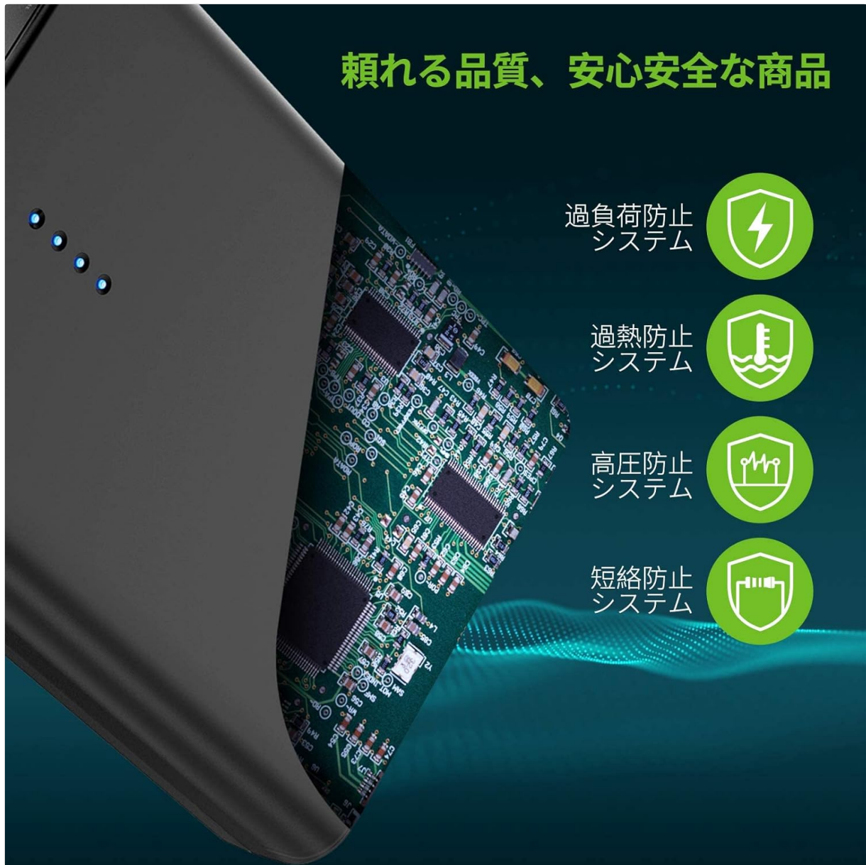
Image: Diagram illustrating the multiple safety protection systems integrated into the Omars Portable Power Bank, including overcurrent, overtemperature, overvoltage, and short circuit protection.