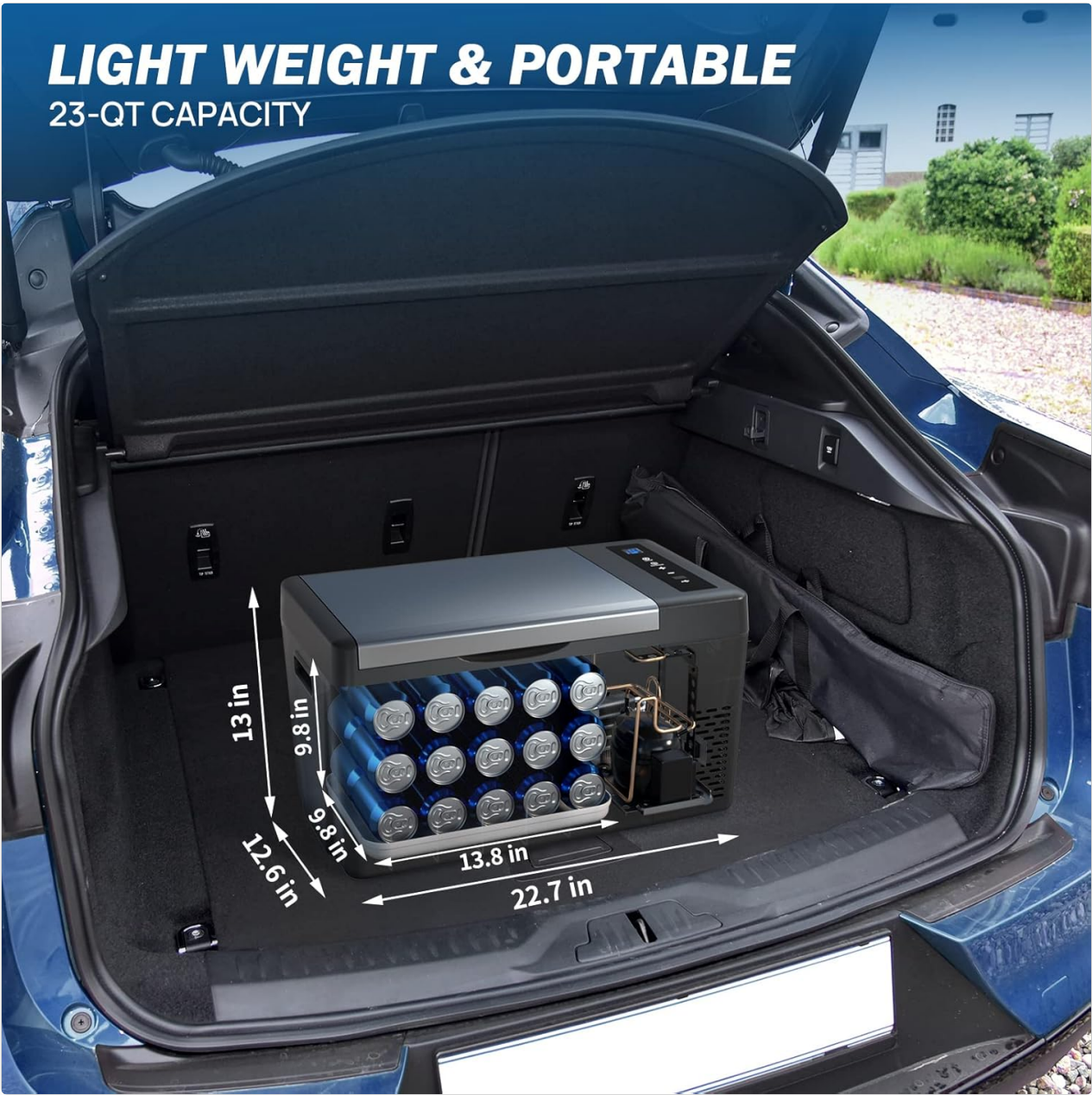
Figure 13: The external dimensions of the portable fridge, indicating its compact size for various placements.