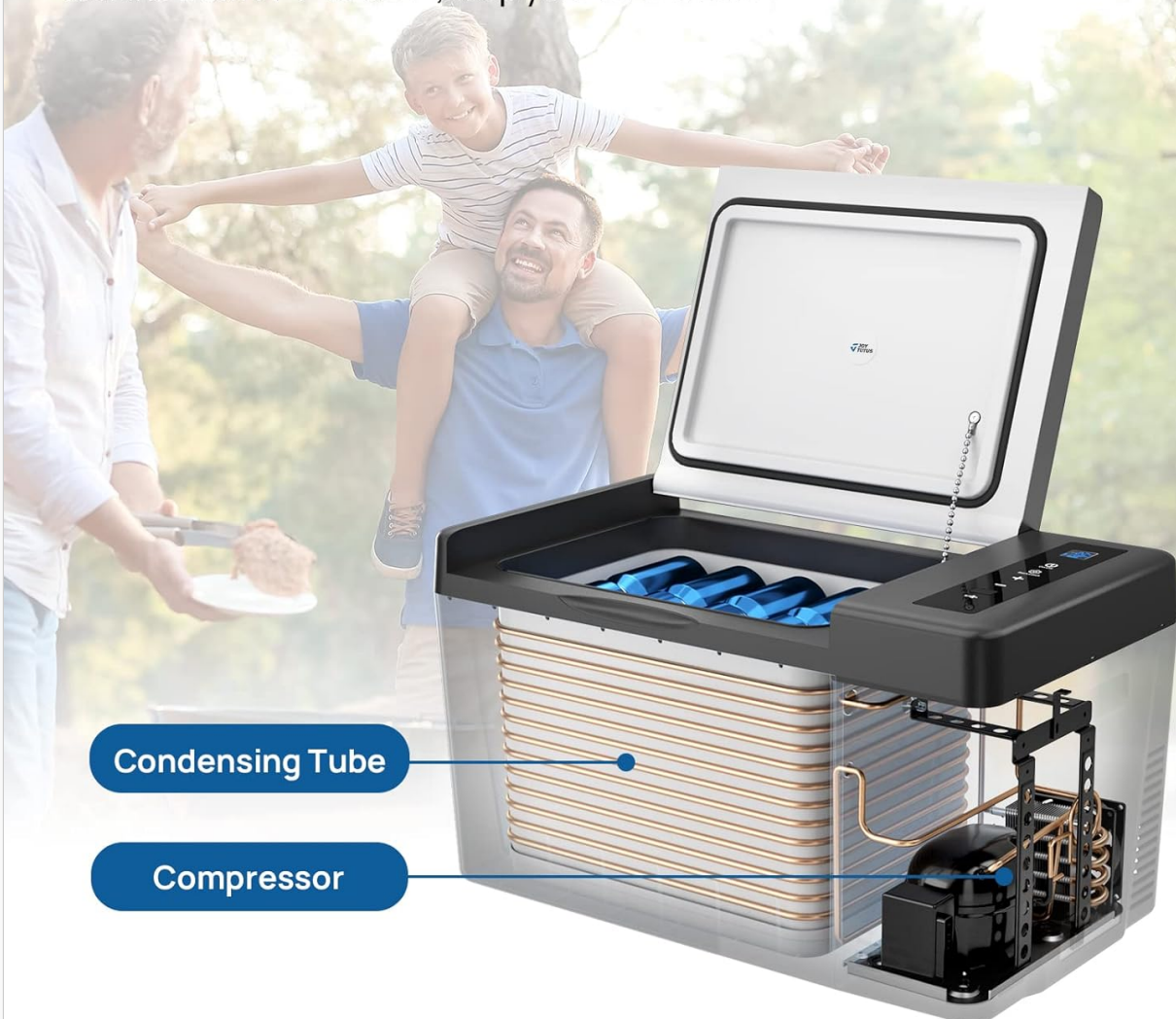
Figure 5: Visual representation of the rapid cooling mechanism, highlighting the condensing tube and compressor.

15 mins from 77°F to 32°F, keep your food fresh.