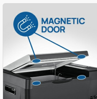
Figure 8: Close-up view of the magnetic door mechanism, ensuring a secure and energy-efficient seal.