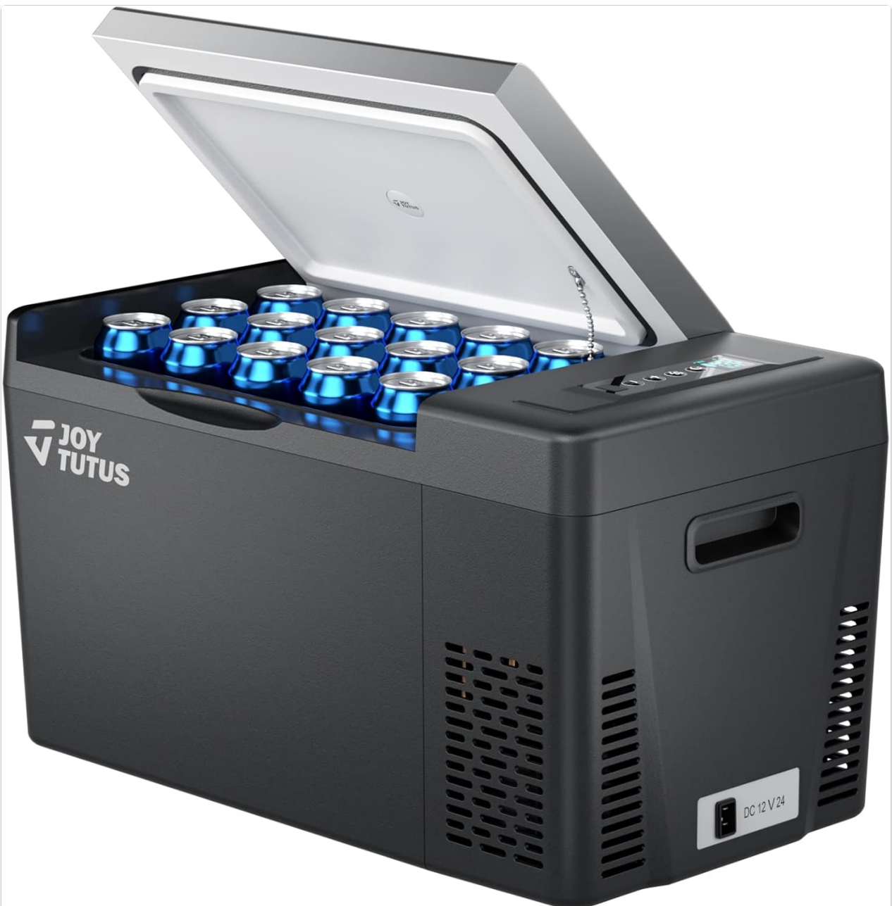
Figure 7: The interior of the 23-quart fridge, demonstrating its capacity to hold multiple beverage cans.