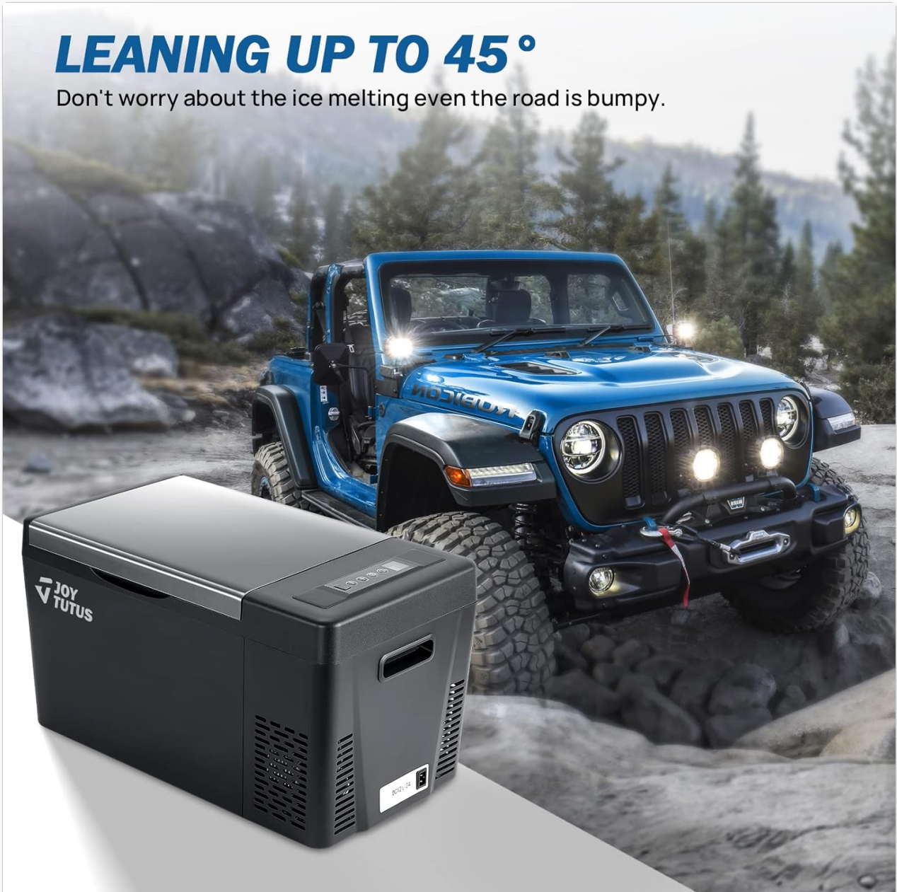
Figure 4: The portable fridge demonstrating its ability to operate effectively even when tilted, suitable for uneven terrains during travel.

Don't worry about the ice melting even the road is bumpy.