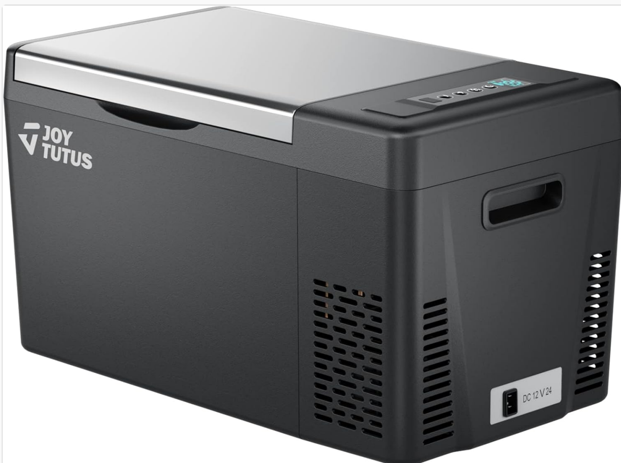
Figure 1: The JOYTUTUS Portable Refrigerator Fridge, a compact and versatile cooling solution.

This manual provides essential information for the safe and efficient operation of your JOYTUTUS Portable Refrigerator Fridge. Designed for versatility, this 23-quart (22L) unit functions as both a refrigerator and a freezer, suitable for vehicle, boat, and home use. It offers reliable cooling performance for camping, travel, and daily needs.