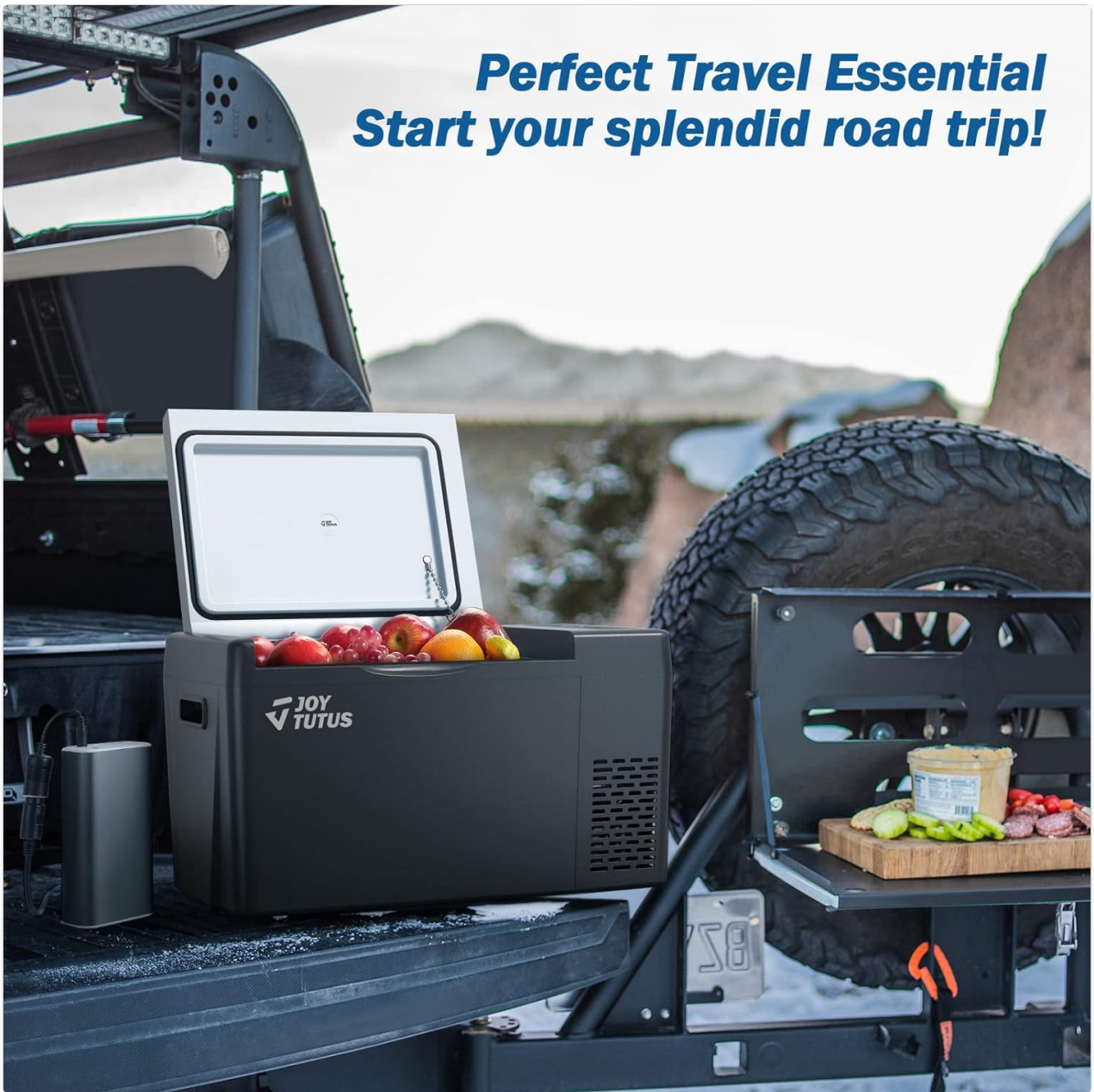
Figure 2: The portable fridge integrated into a travel setup, demonstrating its utility for road trips and outdoor activities.