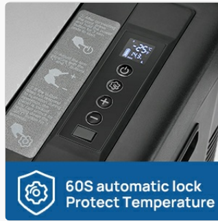
Figure 12: Visual representation of the 60-second automatic lock feature, designed to protect temperature settings.

Your browser does not support the video tag.