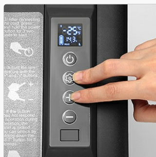
Figure 10: Details on the car battery protection settings (H/M/L) and the power consumption for ECO and MAX modes.