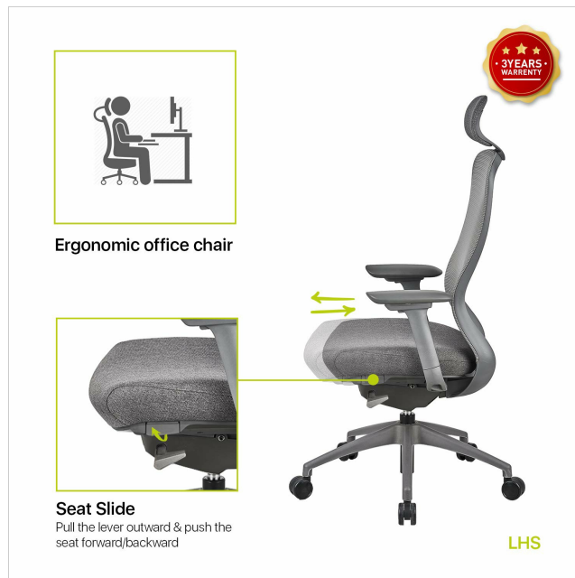
Illustration showing the seat slide function, allowing adjustment of seat depth.