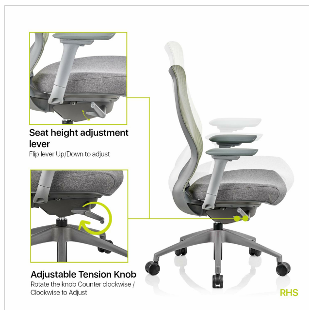
Close-up of the seat height adjustment lever and the adjustable tension knob on the right side of the chair.