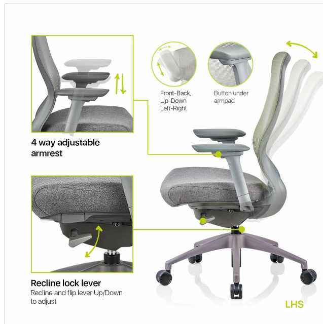
Illustration of the 4-way adjustable armrest, showing its various movement capabilities.