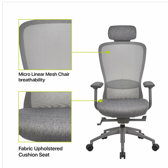
Detail of the micro linear mesh chair back for breathability and the fabric upholstered cushion seat.