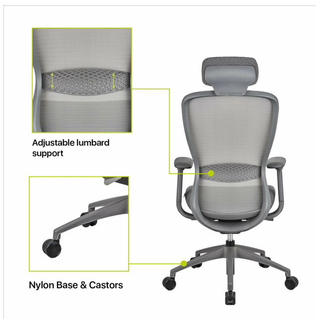
Close-up of the chair's nylon base and castors, highlighting their attachment points.