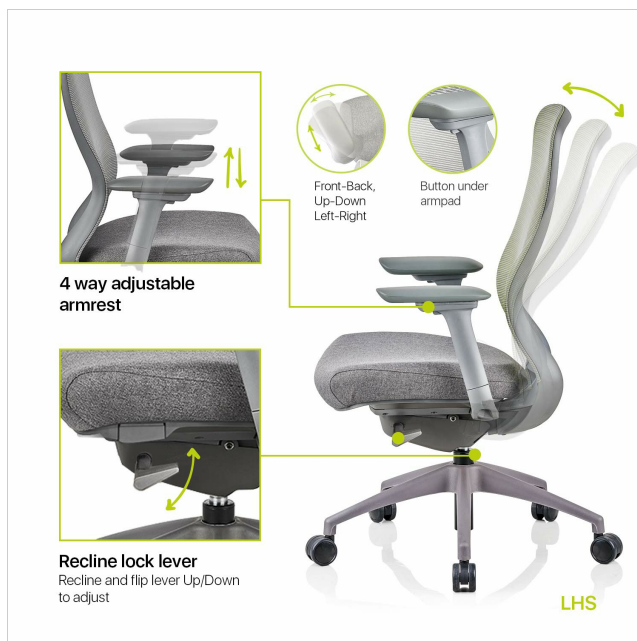
Image showing various components of the Featherlite Helix chair, including the chair back, seat with mechanism, base, castors, gas lift, arms, and headrest.