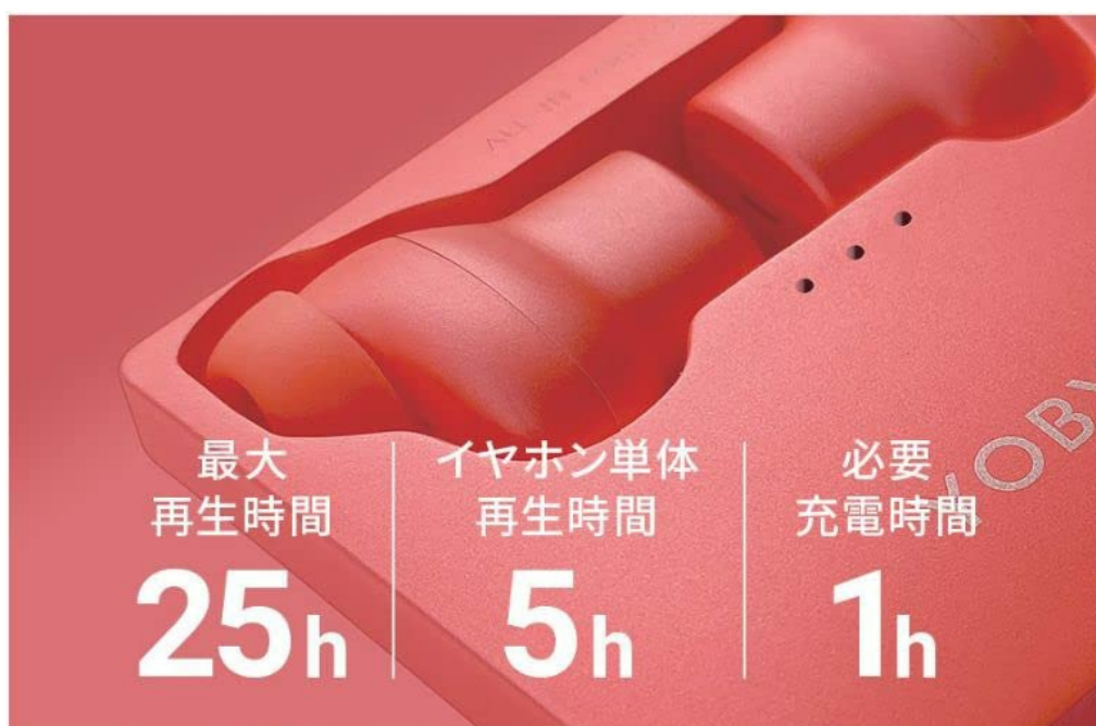
Figure 3.1: Battery life and charging overview.