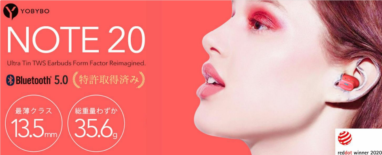
Image: A person wearing the YOBYBO NOTE20 earphone, demonstrating its compact and discreet fit.