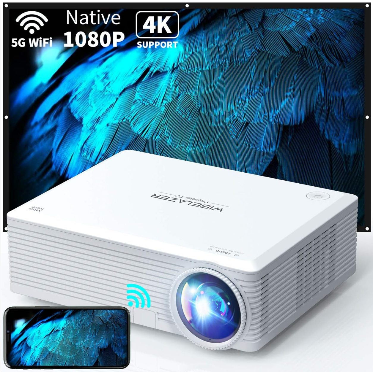
Image: The WISELAZER S20 projector, showcasing its compact design and key features like 5G WiFi and 4K support.