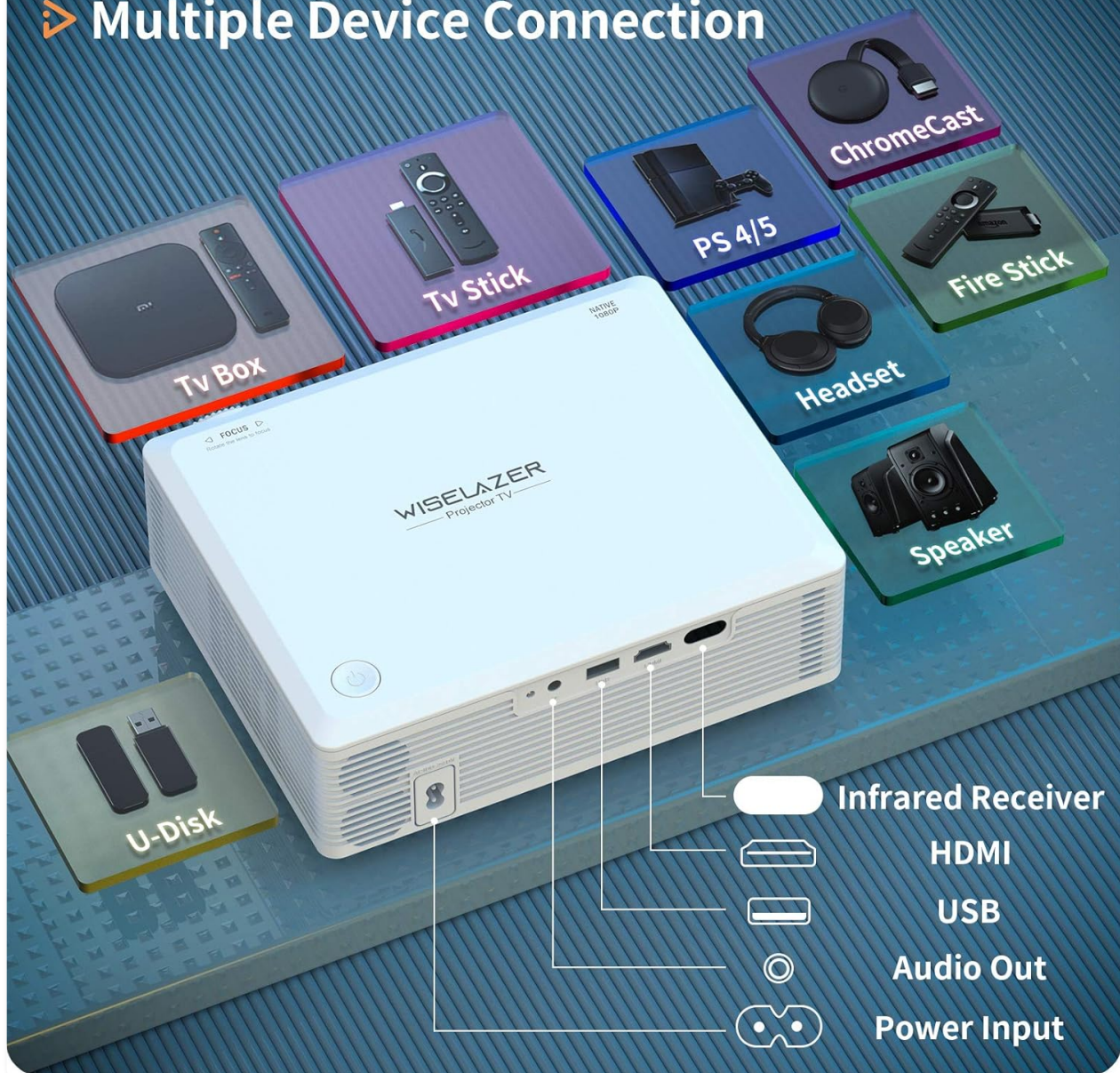
Image: Rear view of the WISELAZER S20 projector, highlighting its various input ports including HDMI, USB, and audio out.