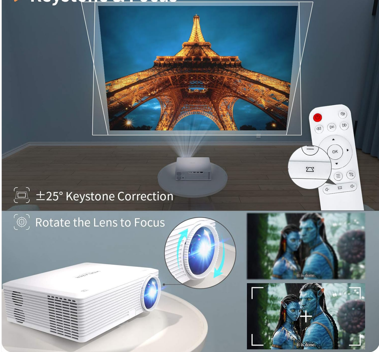
Image: Illustration of the projector's keystone correction and focus adjustment features, crucial for optimal image display.