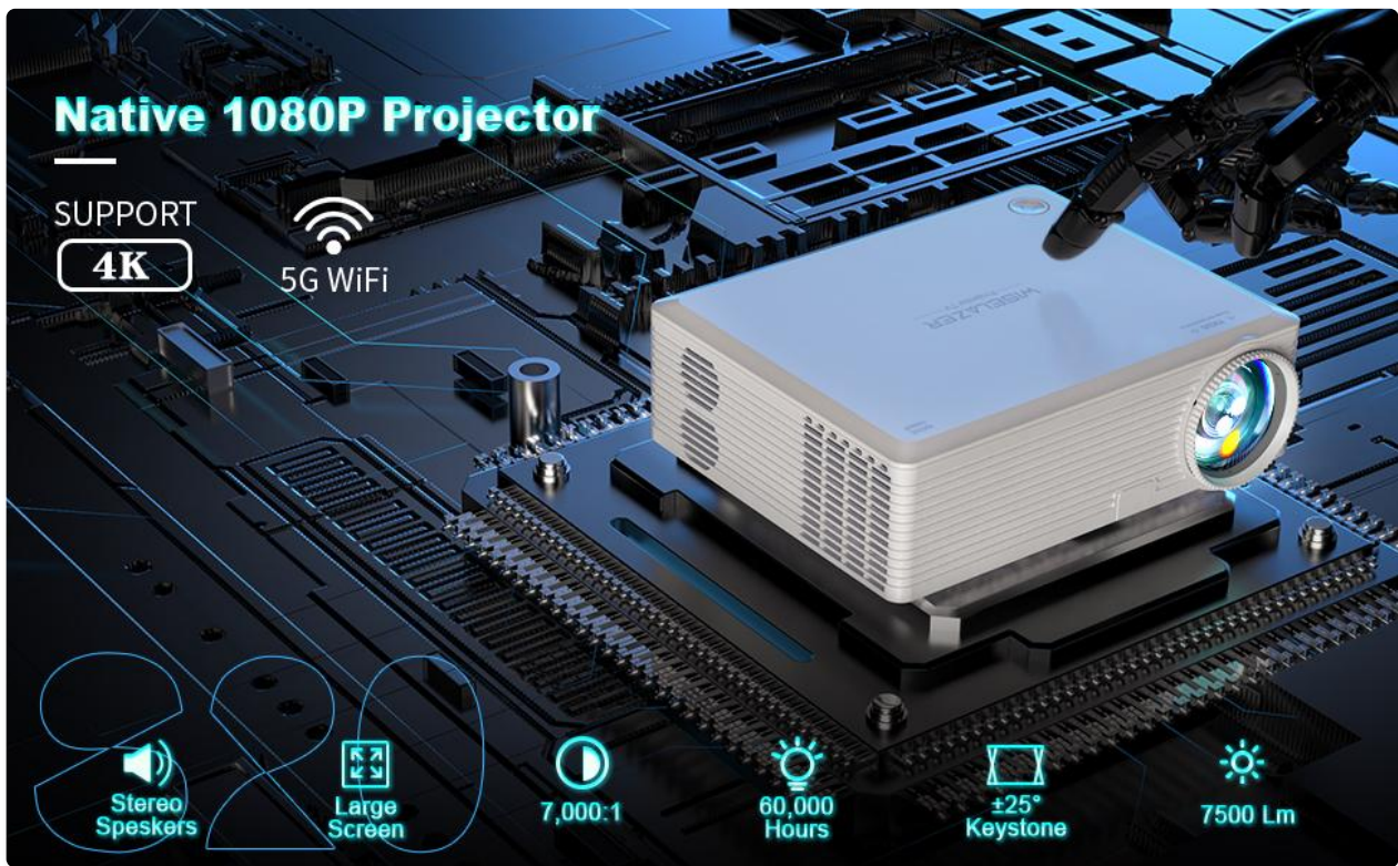
Image: An overview of the WISELAZER S20 projector's core features, including stereo speakers, large screen capability, 7000:1 contrast, 60,000-hour lamp life, keystone correction, and brightness.