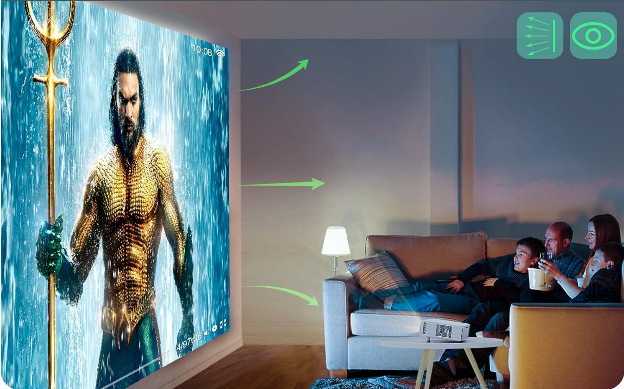
Image: Visual representation of the projector's eye care features, emphasizing clear image projection across the entire screen to reduce eye strain.