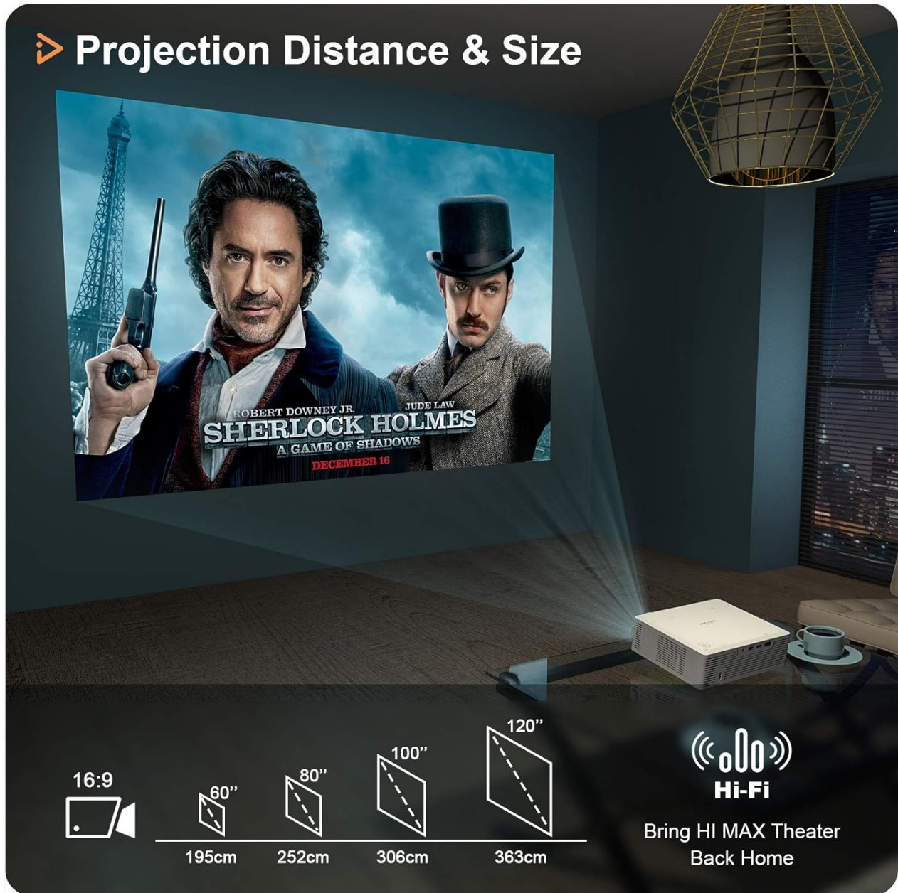
Image: Visual guide for optimal projection distances and corresponding screen sizes (60", 80", 100", 120") for the WISELAZER S20 projector.