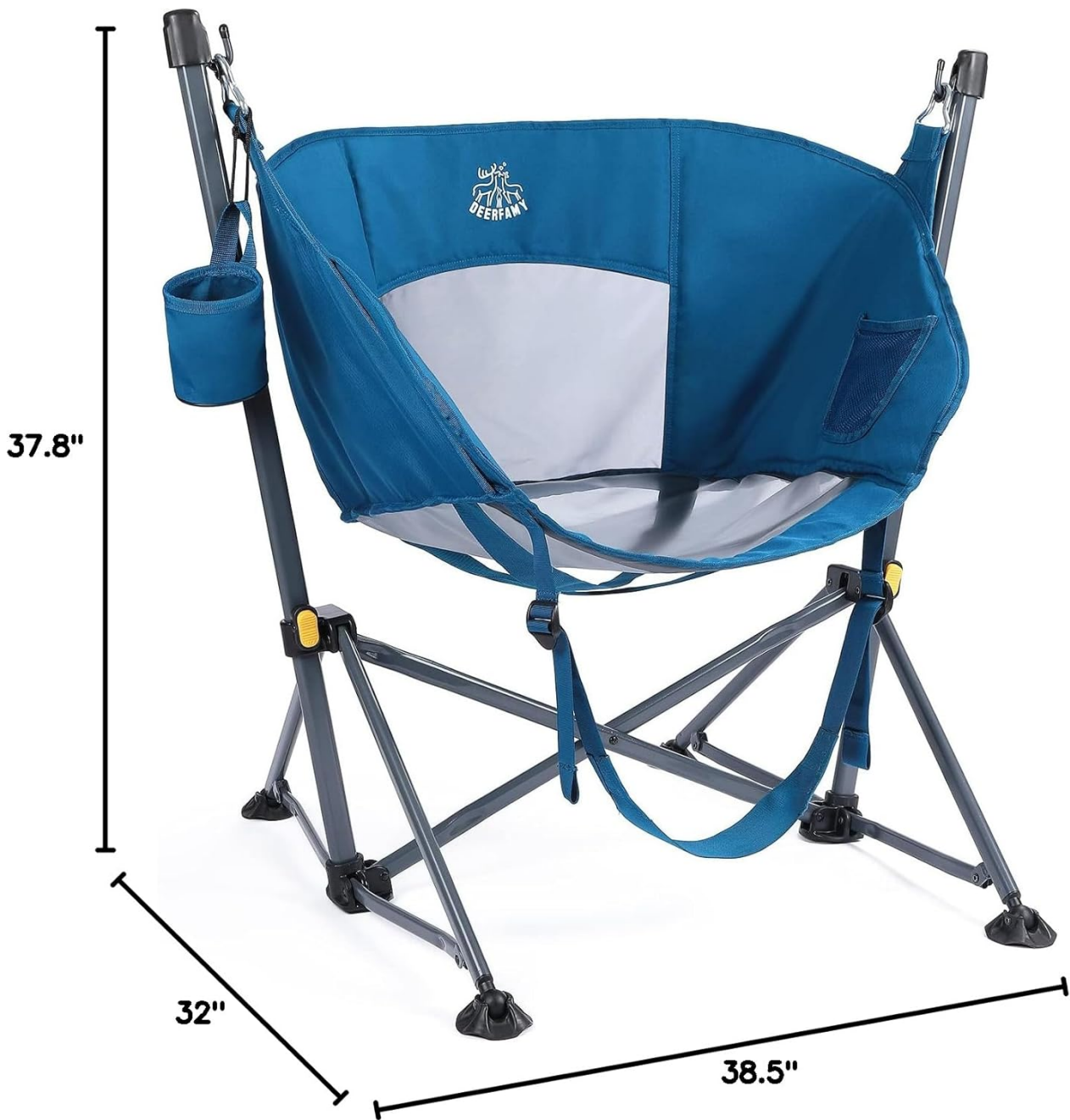
Figure 6: Product dimensions for the DEERFAMY Hammock Chair.