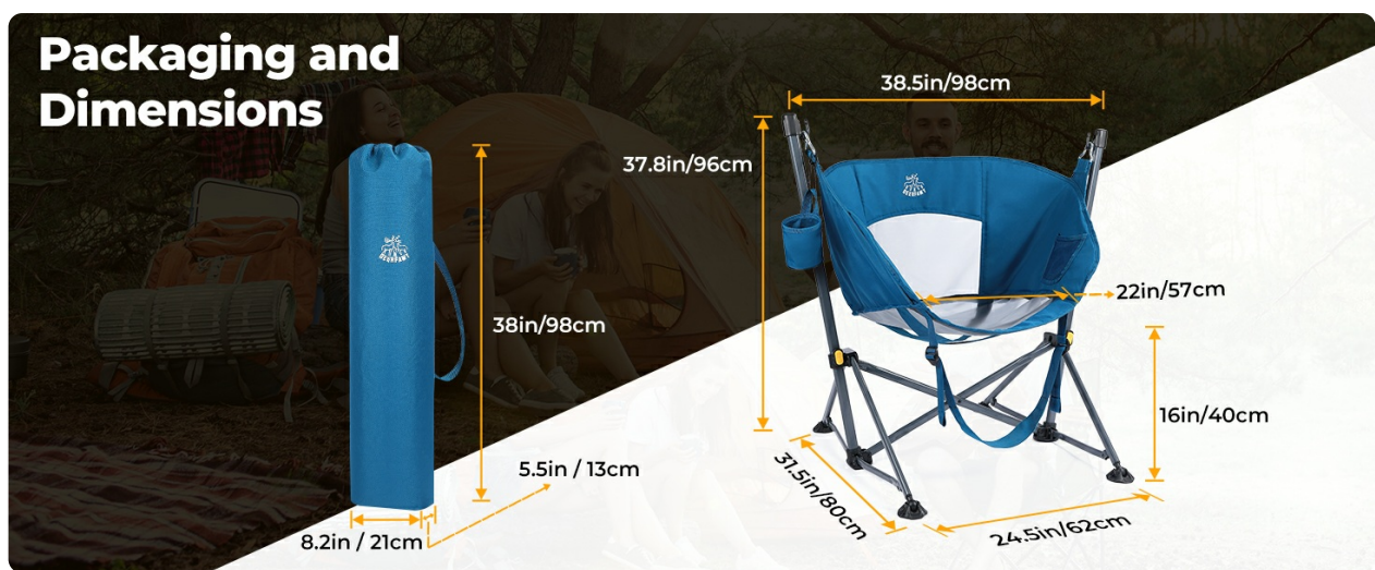
Figure 7: Detailed packaging and unfolded dimensions of the hammock chair.