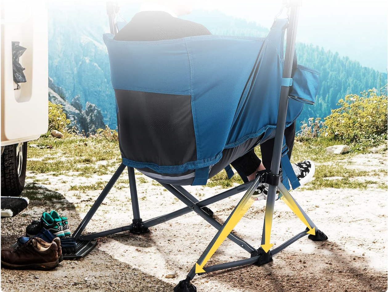
Figure 4: The chair in use, showcasing its robust design with a 350 lbs weight capacity, constructed from thickened steel and 600D polyester fabric.