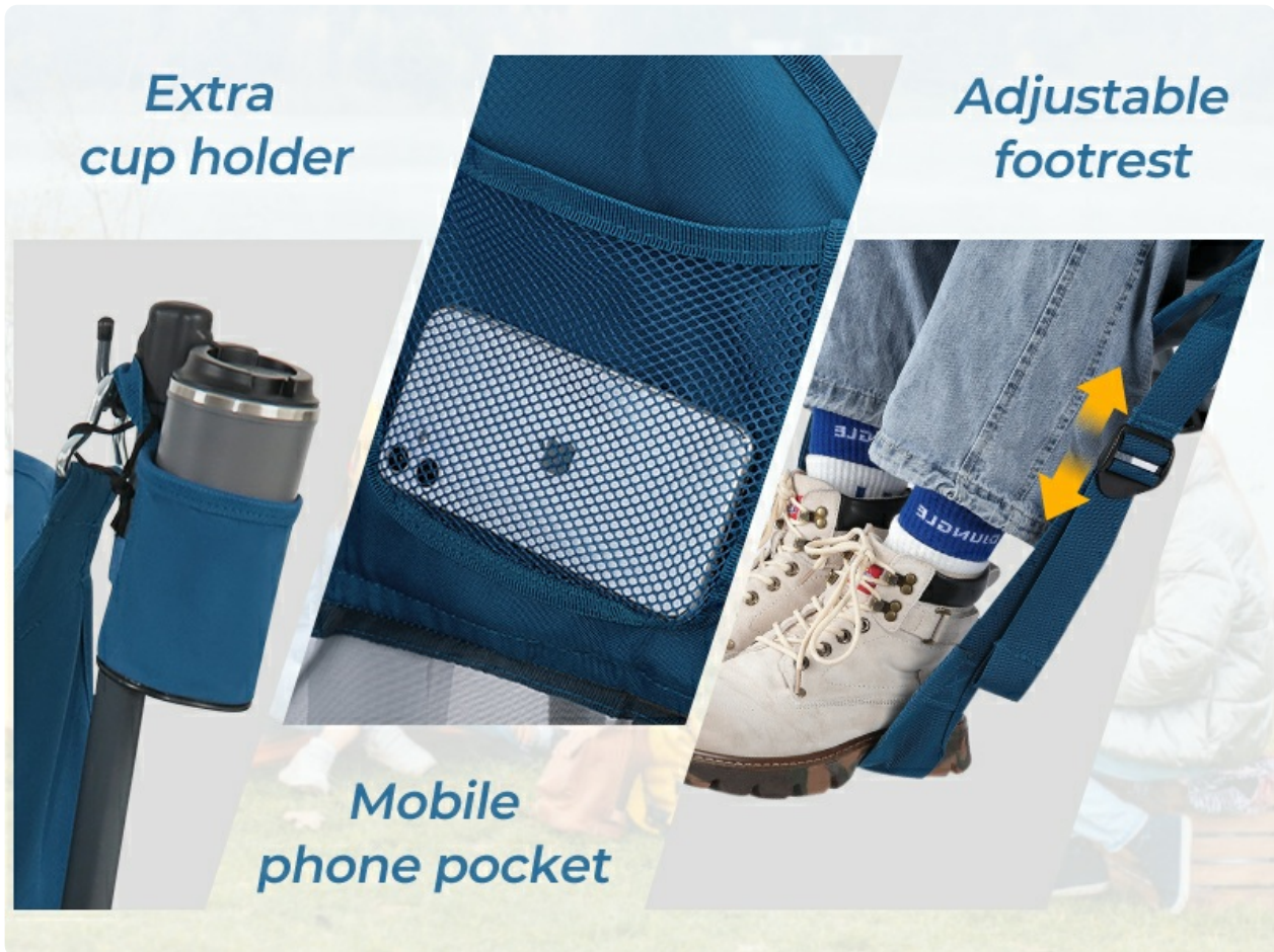
Figure 3: Enhanced features including an extra cup holder, a mobile phone pocket, and an adjustable footrest for user convenience.