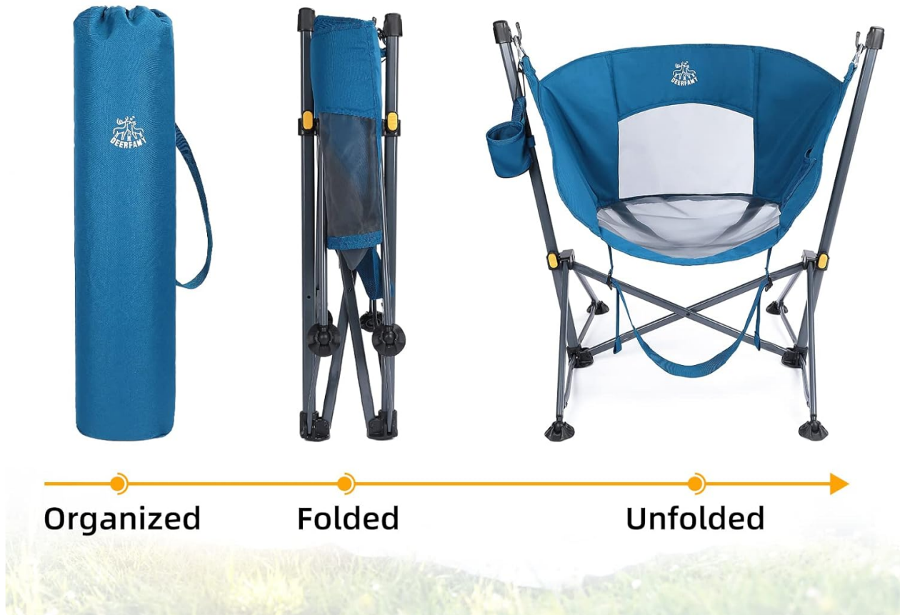
Figure 1: Easy setup and folding process. The image displays the chair in three stages: organized in its storage bag, folded, and fully unfolded for use.