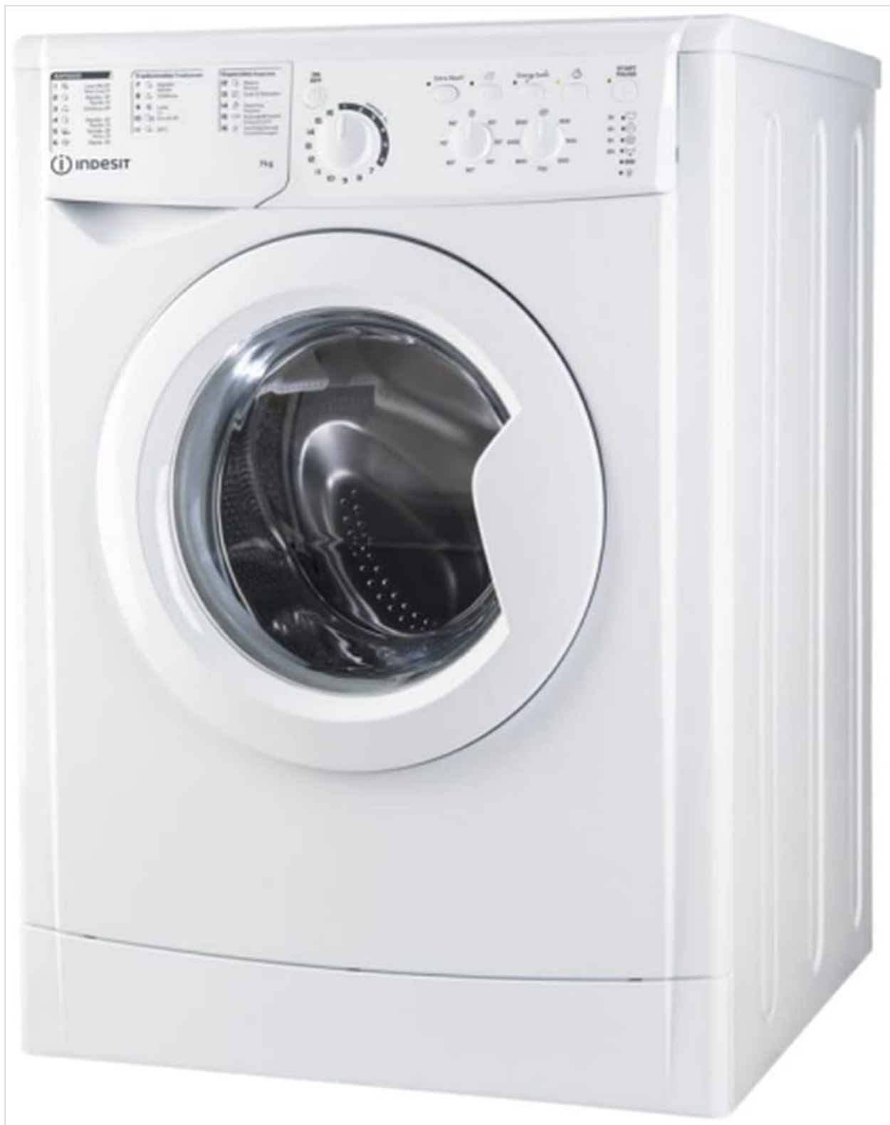
Figure 1: Indesit EWC 71252 W SPT N Washing Machine

The Indesit EWC 71252 W SPT N is a freestanding, front-loading washing machine designed for household use. It features a 7 kg capacity, multiple wash programs, and a maximum spin speed of 1200 rpm, ensuring efficient and thorough cleaning of your laundry.