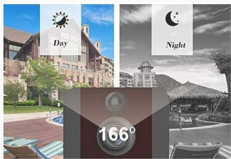
Image: A visual representation comparing the doorbell's view during the day (color) and at night (monochrome infrared), demonstrating the 166-degree wide-angle lens.