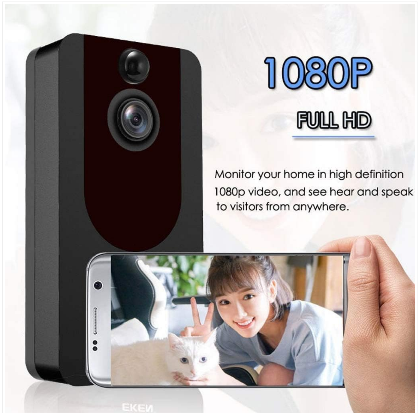
Image: The EKEN V7 Video Doorbell shown next to a smartphone displaying a live 1080P Full HD video feed, illustrating remote monitoring capabilities.