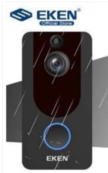
Image: The EKEN V7 Video Doorbell depicted with rain effects, illustrating its weather-resistant design suitable for outdoor installation.