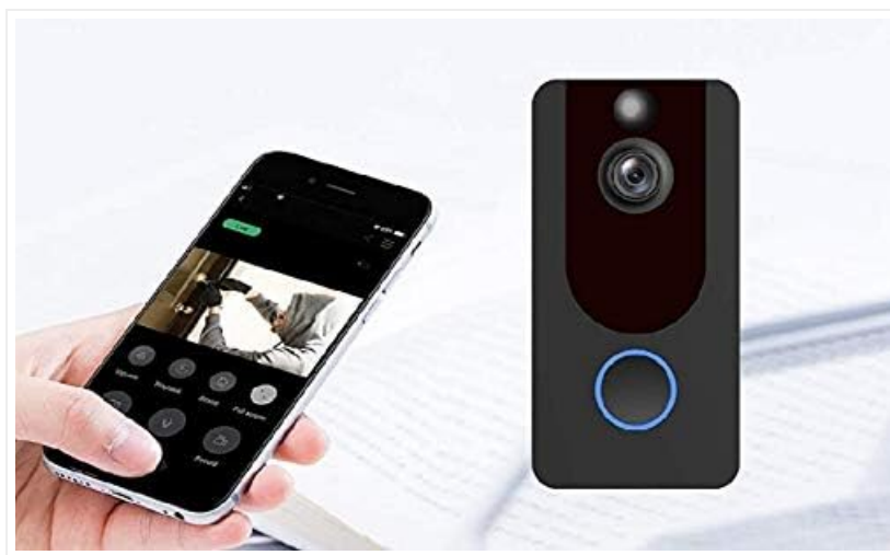
Image: Front view of the EKEN V7 Video Doorbell, showing the camera lens, motion sensor, and illuminated doorbell button.

The EKEN V7 Video Doorbell is a smart security device designed to provide real-time video monitoring and two-way audio communication with visitors at your door. It features 1080P Full HD resolution, night vision, and a wide-angle lens for comprehensive coverage.