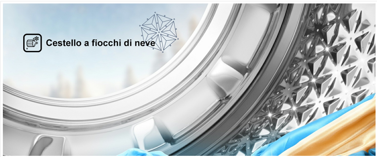
Figure 9: The interior of the Snowflake Drum, designed to provide a gentle yet effective wash.