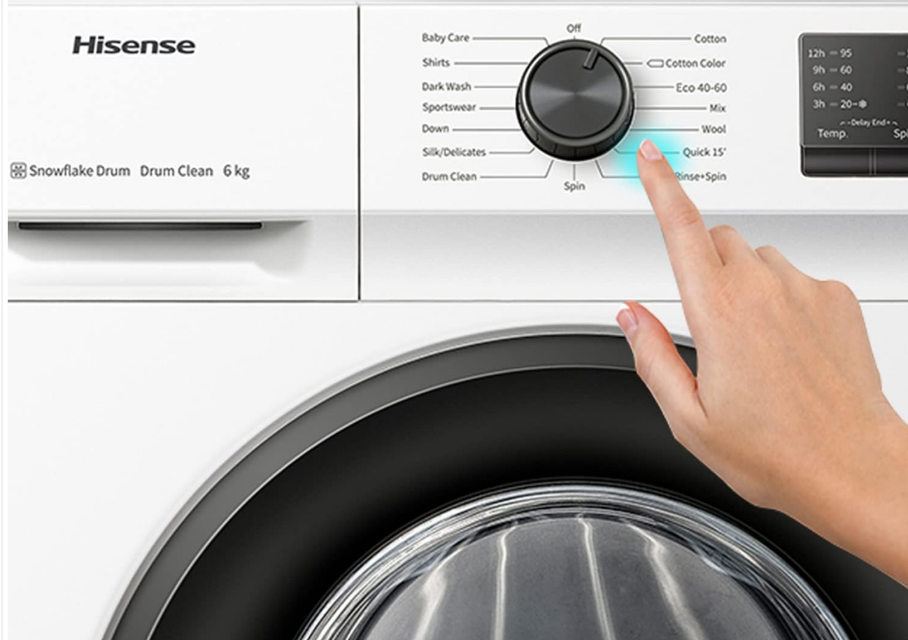
Figure 4: A hand turning the control dial to select a wash program.