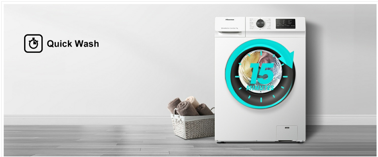
Figure 5: The Quick Wash program allows for fast cleaning of lightly soiled garments in 15 minutes.

Use the touch controls to adjust temperature, spin speed (up to 1000 rpm), or activate special functions like Delay Start or Child Lock.