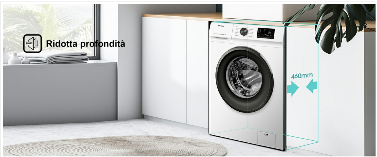
Figure 3: The slim depth of the washing machine (460mm) allows for flexible placement in various spaces.