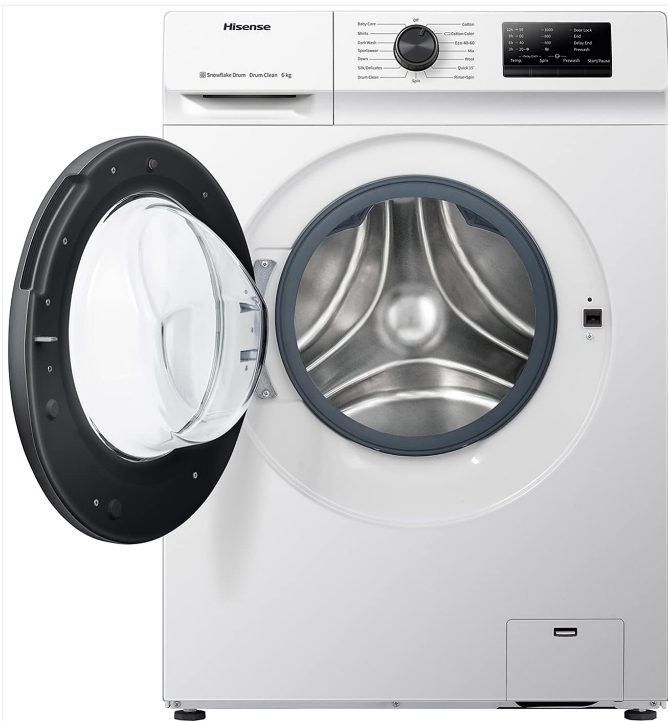
Figure 2: The washing machine with its door open, showcasing the stainless steel drum interior.