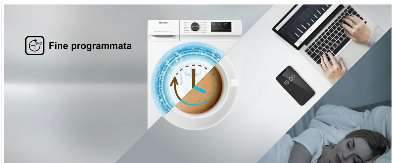
Figure 6: The Delay End function allows you to set the washing machine to finish at a later time, offering convenience for your schedule.