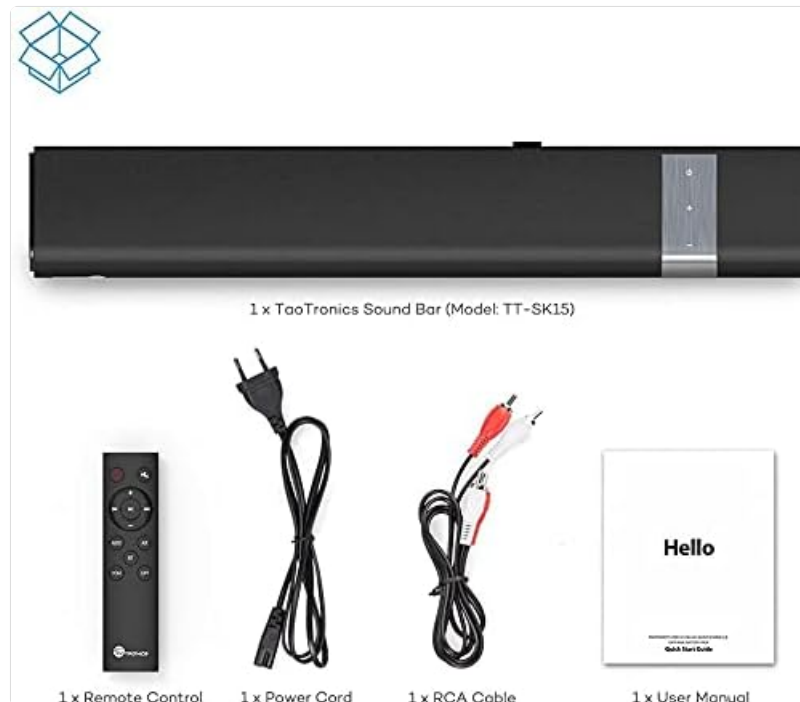
Figure 2: Package contents include the TaoTronics Sound Bar (Model: TT-SK15), a remote control, a power cord, an RCA cable, and a user manual.

Carefully remove all components from the packaging. Ensure all items listed below are present. If any items are missing or damaged, contact customer support.