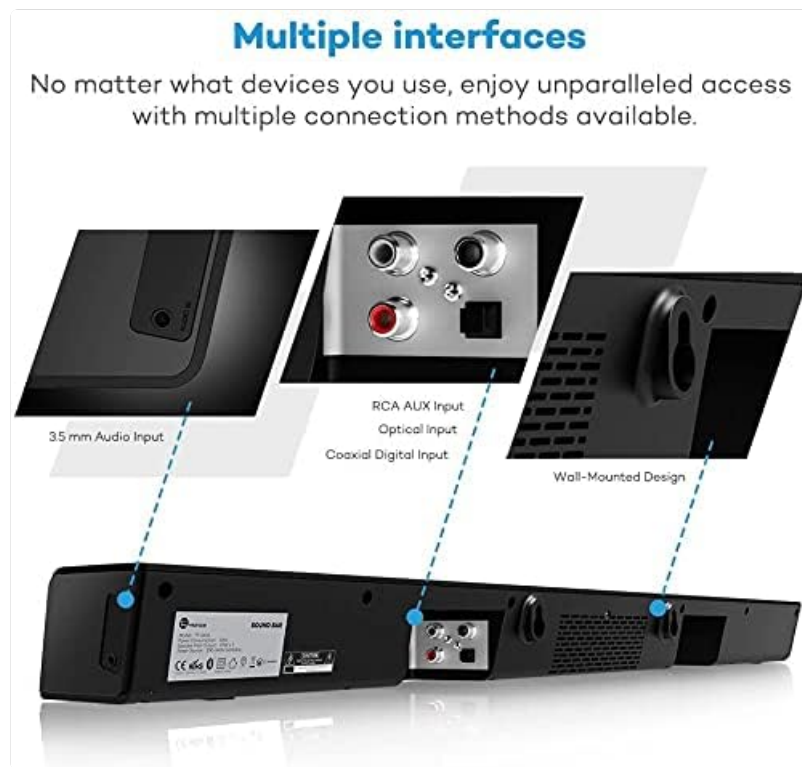
Figure 4: The back panel of the TT-SK15 Sound Bar, highlighting its multiple input interfaces: 3.5mm Audio Input, RCA AUX Input, Optical Input, Coaxial Digital Input, and wall-mounted design features.