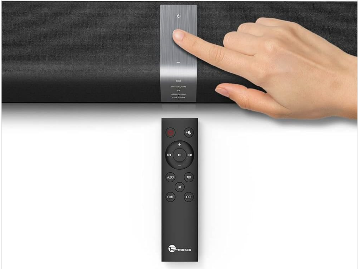
Figure 5: The TT-SK15 Sound Bar features both touch controls on the unit and a full-function remote control for convenient operation, including input selection and volume adjustment.

Dual controls let you enjoy crisp audio however you like.