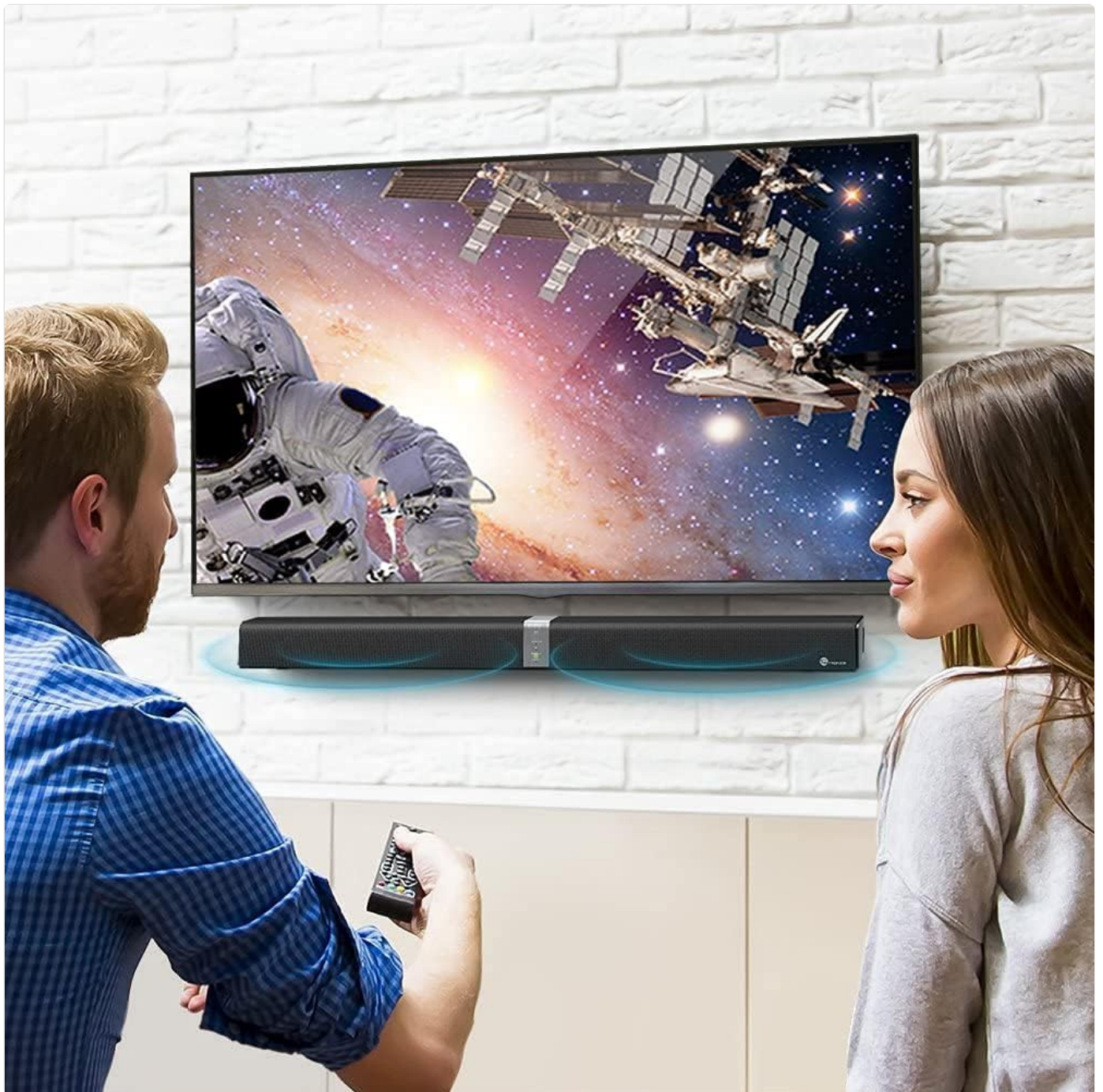
Figure 3: The TT-SK15 Sound Bar positioned below a television, demonstrating a typical setup for enhanced audio. The sound bar can be placed on a stand or wall-mounted.