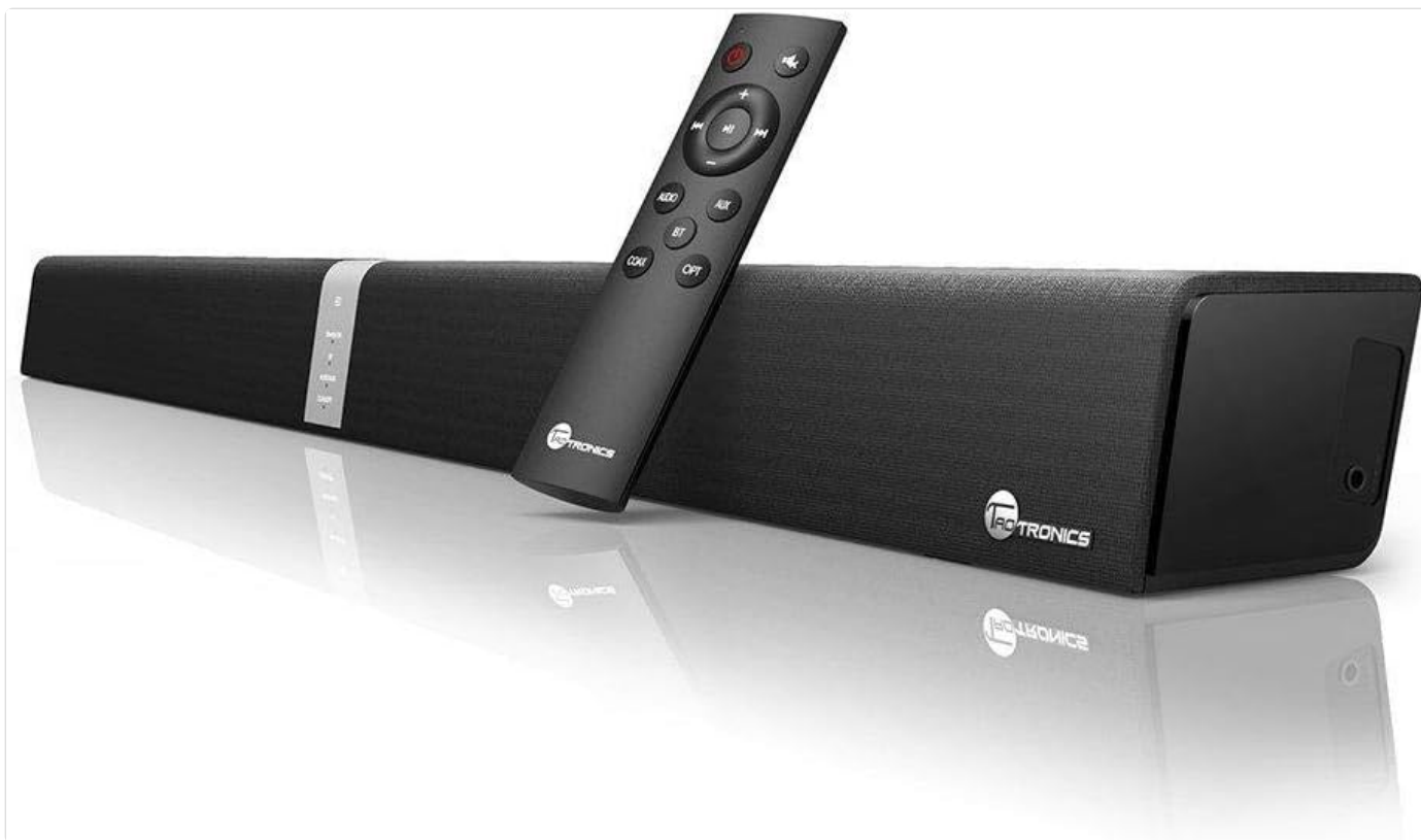
Figure 1: TaoTronics TT-SK15 Sound Bar and its remote control. The sound bar is sleek and black, designed to fit seamlessly into any home entertainment setup.

This user manual provides detailed instructions for the setup, operation, and maintenance of your TaoTronics TT-SK15 Sound Bar. Please read this manual thoroughly before using the product to ensure proper functionality and to maximize your audio experience. The TT-SK15 is a versatile 2.0 channel sound bar designed to enhance your home theater system with powerful sound, offering both wired and wireless connectivity options.