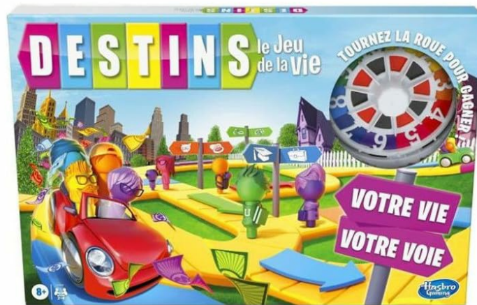
Image 1.1: A family engaged in playing Destins The Game of Life, illustrating the game board, spinner, player cars, and game money in use.