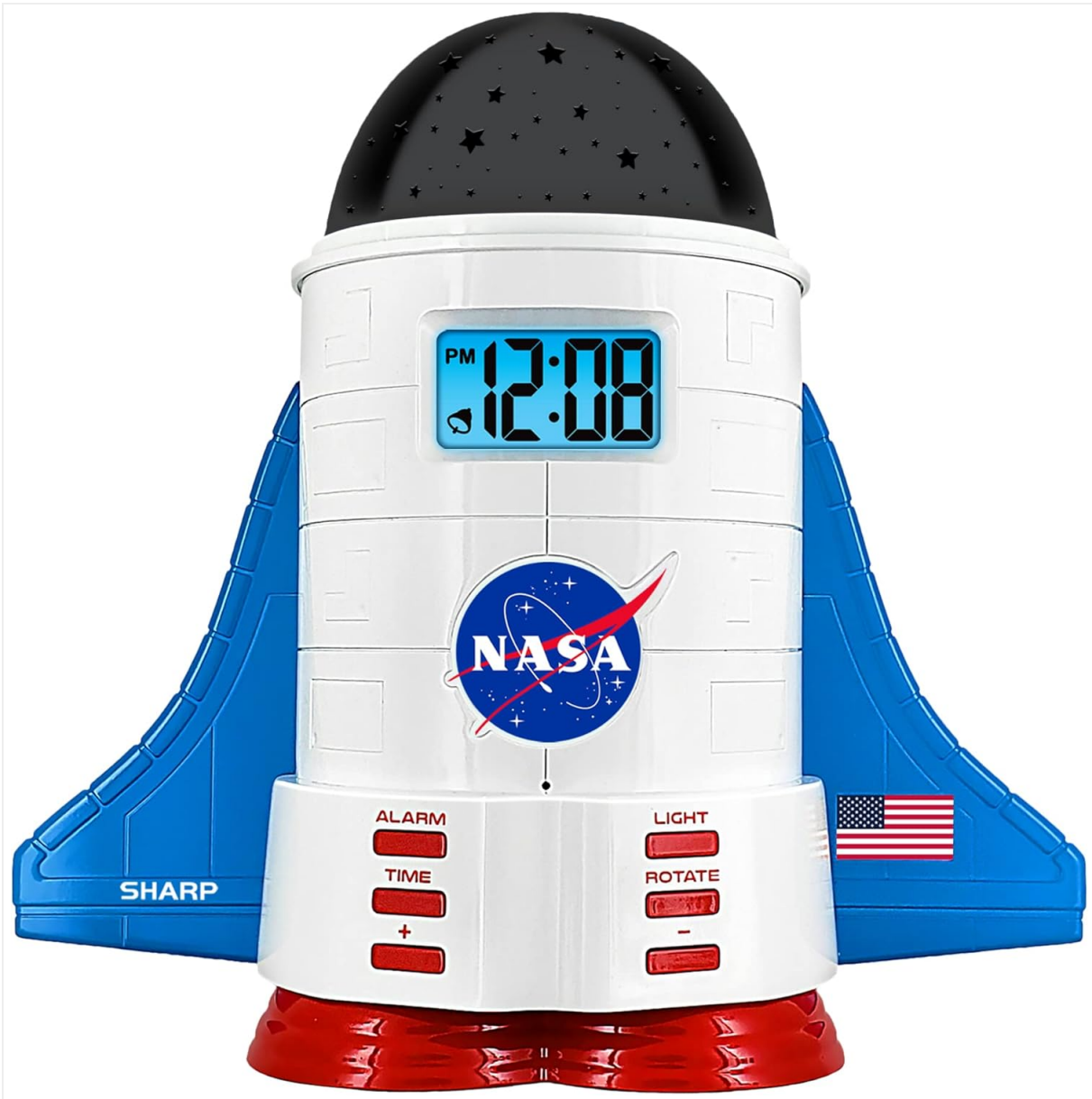
Front view of the Sharp NASA Space Shuttle Night Light Alarm Clock, displaying the time 12:08 on its LCD screen, with blue wings and red thrusters.